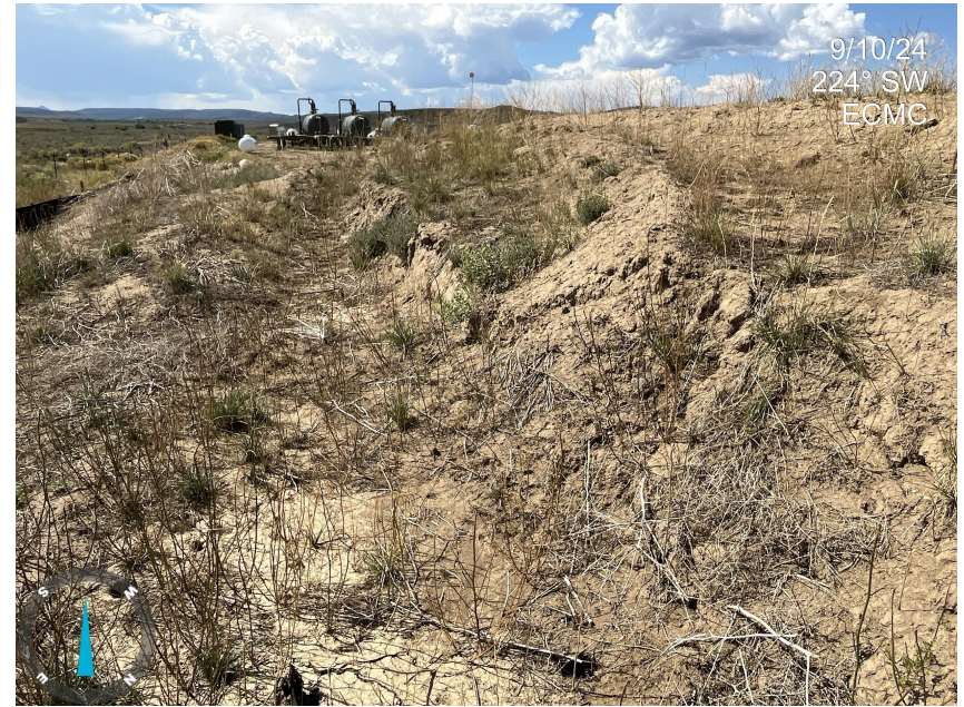
Photo 8. Photo taken from the northeastern edge of the topsoil stockpile, facing SW. Photo illustrates erosion along the topsoil sides. Comply with Rule 1002.c. to implement long-term BMP stabilization and to help prevent weed establishment.