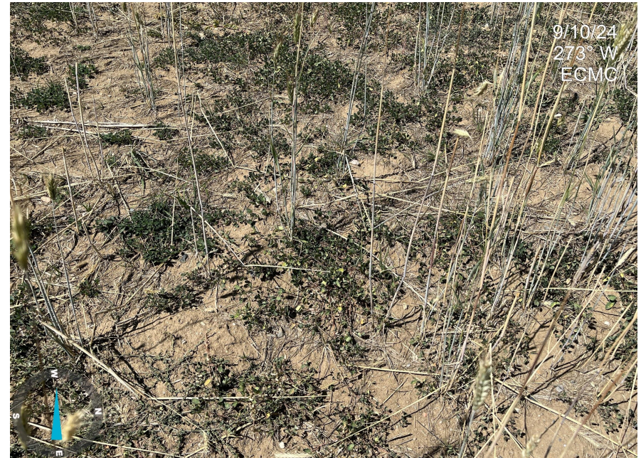
Photo 14. Photo taken from the western interim reclamation area, facing west. Photo illustrates weeds within the interim area.