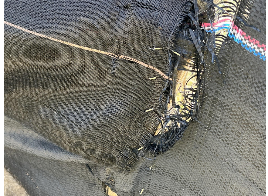
Photo 10. Photo taken of the silt fence, which attempted to be repaired but does not appear to be functioning properly per good engineering practices.