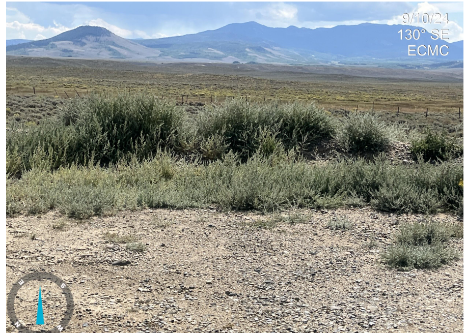
Photo 2. Photo taken at the SE portion of the Location, facing SE. Weeds observed growing on the berms and along other portions of the perimeter.