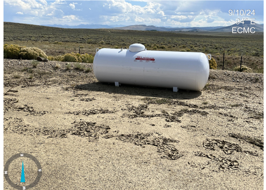
Photo 4. Photo taken from the eastern working pad surface, facing east. Photo illustrates an unused tank.