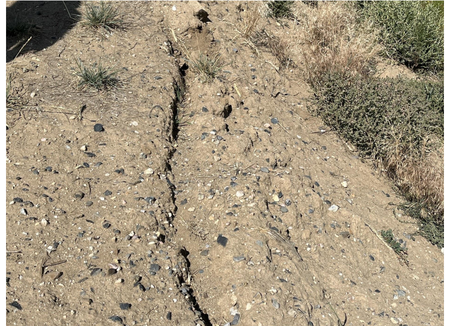
Photo 12. Photo taken from the top of the stockpile topsoil. Photo illustrates erosion occurring along the topsoil pile. Operator shall comply with 1002 rules.