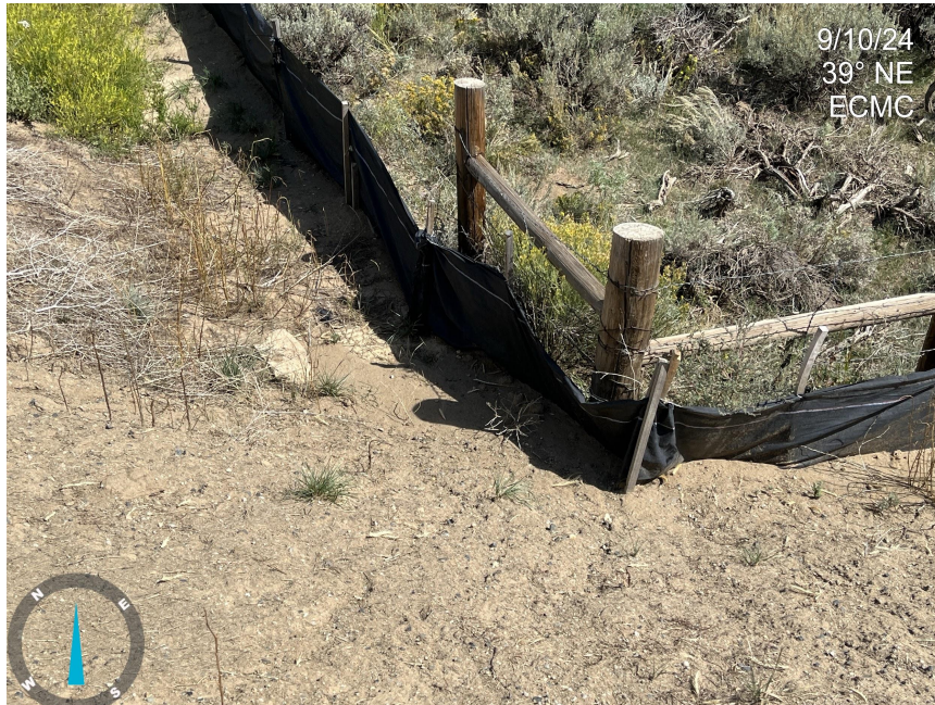
Photo 9. Photo taken from the top of the topsoil stockpile, facing northeast. Photo illustrates the silt fence is inadequate and does not appear to be an appropriate BMP given the snow accumulation in the winter months.