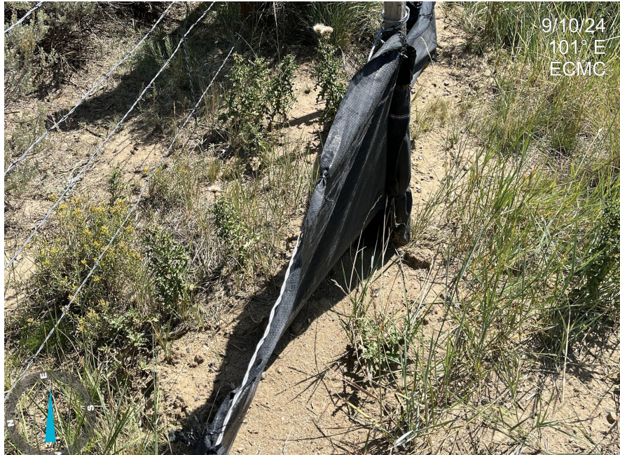
Photo 11. Photo taken from the northwestern edge of topsoil, facing east. Photo illustrates inadequate erosion control BMPs.