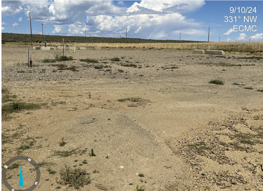
Photo 3. Photo taken from the eastern working pad surface, facing NW. Photo illustrates that some unused equipment was removed. Areas not used for production need to be reclaimed per 1003 Rules.