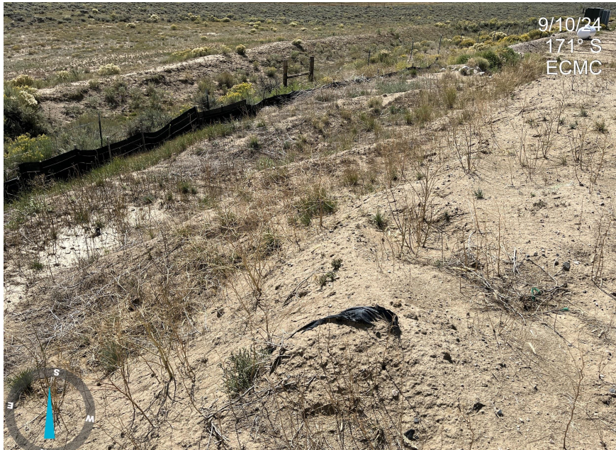
Photo 7. Photo taken from the top of the topsoil pile. Topsoil conditions remain the same as the last inspection. Operator plans to seed and implement stabilization in the fall.