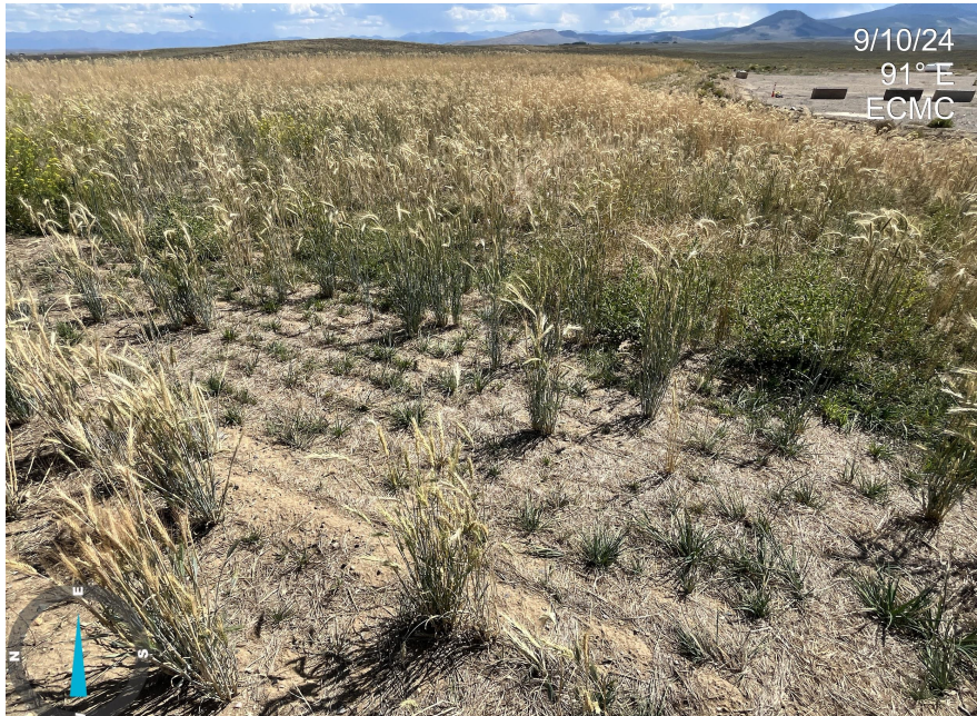
Photo 13. Photo taken from the western interim reclamation area, facing east. Photo illustrates that the seed mix is predominantly introduced species not reflective of reference area vegetation.