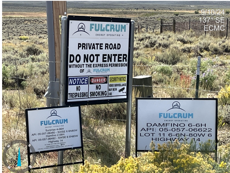
Photo 1. Photo taken from the entrance of Location, illustrating Operator's sign.