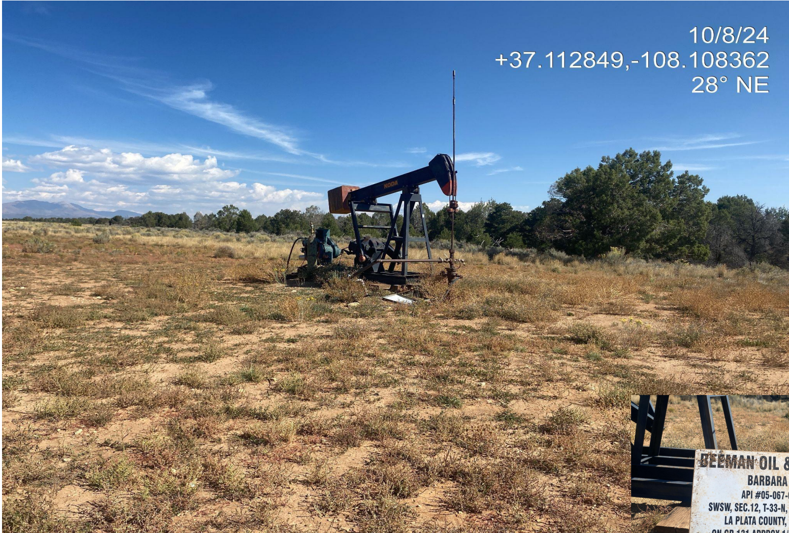
Photo 1. View of the well pad taken from the access point facing center. Note: well sign is no longer standing on its own, sign was propped for photo.