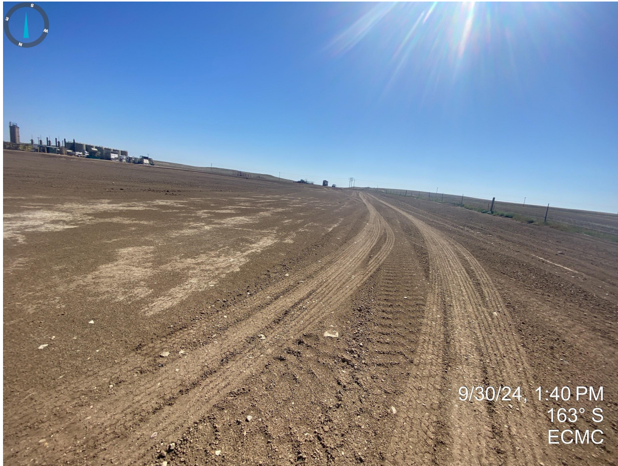
Photo 8. Western interim areas; it appears that topsoil has been imported and spread throughout the interim areas which appear to have been recontoured. No perimeter stormwater controls observed.