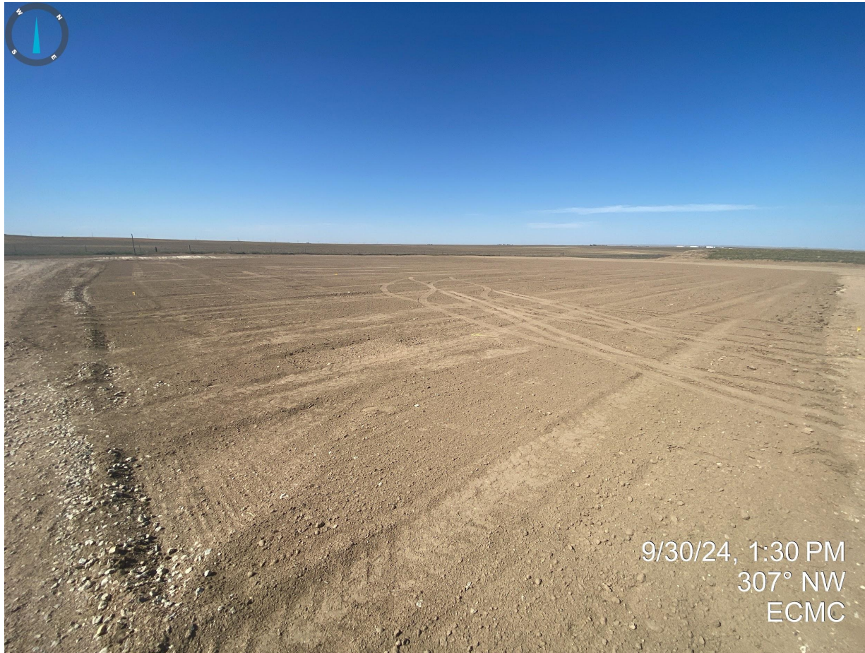
Photo 7. Western interim areas north of the well locations; it appears that topsoil has been imported and spread throughout the interim areas which appear to have been recontoured.