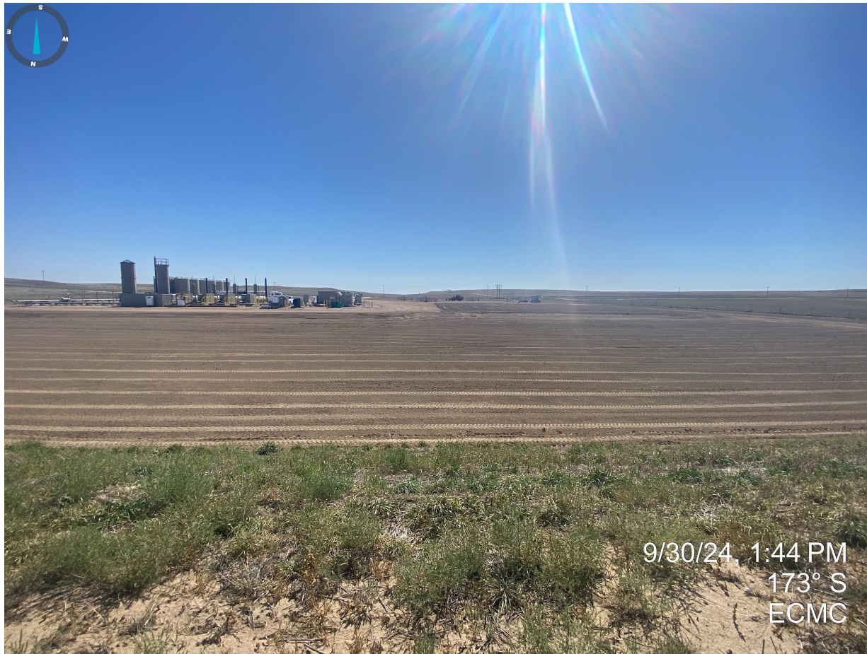
Photo 9. Overview of northern interim areas, facing south from the top of the existing topsoil stockpile.