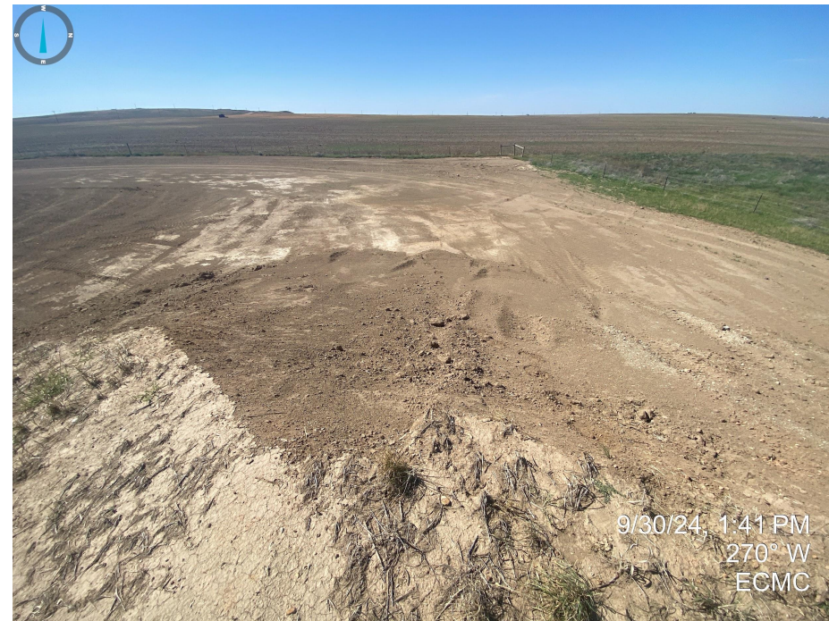
Photos 13 & 14. It appears that topsoil has been removed from the existing stockpile area (western side).