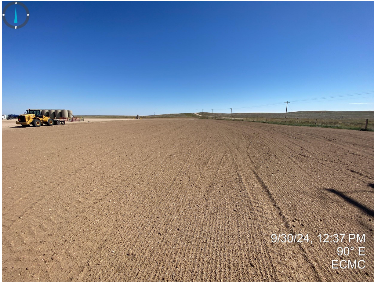
Photo 1. Southwestern interim areas; it appears that topsoil has been imported and spread throughout the interim areas which appear to have been recontoured. No perimeter stormwater controls observed.