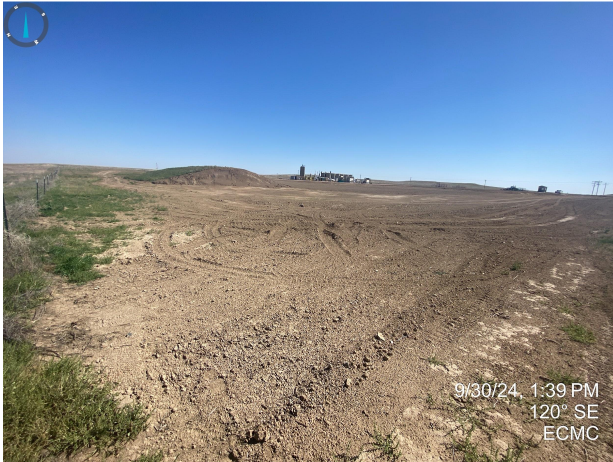
Photo 12. Taken near the northwest corner of the location. Perimeter stormwater control measures appear to have been removed with no apparent control measures/BMPs installed since the previous inspection.