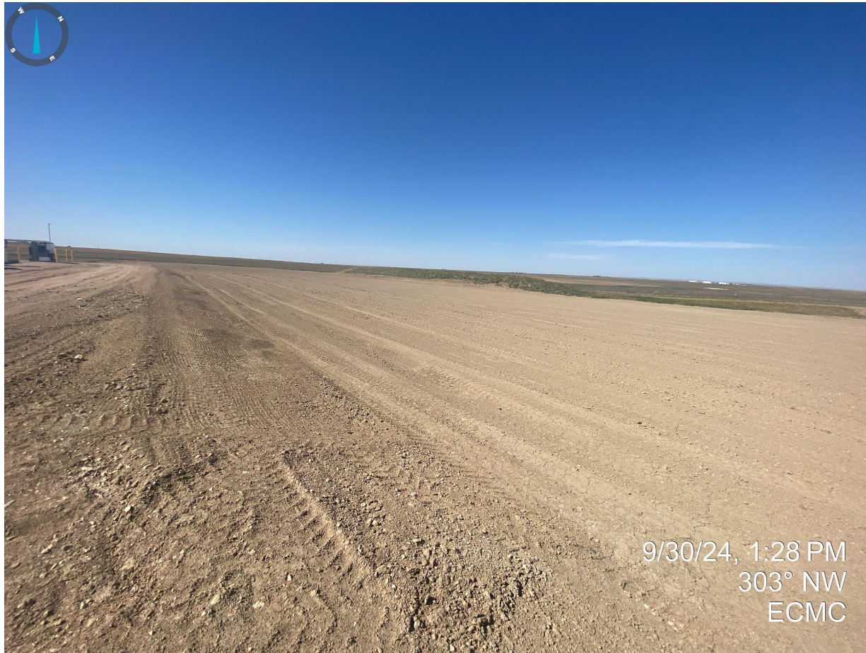
Photo 6. Northern interim areas between production areas and existing topsoil stockpile; it appears that topsoil has been imported and spread throughout the interim areas which appear to have been recontoured.