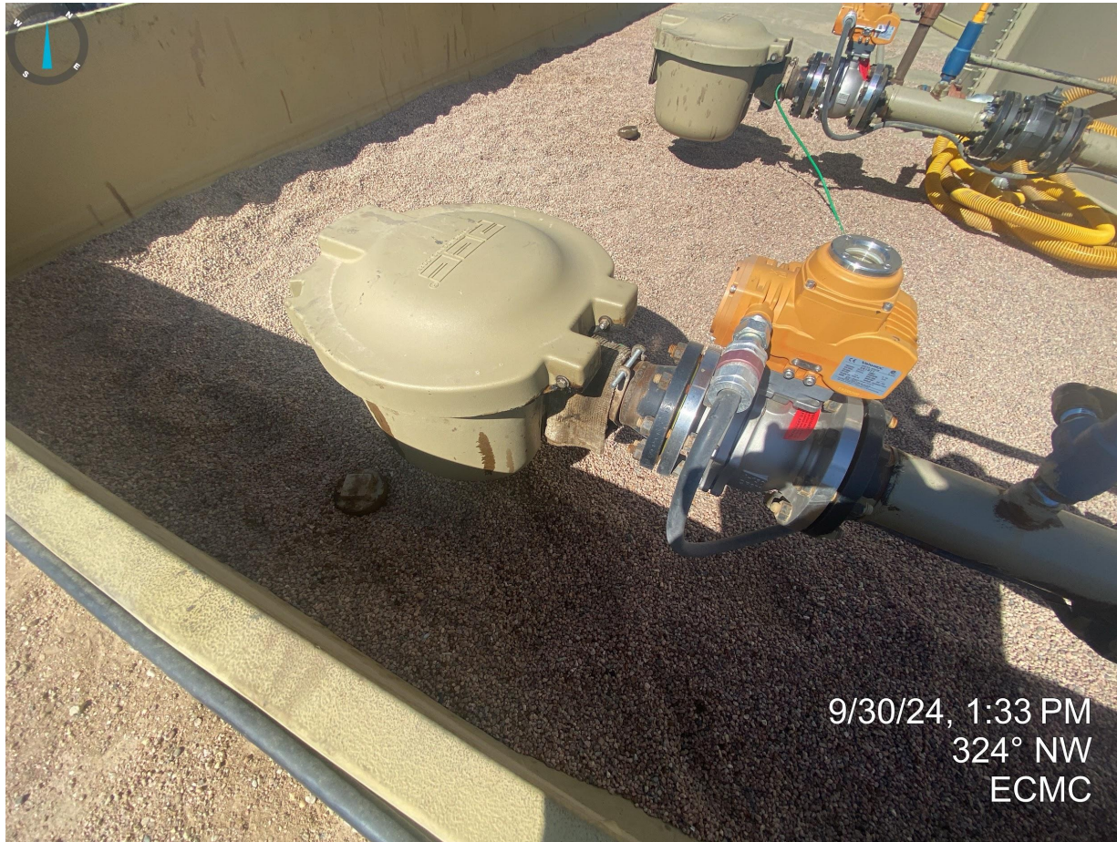
Photo 22. Stained soil previously documented near loadout lines appears to have been removed; trace amounts of stained pea gravel still remains. Operator shall continue to monitor and mague the location for stained soils and implement appropriate BMPs where necessary.