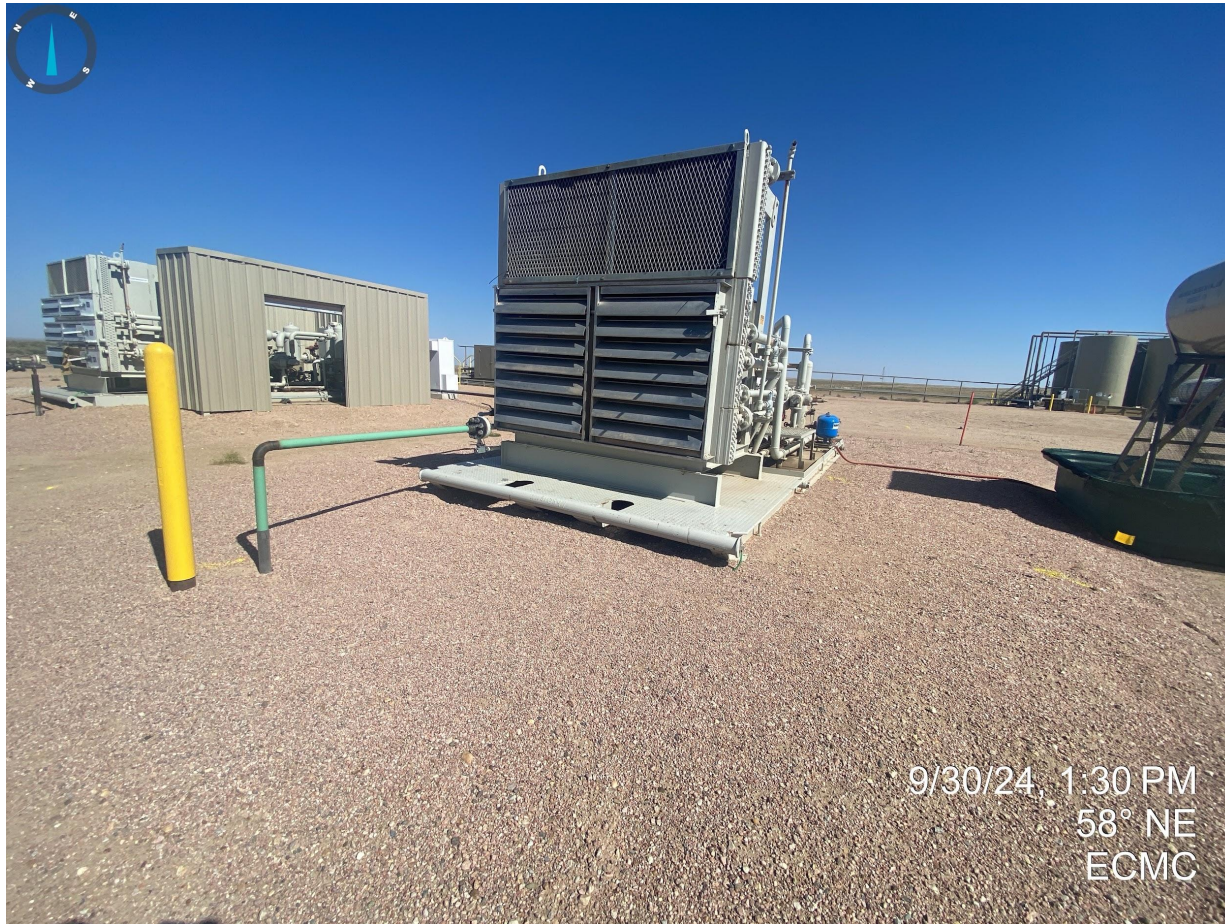
Photo 21. Stained soil previously documented around compressor appears to have been removed.