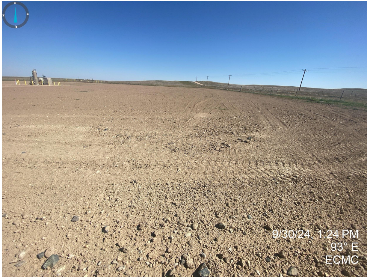
Photo 3. Southeastern interim areas; it appears that topsoil has been imported and spread throughout the interim areas which appear to have been recontoured. No perimeter stormwater controls observed.