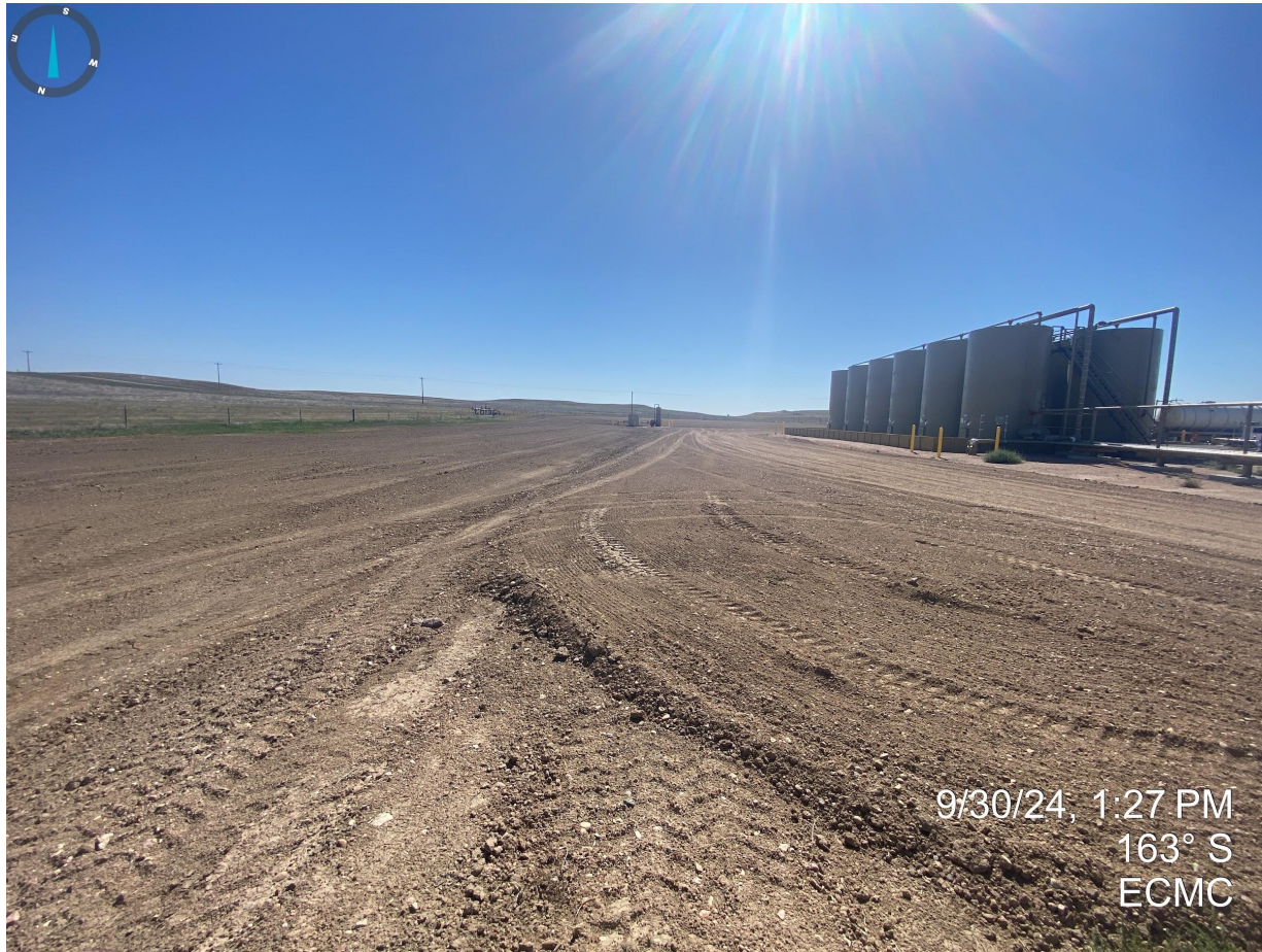
Photo 5. Eastern interim areas; it appears that topsoil has been imported and spread throughout the interim areas which appear to have been recontoured. No perimeter stormwater controls observed.