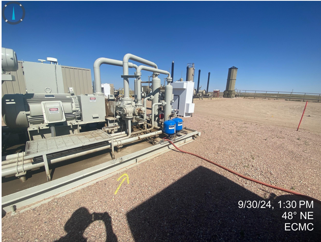
Photo 20. 5 gallon bucket appears to have been removed from the location.