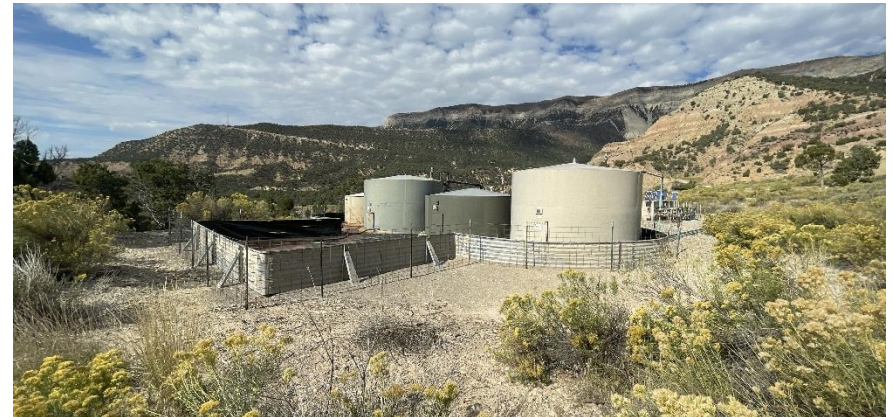
South East corner of location.