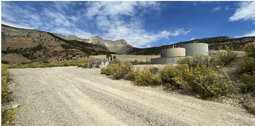
South West corner of location.