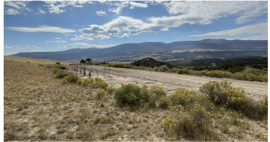
North East corner of location.