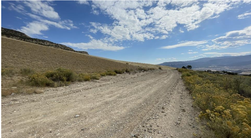
North West corner of location.