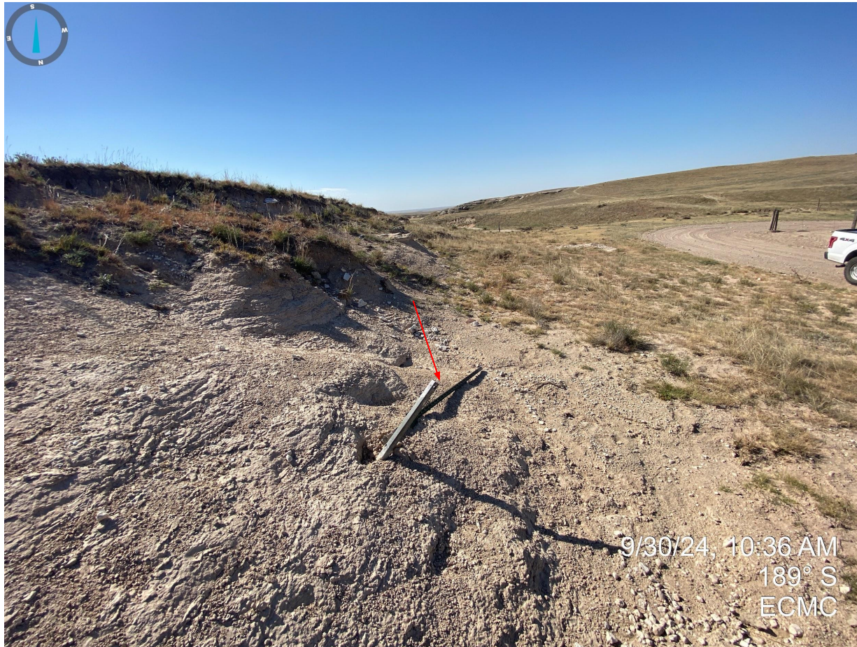
Photo 9. Northeastern guyline anchor maker needs to be reinstalled.