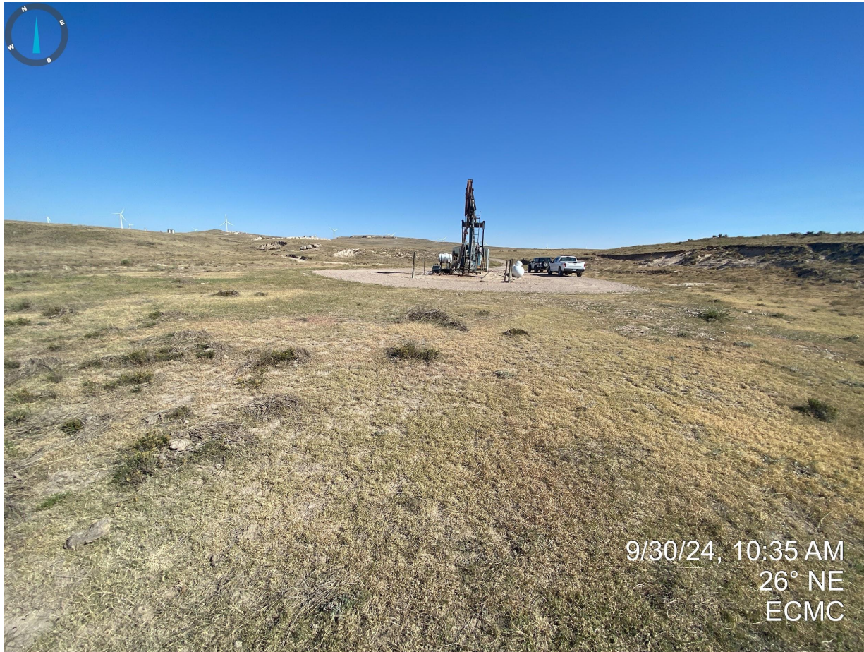
Photo 6. South of the well, interim areas appear to be progressing towards Rule 1003 vegetative standards.