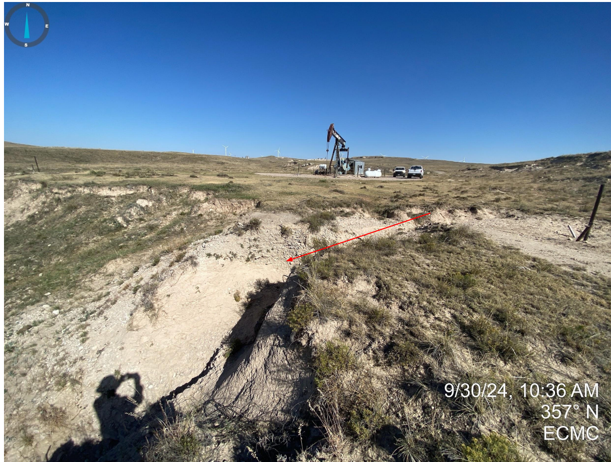
Photo 7. Erosion degradation evident on the southeastern portion of the production areas. No apparent stormwater control measures/BMPs observed at the time of this inspection.