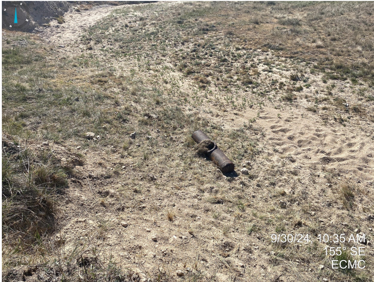
Photo 5. Pipe (debris) remains from the previous inspection; south of the well location in nearby drainage.