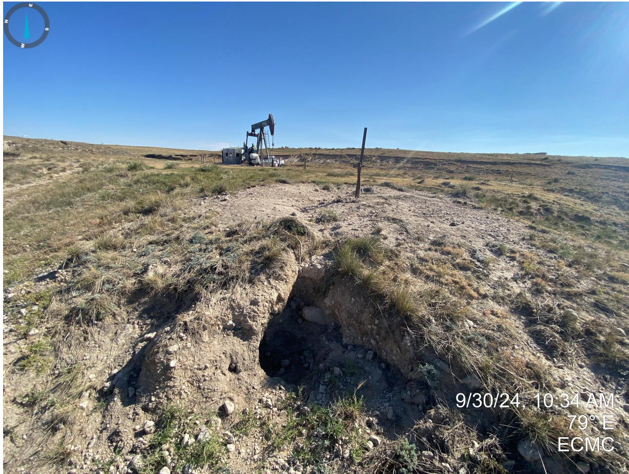
Photo 3. Erosion degradation evident on the southwestern portion of the production areas. No apparent stormwater control measures/BMPs observed at the time of this inspection.