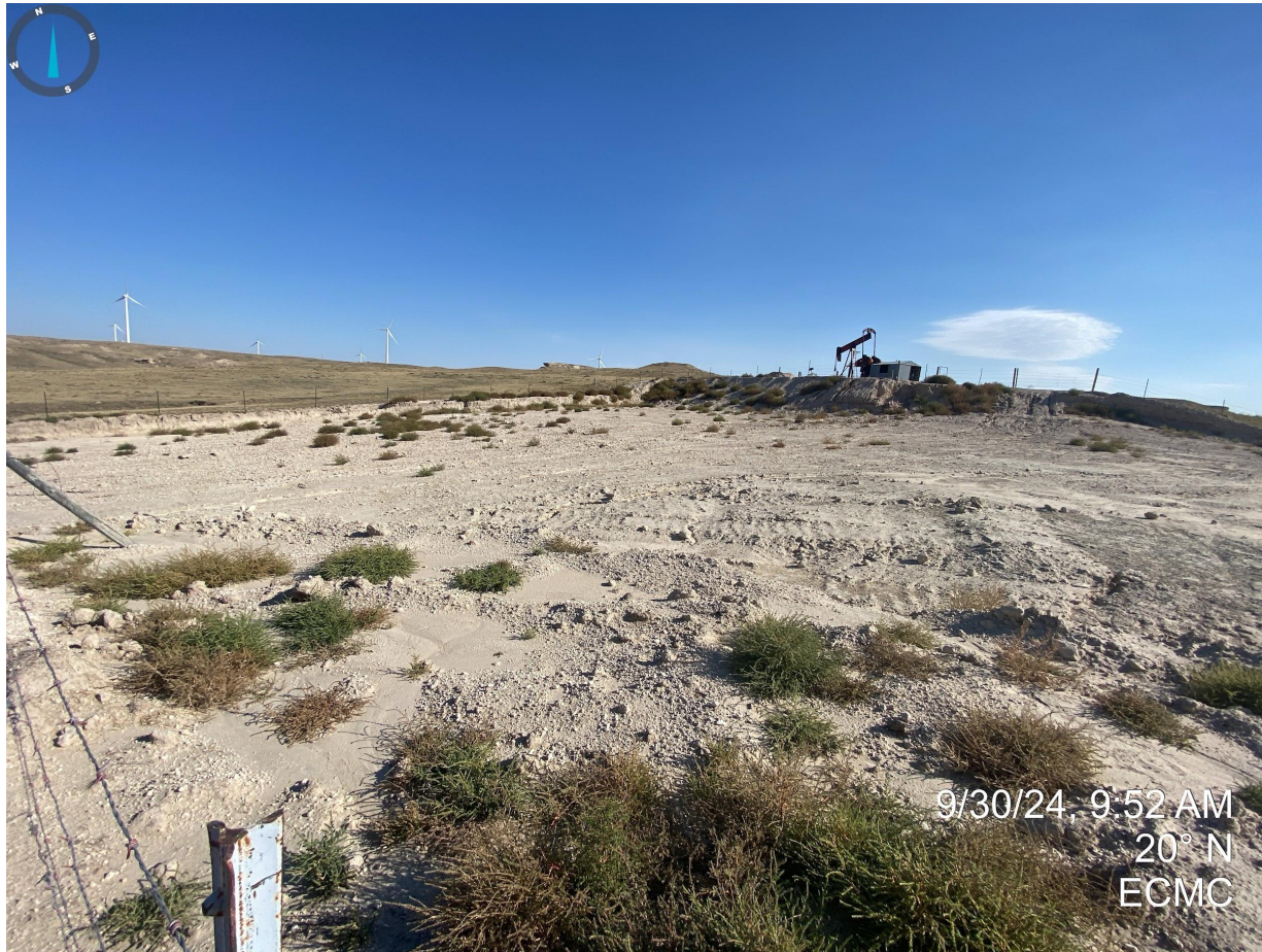
Photo 17. Undesirable vegetation observed throughout the pit excavation.