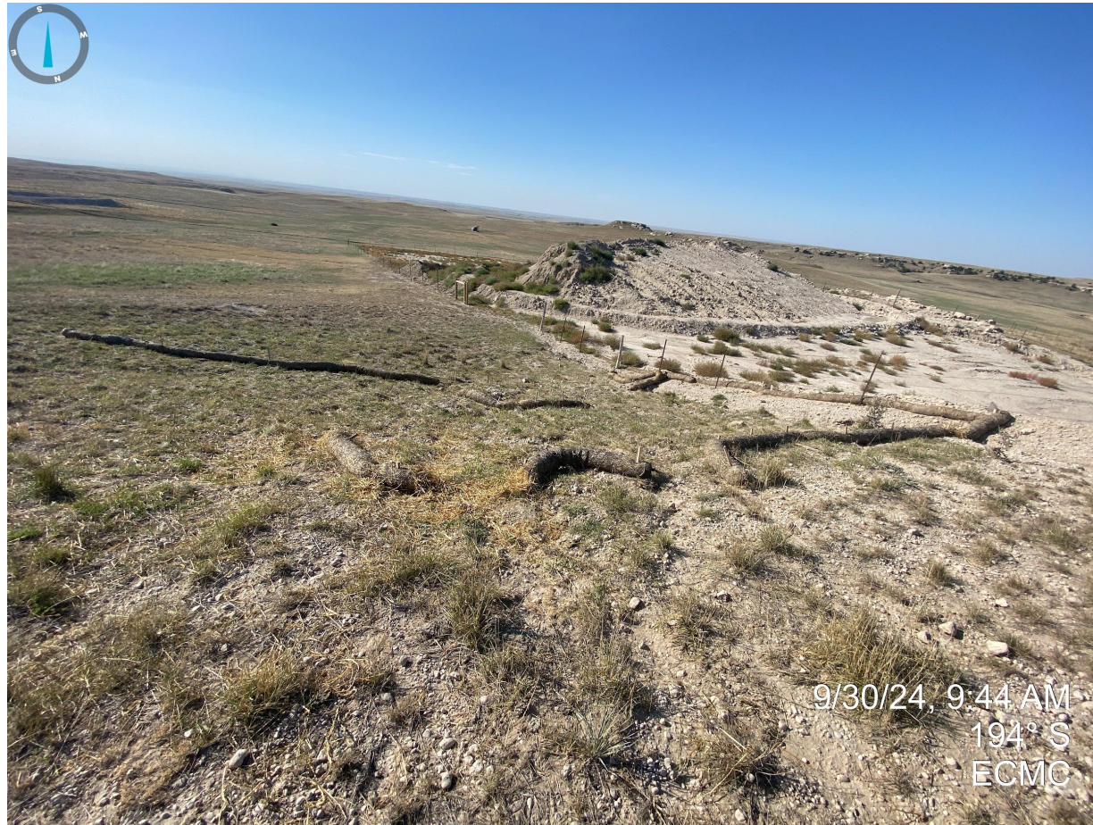
Photo 10. Stormwater control measures east of pit remain inadequate; additional maintenance and/or implementation of more robust stormwater control measures/BMPs required.