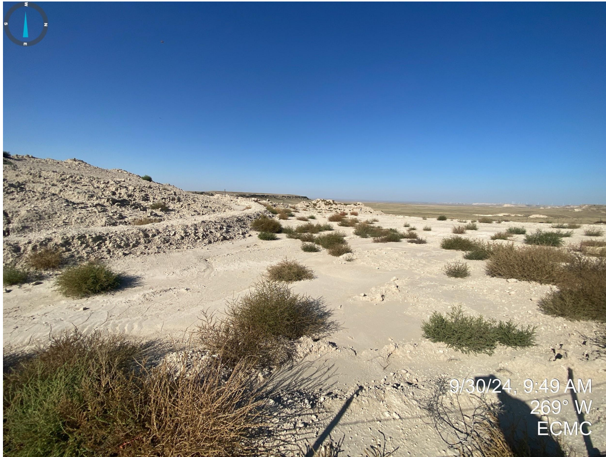
Photo 14. Undesirable vegetation within pit excavation.