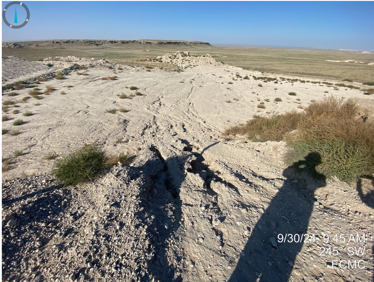
Photo 9. Erosion degradation and undesirable vegetation observed within the excavated pit.