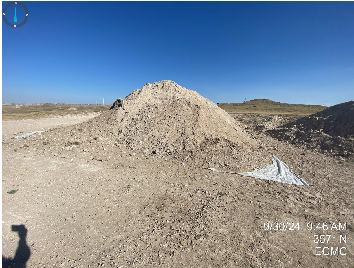
Photo 8. Stockpile immediately adjacent to the wellhead (northeast) without proper stormwater control measures/berms to contain the soil; no signage observed.