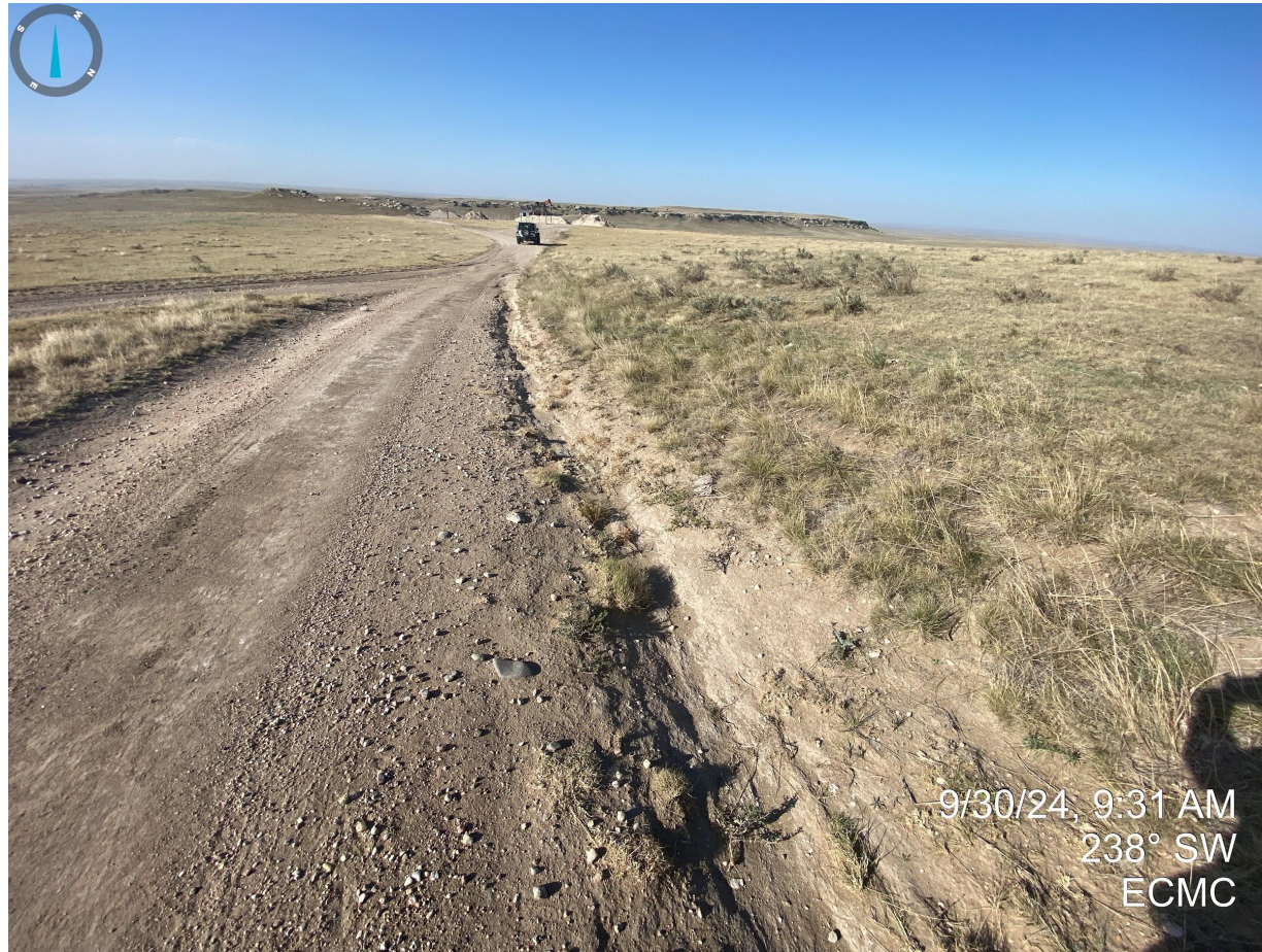
Photo 1. Erosion degradation observed along the start of the access road.