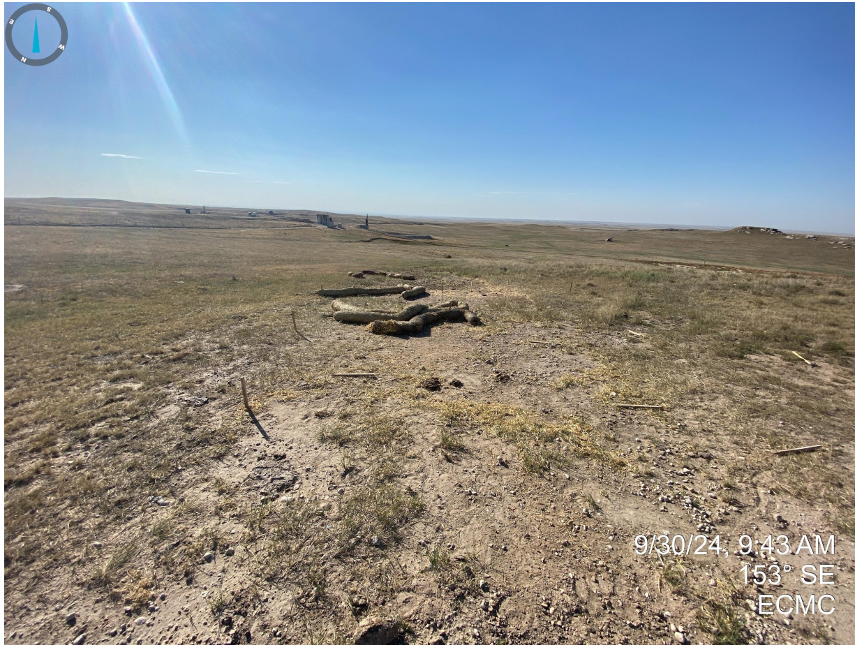
Photo 6. Stormwater control measures south of the former heater treater remain inadequate; additional maintenance and/or implementation of more robust stormwater control measures/BMPs required.