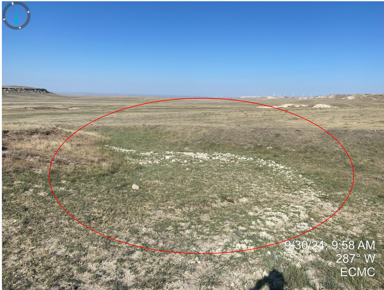
Photo 24. Continued from Photo 21. Evidence of sediment transport into the adjacent drainage.