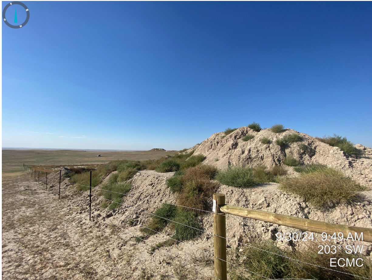
Photo 15. Stockpiled materials remain unstabilized with evidence of unconsolidated material; undesirable vegetation observed throughout stockpile and excavation.