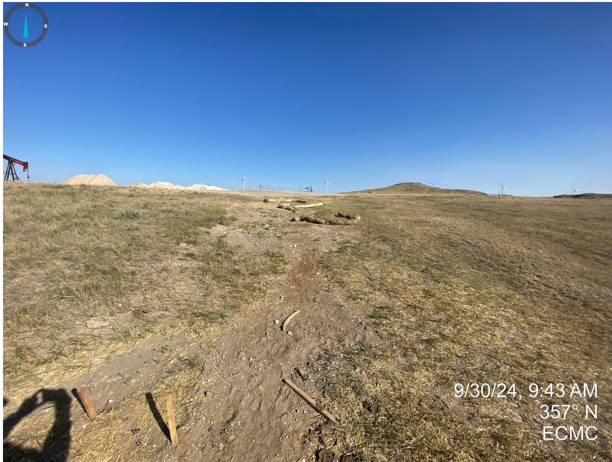
Photo 7. Continued from Photo 6. Erosion degradation evident from lack of proper stormwater control measures.