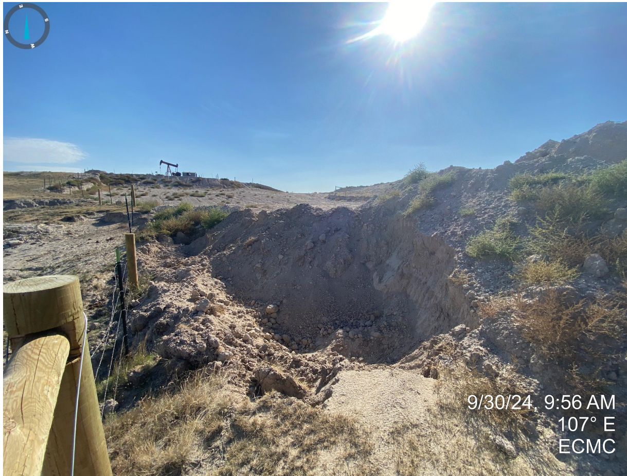
Photo 21. Northwest corner of the excavated pit; photo illustrates dirt work that appears to have been completed to implement additional stormwater controls. However, it appears that stormwater may have breached the berm and discharged stormwater, rock/sediment/debris and E&P waste into the adjacent drainage (see proceeding photos).