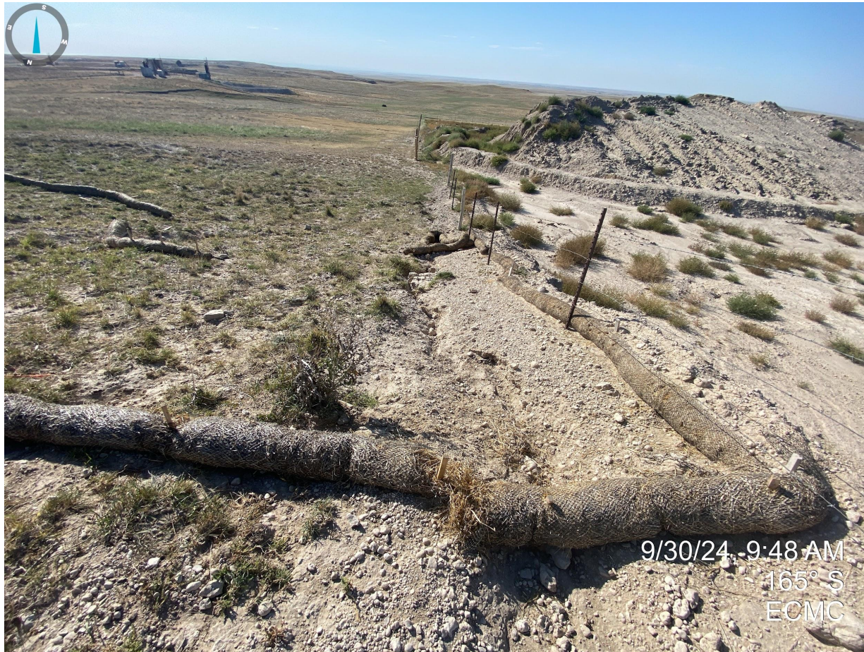
Photo 12. Erosion degradation and improper control measures/BMPs east of pit remain evident; additional maintenance and/or implementation of more robust stormwater control measures/BMPs required.