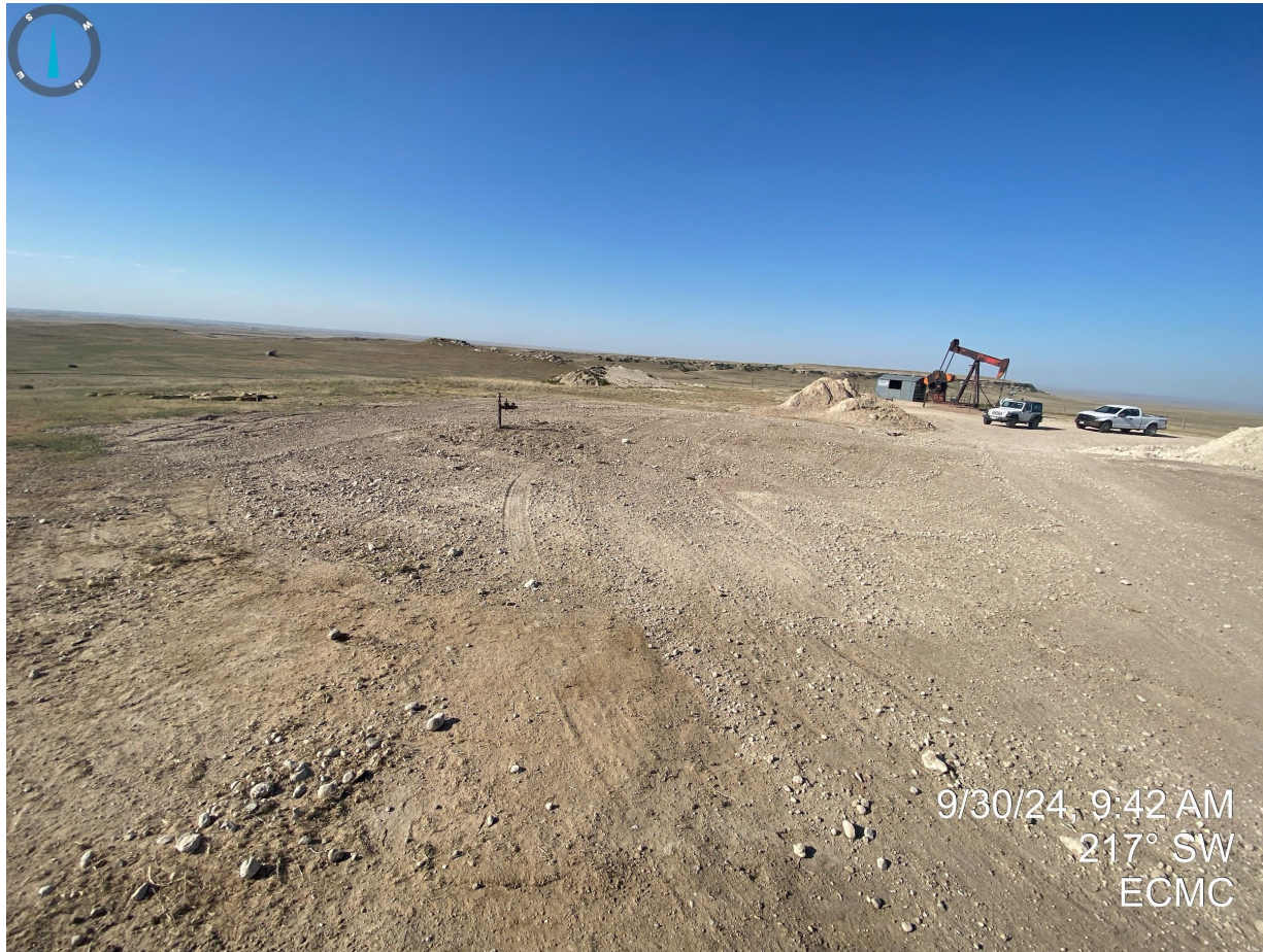
Photo 5. Vertical heater treater appears to have been removed.