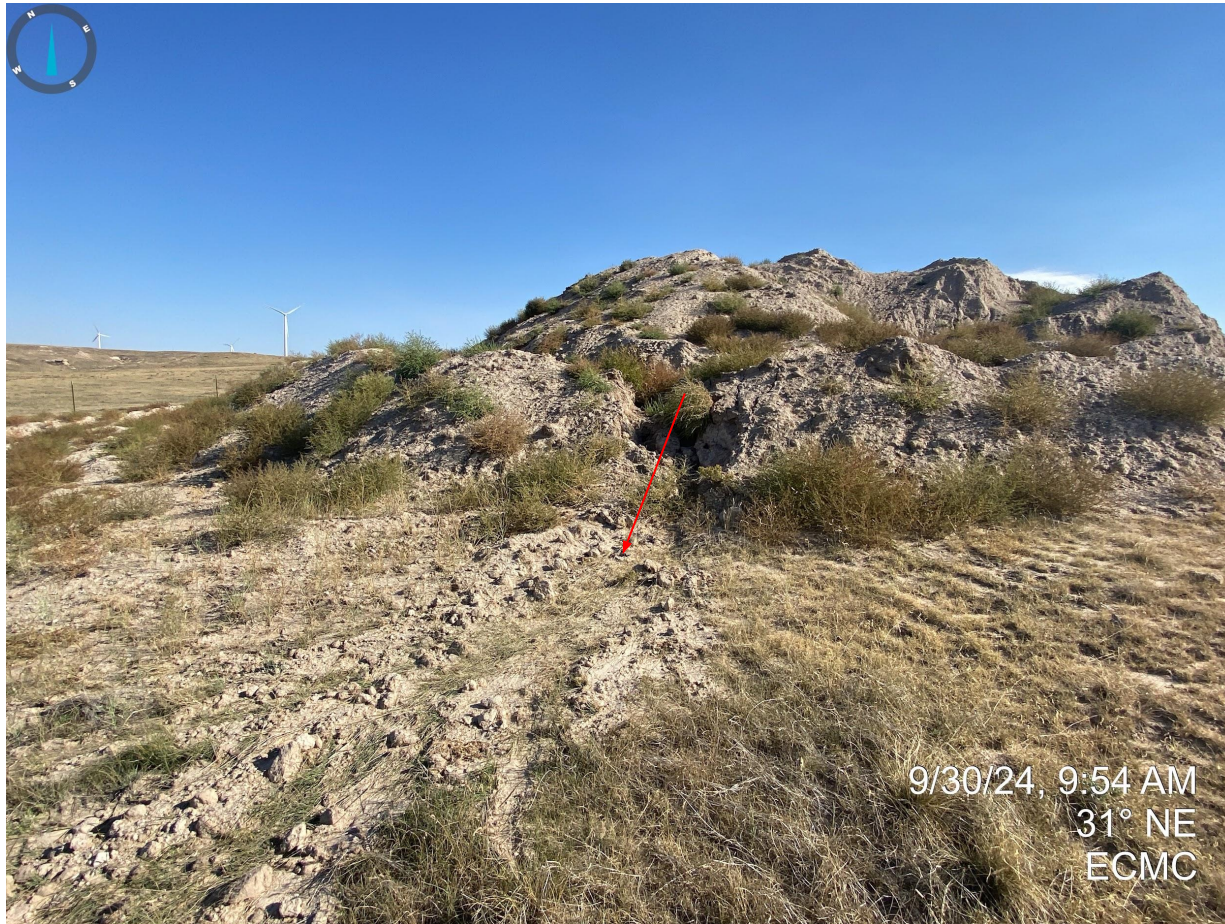
Photo 18. Erosion degradation from the western stockpile which does not appear to be properly stabilized; sedimentation appears to have migrated off location (see next Photo 19).