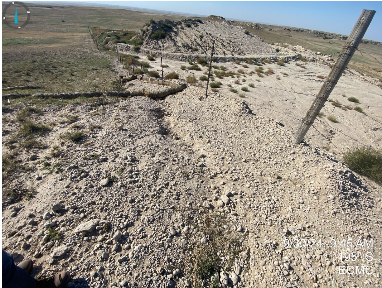
Photo 11. Erosion degradation east of pit remain evident; additional maintenance and/or implementation of more robust stormwater control measures/BMPs required.