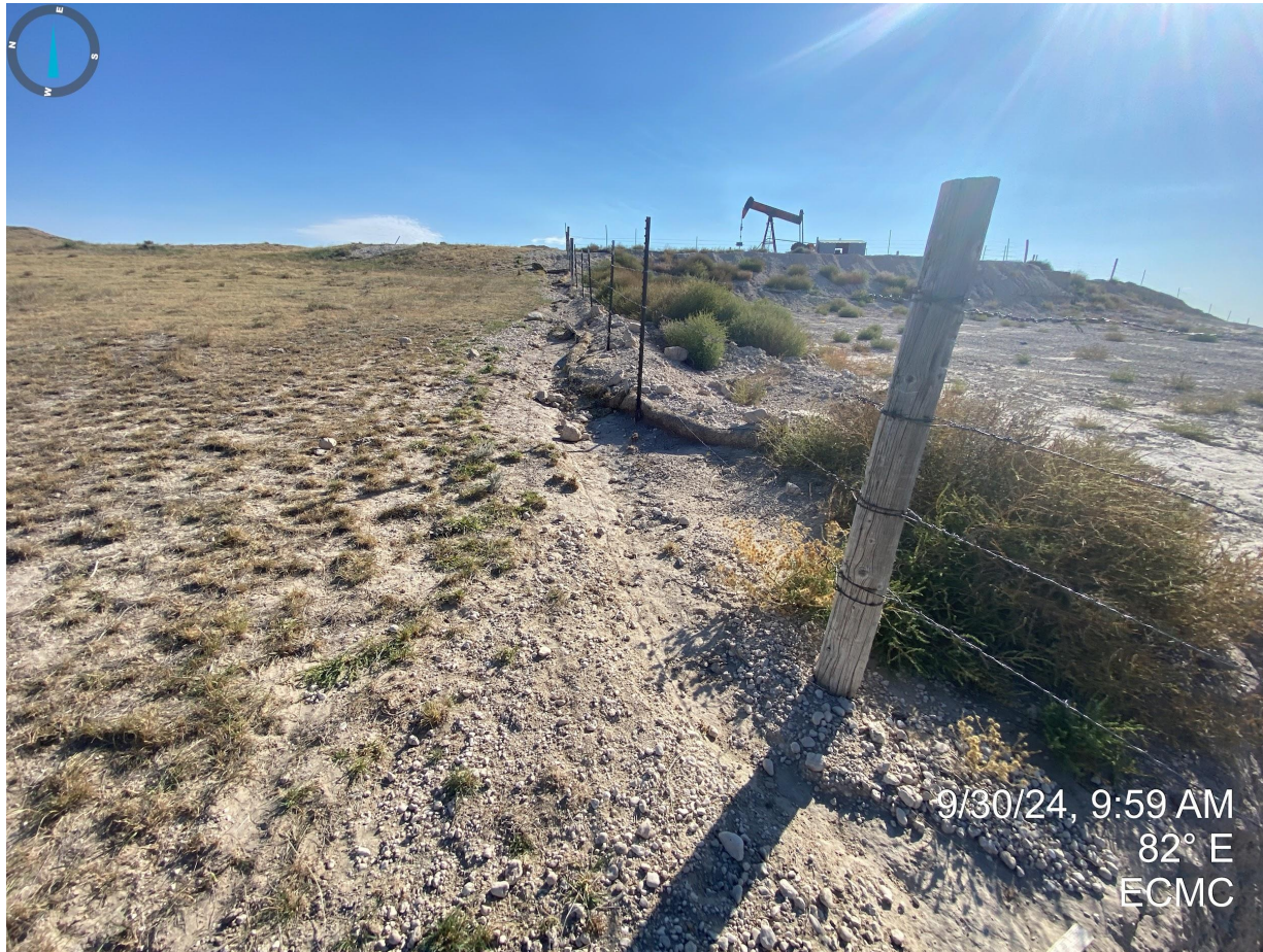
Photo 25. Erosion degradation north of pit remain evident; additional maintenance and/or implementation of more robust stormwater control measures/BMPs required.