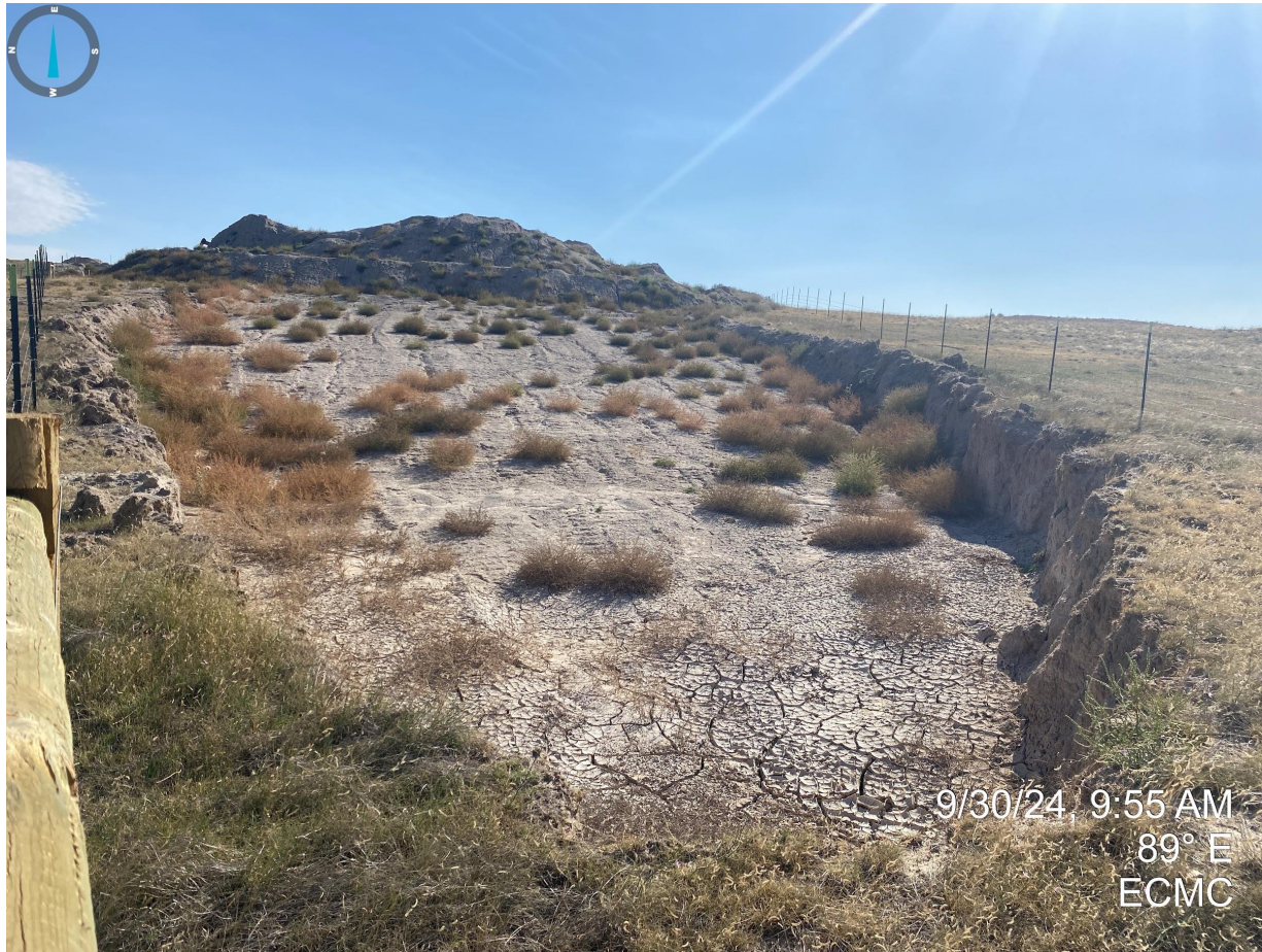
Photo 20. Undesirable vegetation observed within the western salt kill excavation.