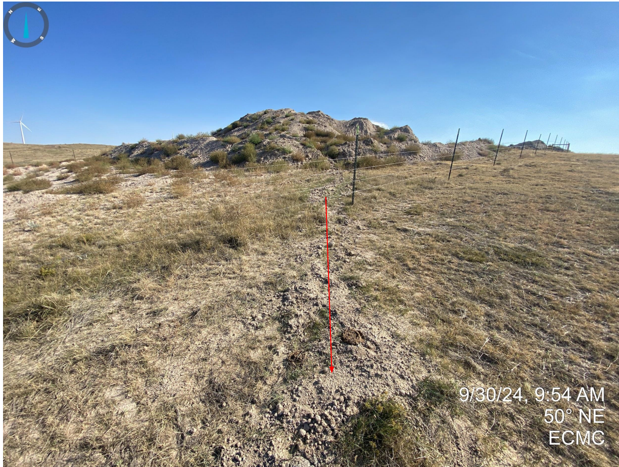
Photo 19. Continued from Photo 18; see comments in previous photo.