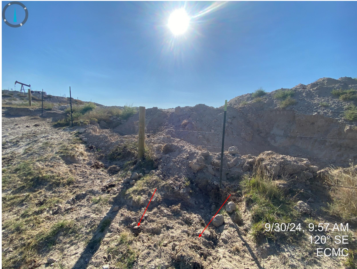
Photo 22. Continued from Photo 21. Evidence of off-location sediment transport observed