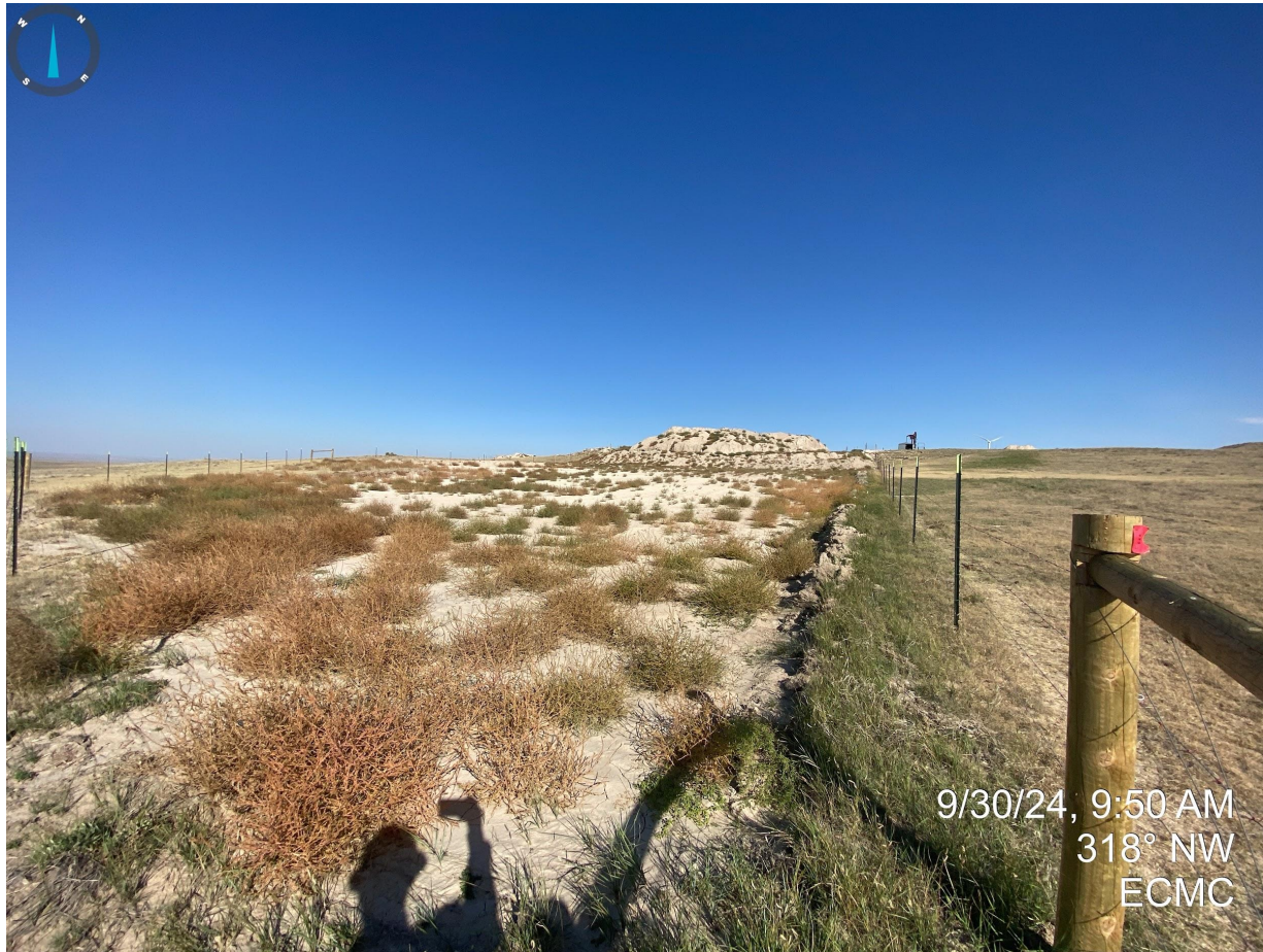
Photo 16. Undesirable vegetation observed throughout the salt kill excavation.