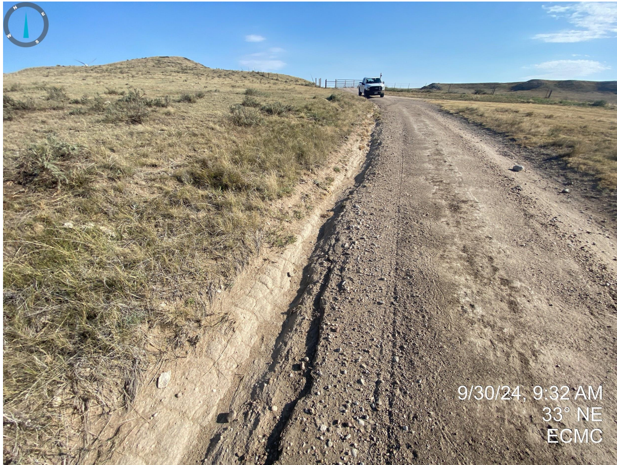
Photo 2. Erosion degradation observed along the start of the access road.