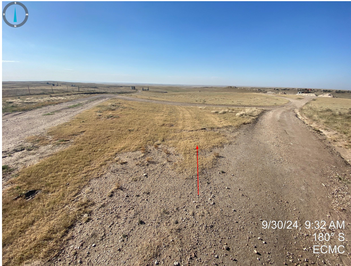
Photo 3. Taken near the Y intersection of the access road. Vehicle traffic observed outside of the established access roads. Additional reclamation activities may be required if the disturbed area fails to meet Rule 1003 standards.