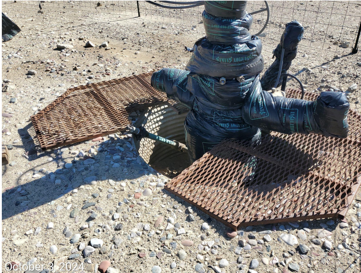
Photo 2: Cover has not been properly fitted or placed over the cellar.