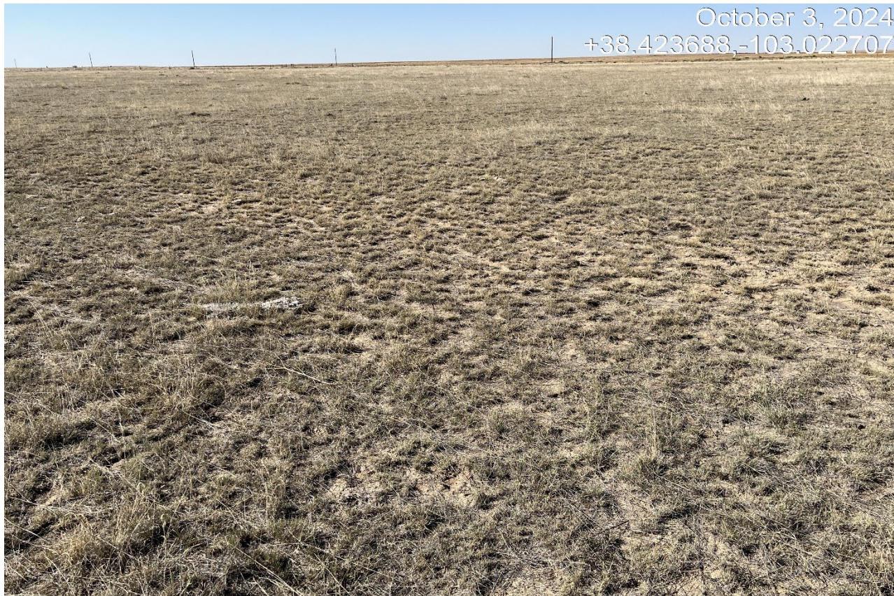
Photo 11. Facing southwest toward the surrounding undisturbed pasture which consists of Native Blue grama grassland.