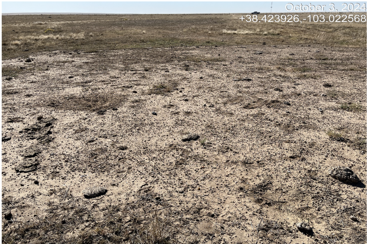
Photo 10. Facing south at the location. Perennial vegetation has not established and there are undesirable weeds throughout the location.