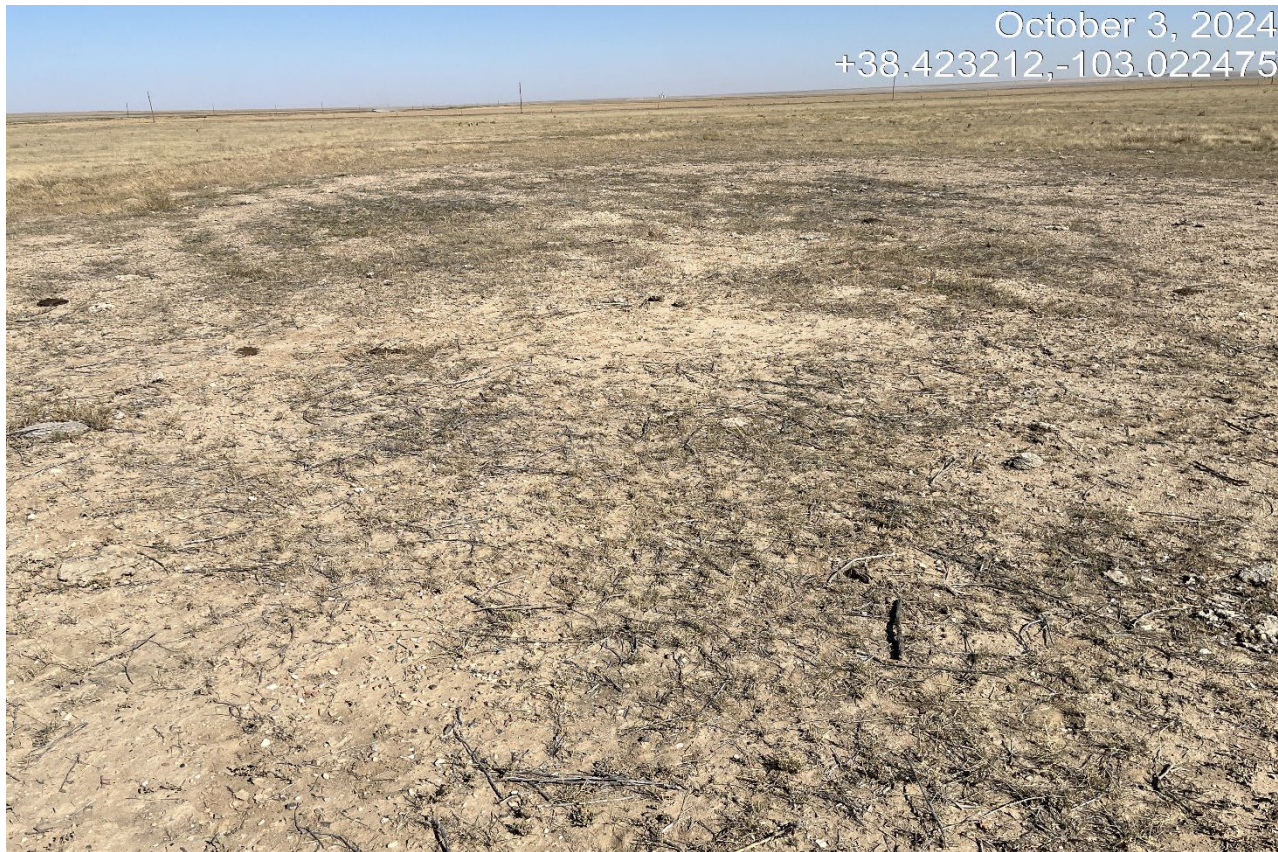
Photo 9. Facing north at the location. Perennial vegetation has not established and there are undesirable weeds throughout the location.