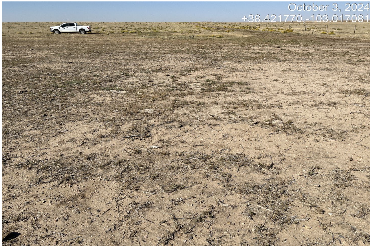
Photo 4. Center of the location facing west. Perennial vegetation has not established and there are undesirable weeds throughout the location.