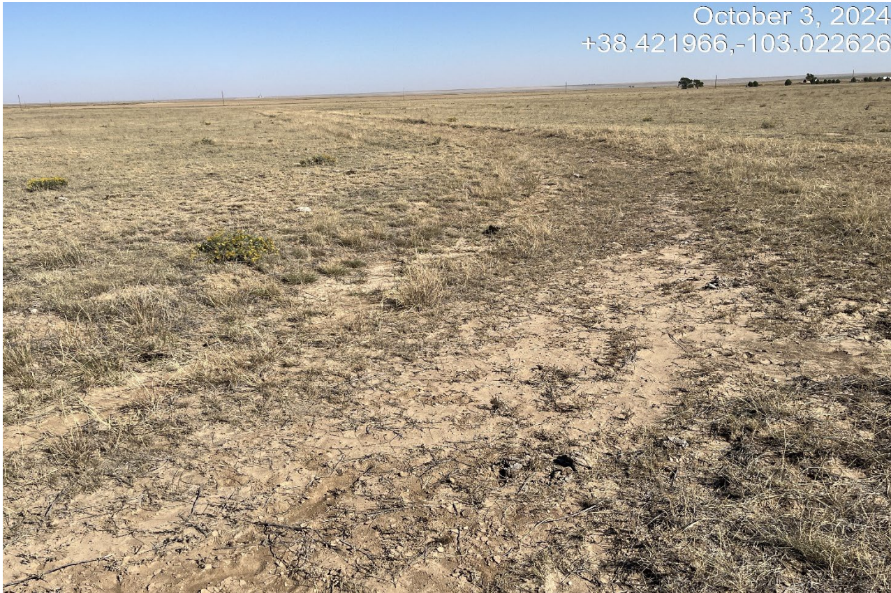
Photo 8. The access road turns north toward the location. The road was never recontoured and the road has not been reclaimed.