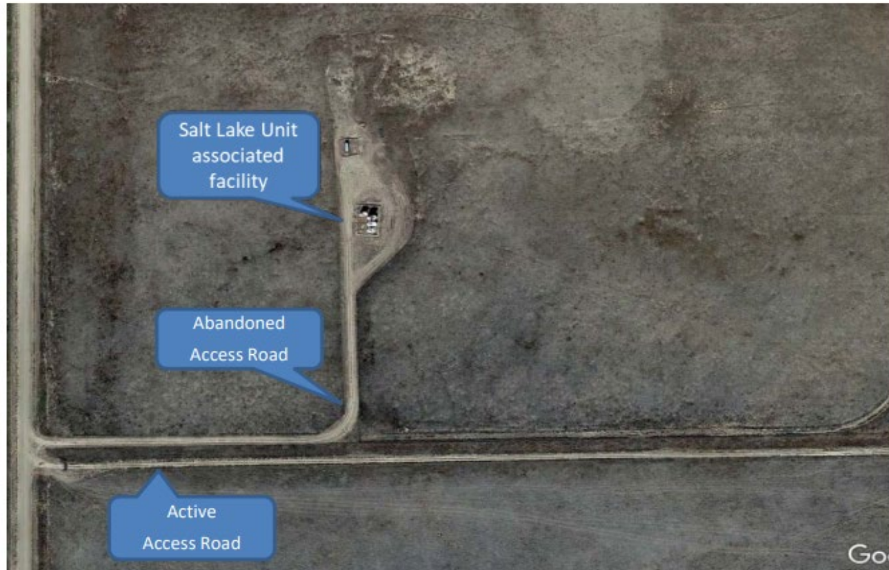
Photo 7. 2015 Aerial image showing the SALT LAKE UNIT associated battery facility. The abandoned access road that goes to the abandoned location needs to be reclaimed. The active road which travels east is in use for the FRAZEE #B-14-2 PR well site.