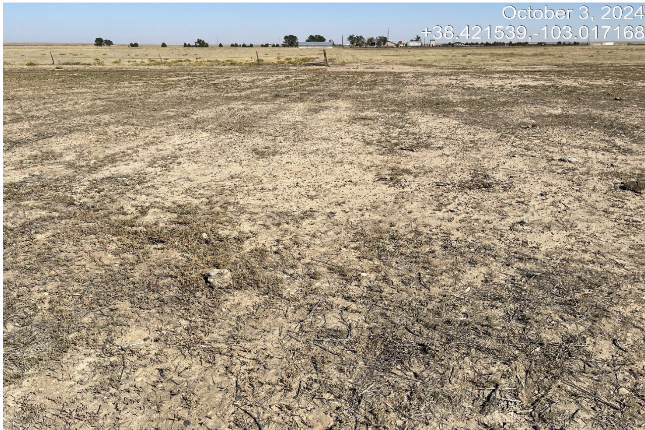
Photo 5. Facing north at the location. Perennial vegetation has not established and there are undesirable weeds throughout the location.