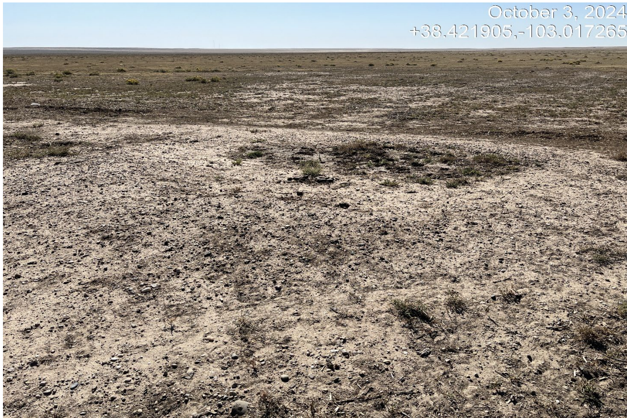
Photo 3. Facing southeast at the location. Perennial vegetation has not established and there are undesirable weeds throughout the location.