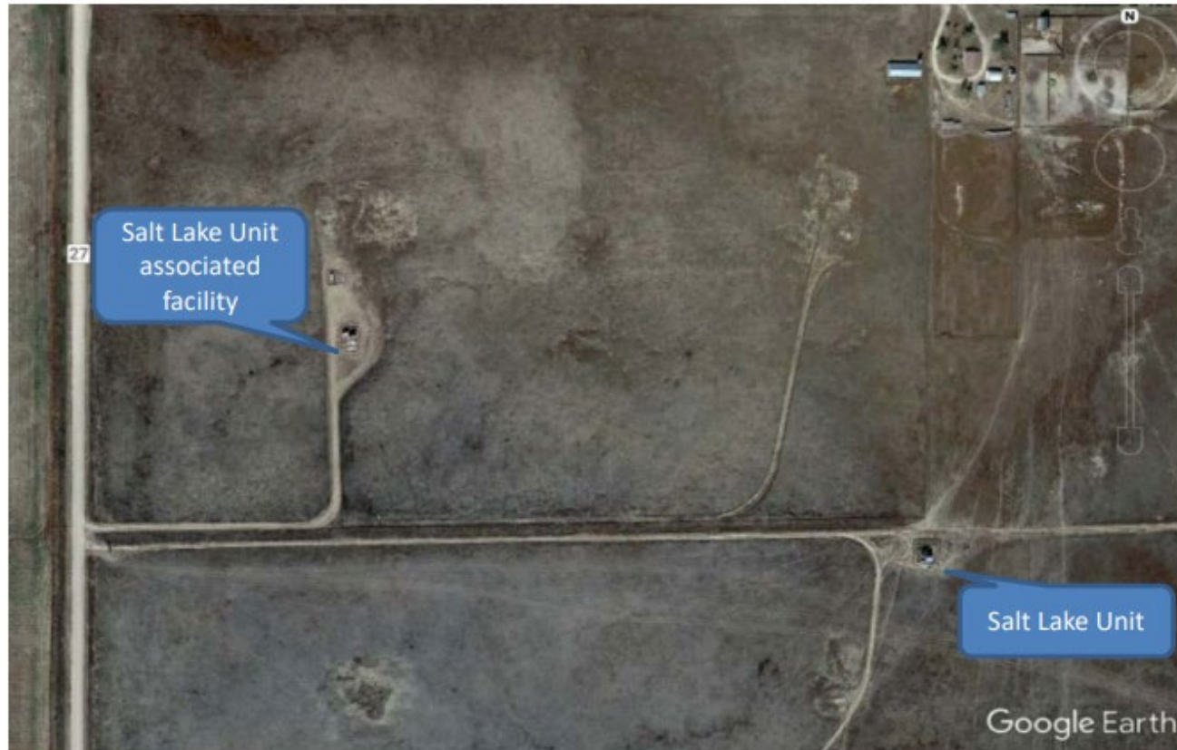
Photo 1. 2015 Aerial image showing the SALT LAKE UNIT abandoned location and associated facility.