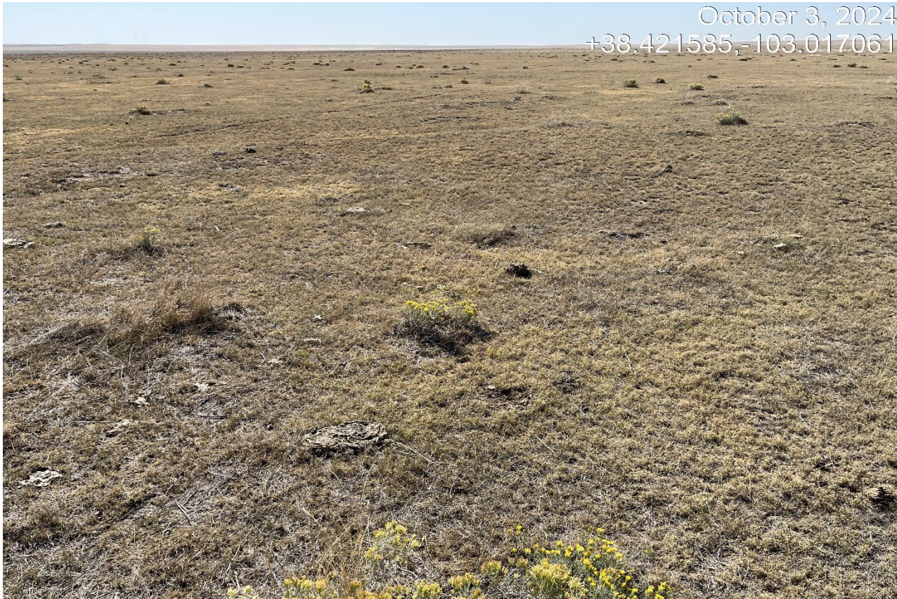
Photo 6. Facing north toward the surrounding undisturbed pasture which consists of Native Blue grama grassland.