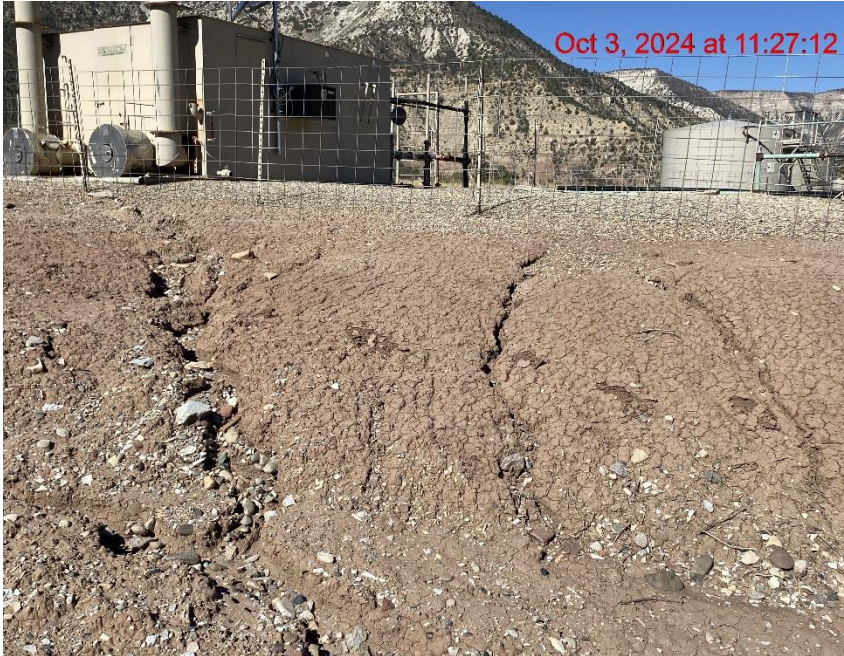
Rill Erosion Transporting Sediment from Location – Photo #03939