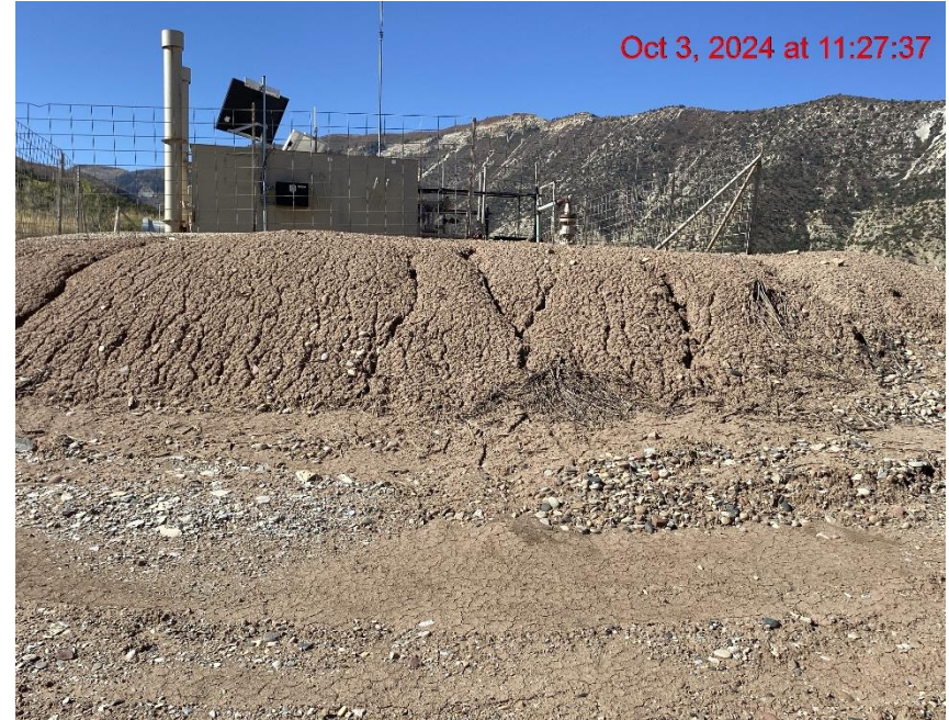
Rill Erosion Transporting Sediment from Location – Photo #03941