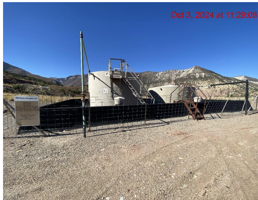
Tank Battery – Photo #03945