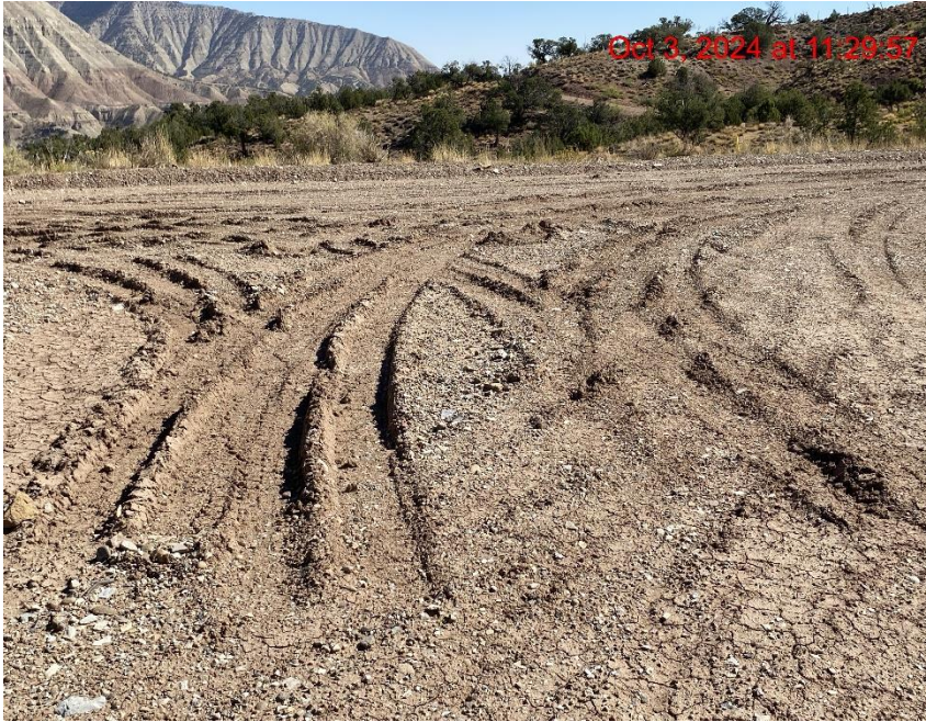
Lack of Stabilization – Photo #03947