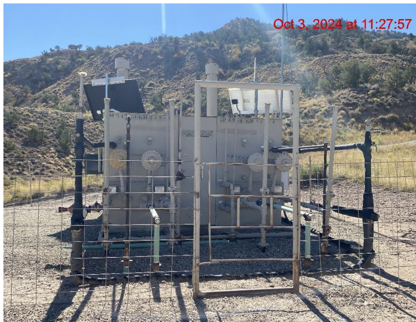
Separators – Photo #03942