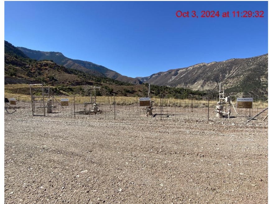
Wellheads – Photo #03946