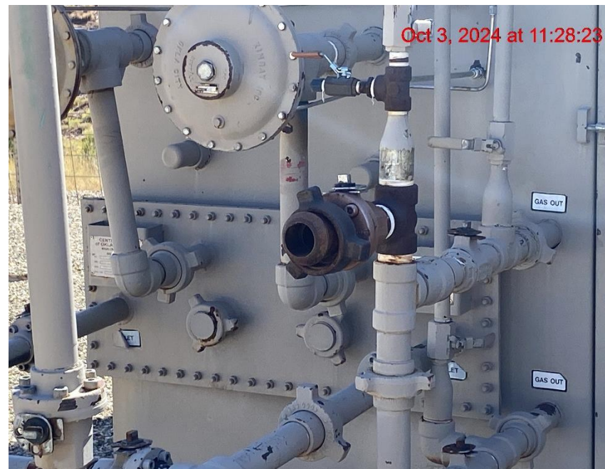
Open-Ended Line – Photo #03944