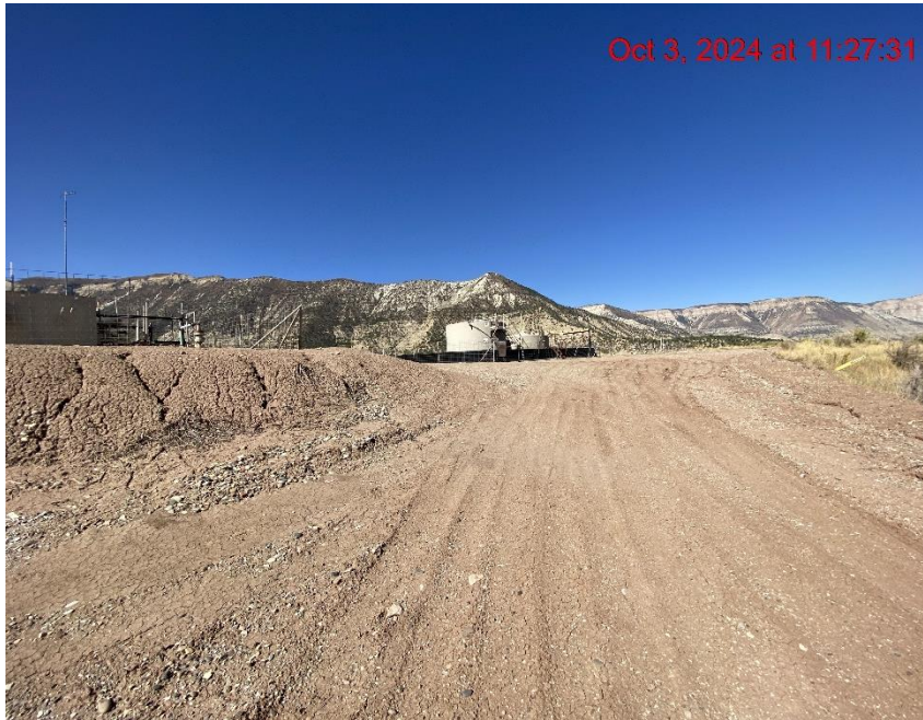
Location Entrance – Photo #03940