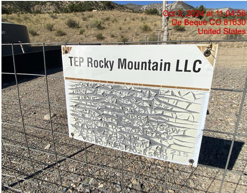
Weathered and Illegible Wellhead Sign – Photo #03911