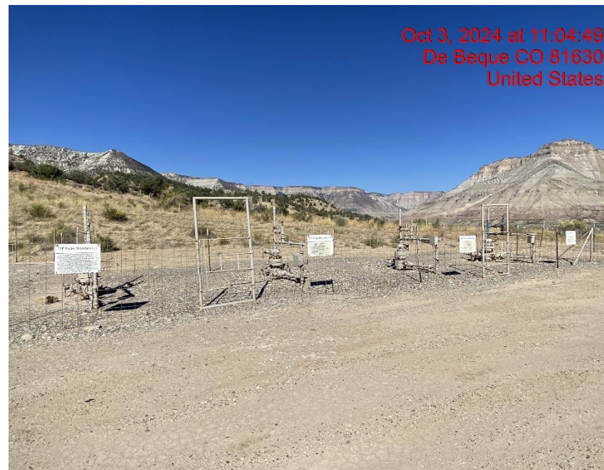
Location Entrance – Photo #03902

Oct 3, 2024 at 11:04:49 De Beque CO 81630 United States