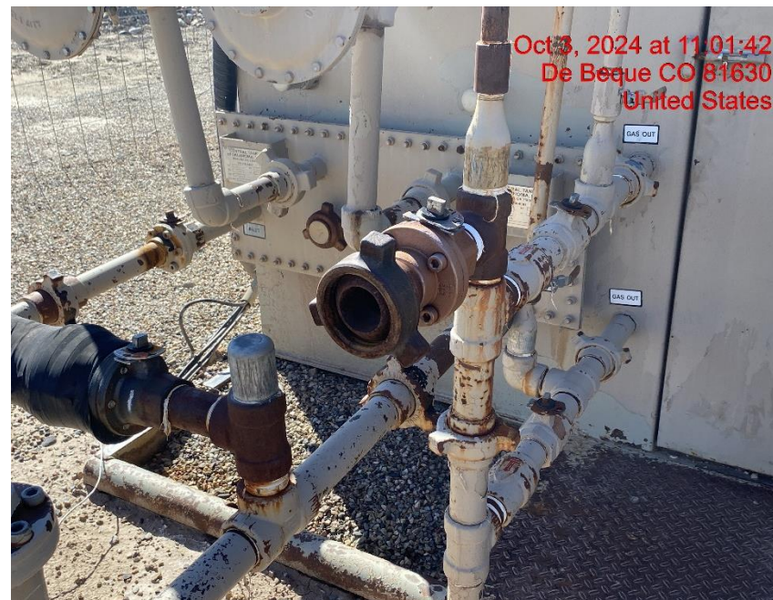
Open-Ended Line on Separator – Photo #03907