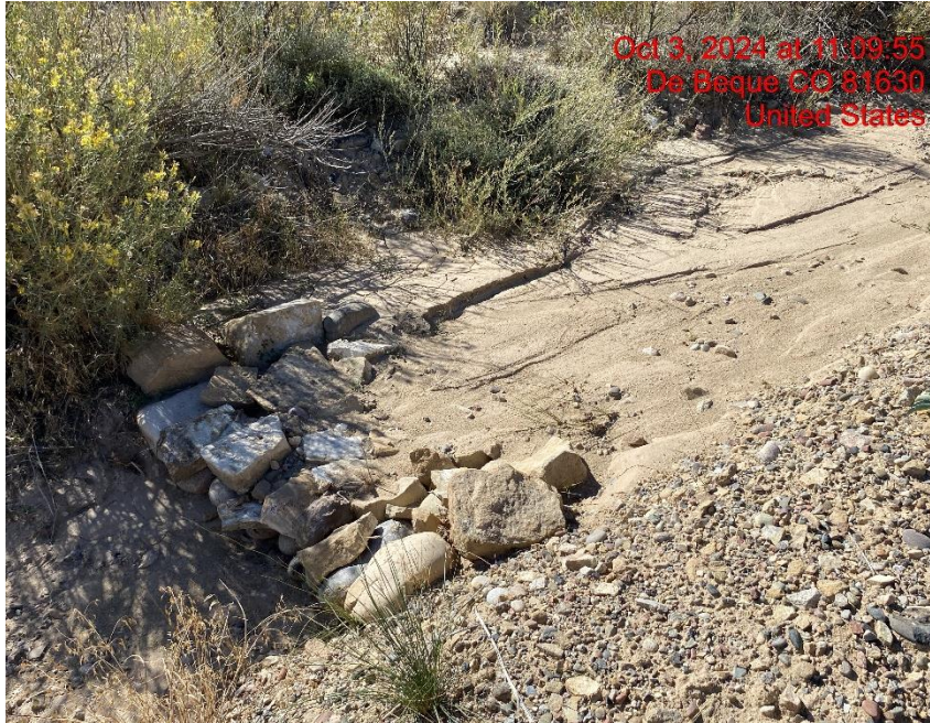
Check Dam BMP Full and Needs Maintenance – Photo #03916