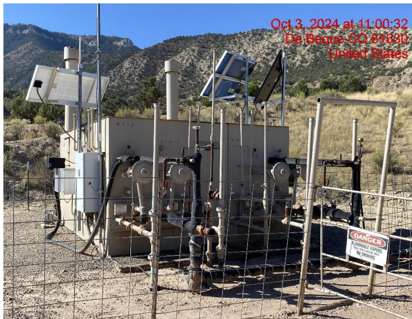
Separators – Photo #03903