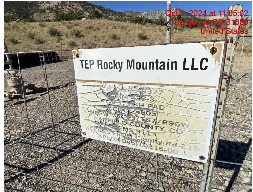
Weathered and Illegible Wellhead Sign – Photo #03912