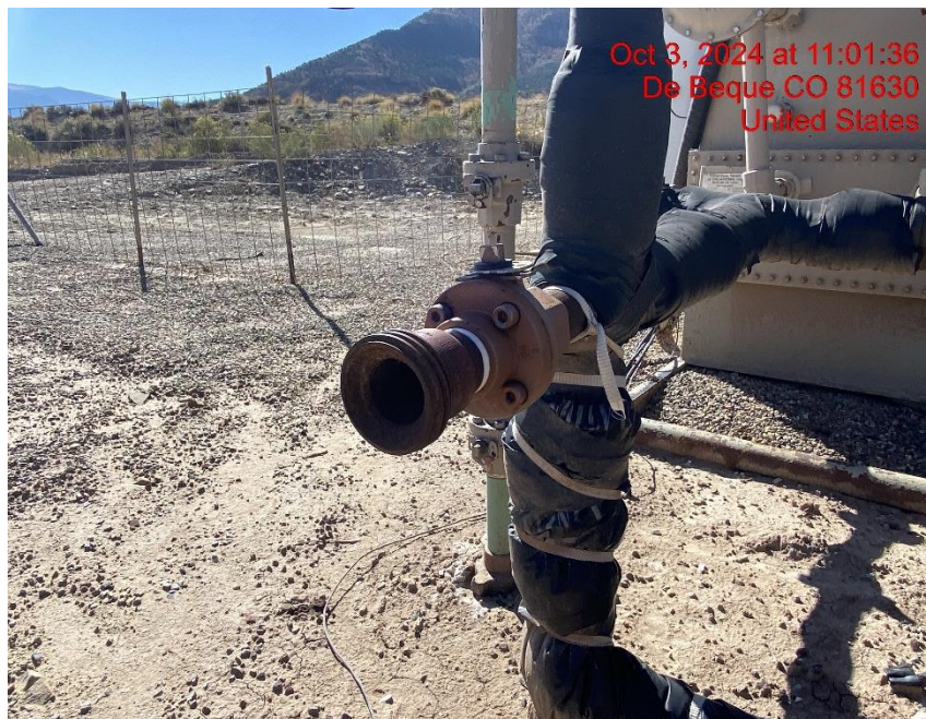
Open-Ended Line on Separator – Photo #03906