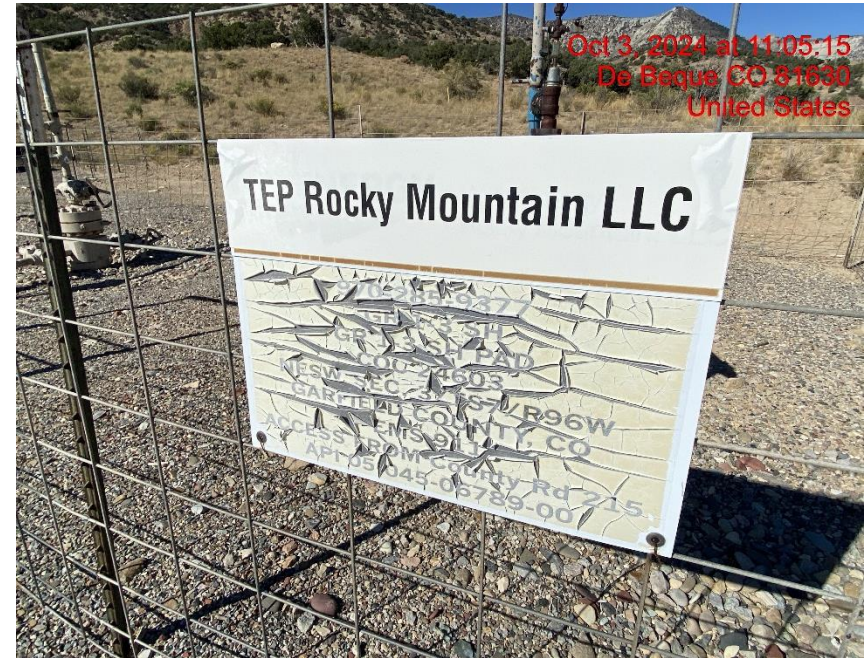
Weathered and Illegible Wellhead Sign – Photo #03914