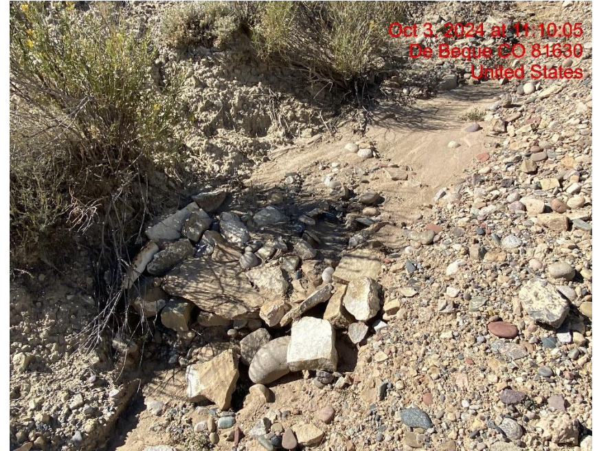
Check Dam BMP Full and Needs Maintenance – Photo #03917