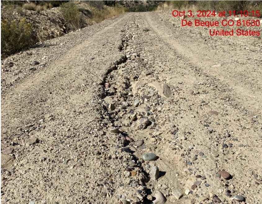
Rill Erosion on Lease Road Into Location – Photo #03918