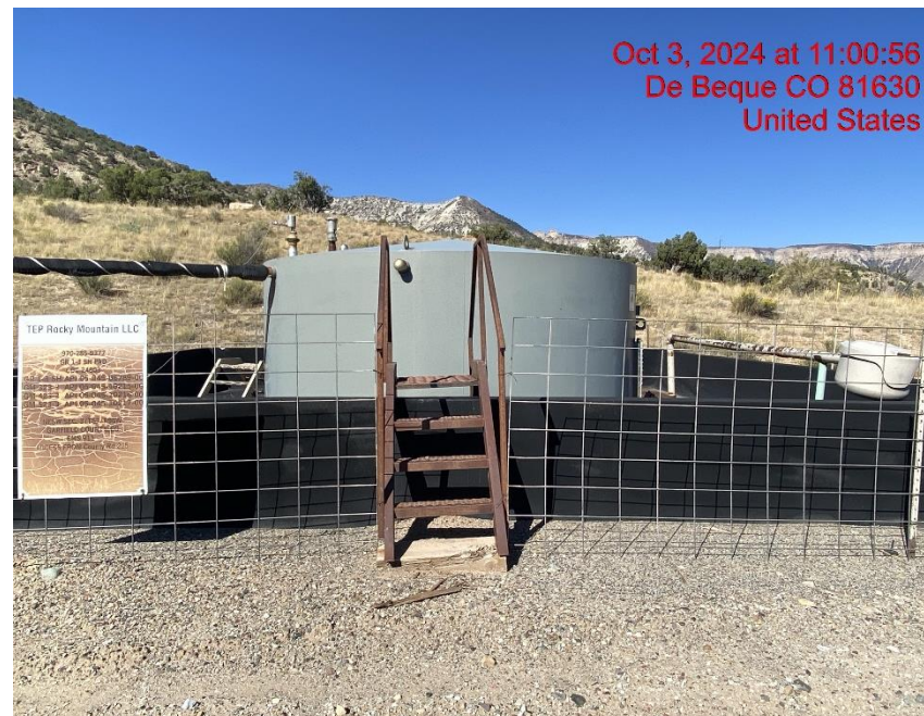
Tank Battery – Photo #03904