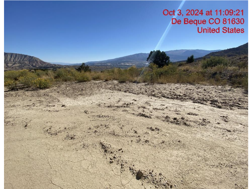
Transport of Sediment Offsite – Photo #03915