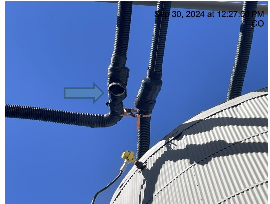
Photo # 2767 Flowline heating insulation open ended /wildlife hazard/available for entry by wildlife