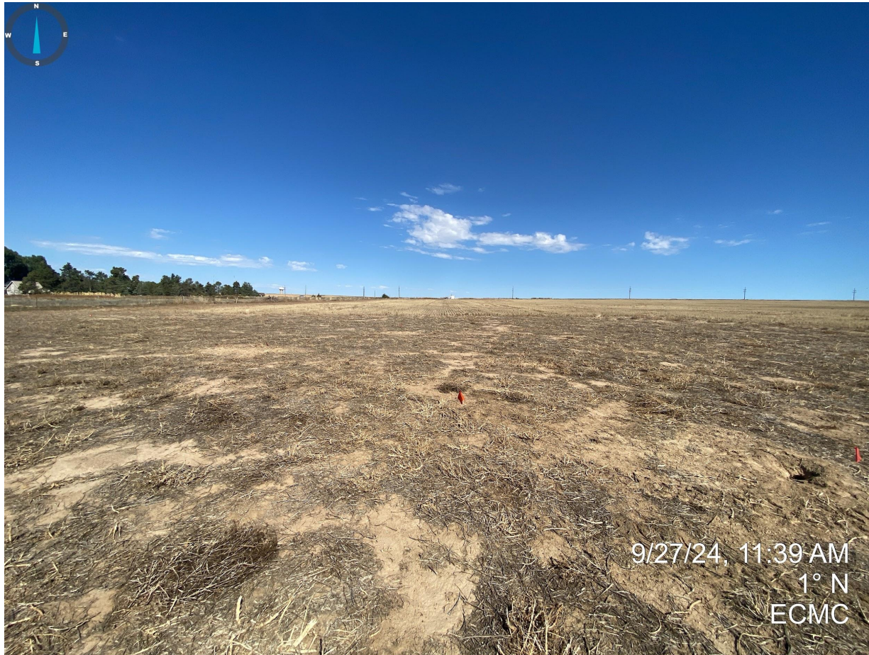
Photo 2. Facing north near the former well location. It appears that undesirable vegetation has been managed by mowing operations.