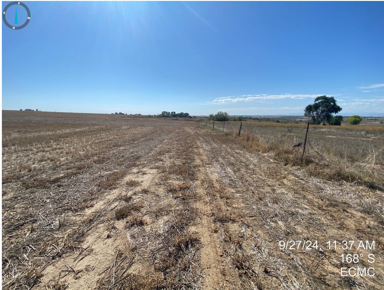
Photo 1. Undesirable vegetation previously observed along the access road appears to have been managed for.