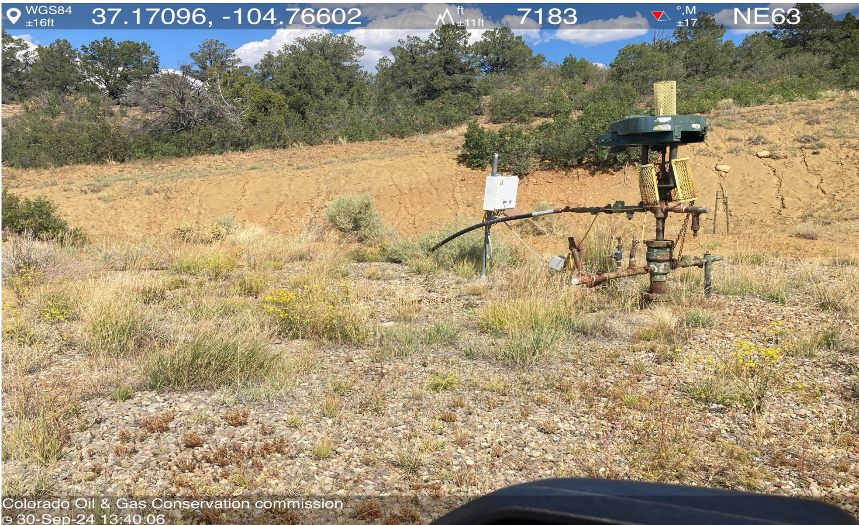
PHOTO 5: WEED MAINTANANCE. MAINTAIN WEEDS PER RULE 606. CA DATE 10/30/2024.