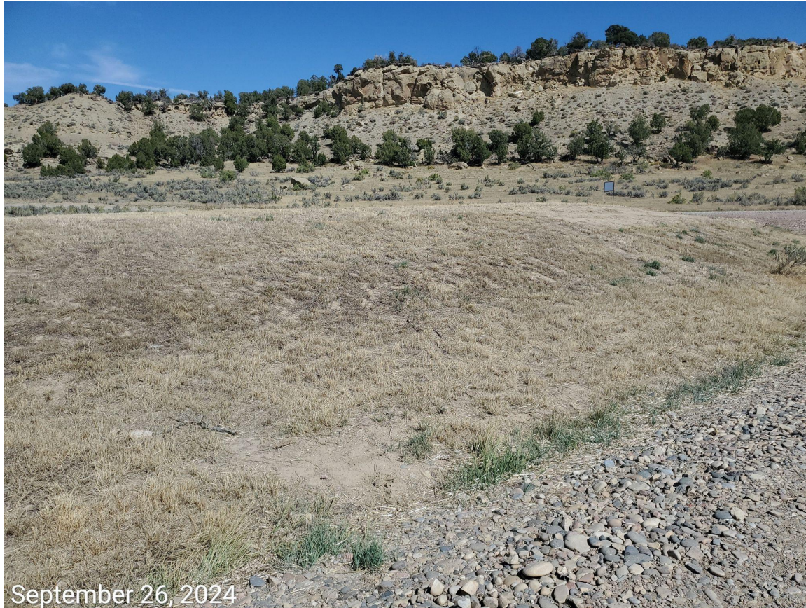
Photo 2: Topsoil stockpile. Operator appears to have performed mowing operations. Timing to prevent further spread of weeds is inadequate, as weeds have already seeded out for the year.