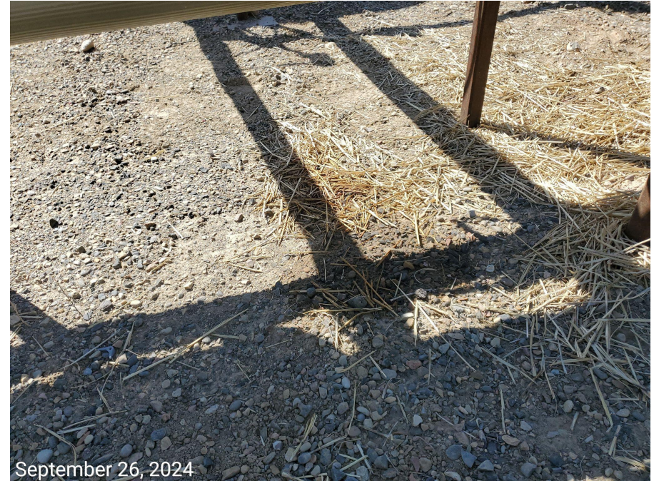
Photo 5: Photo shows leaks at equipment (pipe, northeast end of the Location) have persisted, and spills onto the pad surface have recurred.