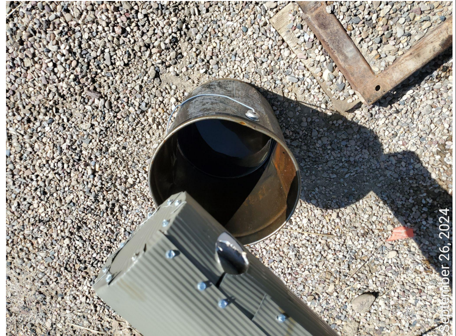
Photo 6: Photo shows leaks at equipment (pipe, northeast end of the Location) have persisted, and spills onto the pad surface have recurred.