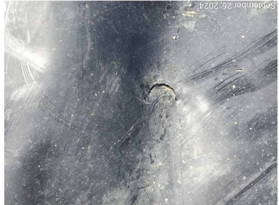
Photo 4: Photos show holes within containment BMP/Liner on the west end of the Location. BMP no longer impervious to contain a spill or release from the impacted materials.