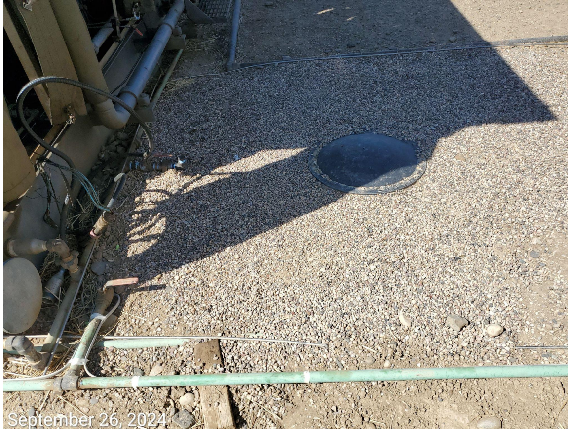
Photo 8: Photo taken from the behind the compressor equipment. Containment BMP has been reinstalled, and impacted soils appear to have been cleaned/removed.