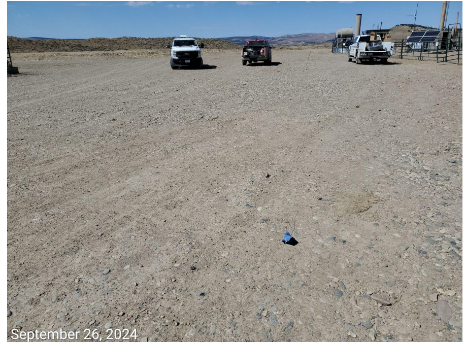
Photo 3: Photos examples showing anchor on the southeast end of the pad remains buried, and has not been marked pursuant to Rule 1003.a.