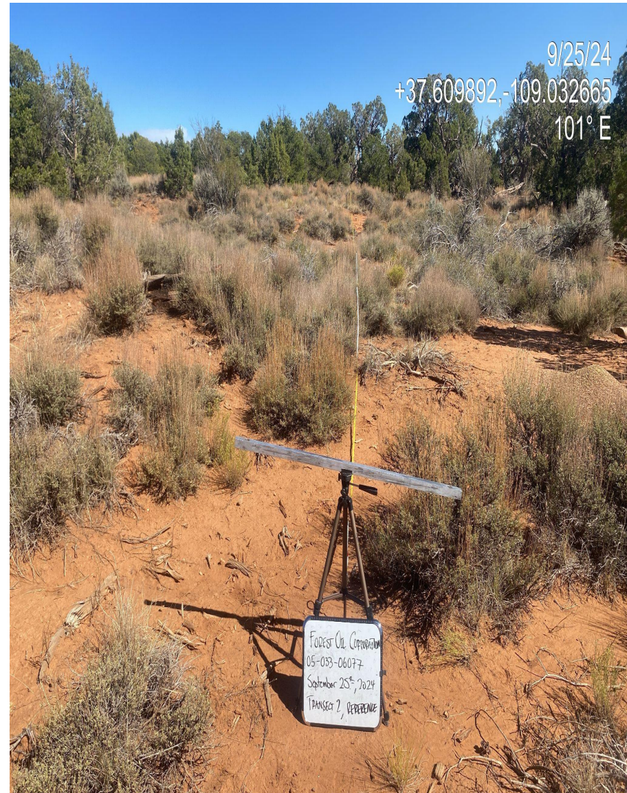
Photo 2. View of transects conducted at the location, Disturbed area (left) and reference area (right).