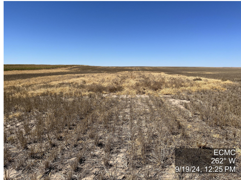
Photo 6. The photo was taken at the well location facing West. The photo illustrates an area where vegetation appears to not be representative of the surrounding vegetation to the Southwest of the former wellhead location.