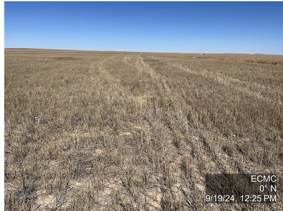
Photo 2. The photo was taken at the well location facing North. The photo illustrates the location has been cut and will need to be inspected again at a later date.