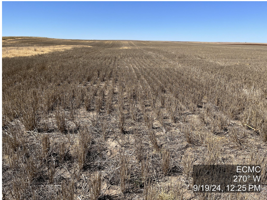
Photo 5. The photo was taken at the well location facing West. Refer to the comment for photo 2.