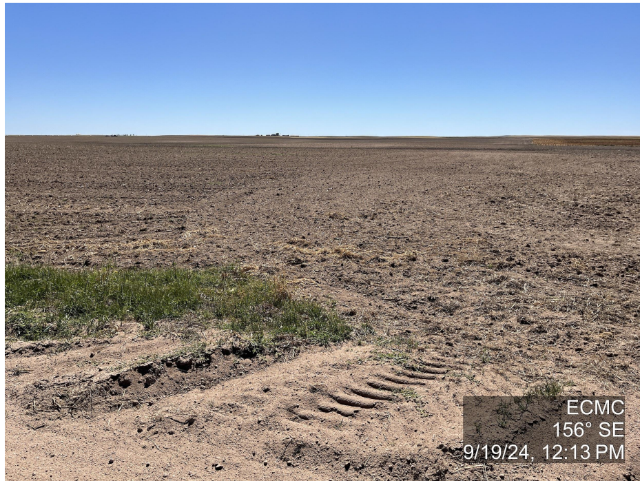
Photo 1. The photo was taken at the entrance to the well location facing Southeast. The photo illustrates the former area of the access road.