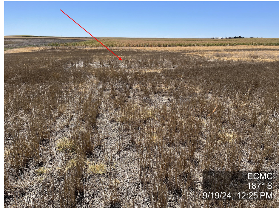
Photo 4. The photo was taken at the well location facing South. Refer to the comment for photo 2. The photo also shows an area of subsidence at the well location.