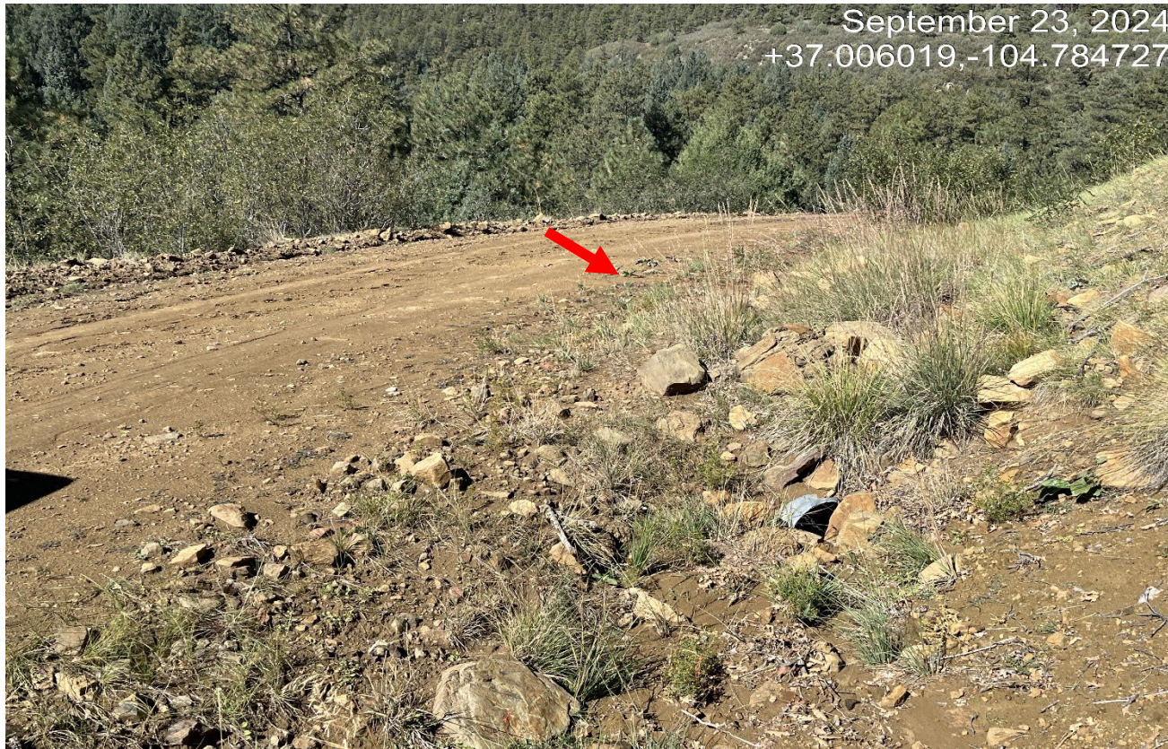
Photo 2. Facing northeast along the road. There are noxious weeds that need to be controlled. Houndstongue., This culvert is mostly filled in and needs to be cleaned out.