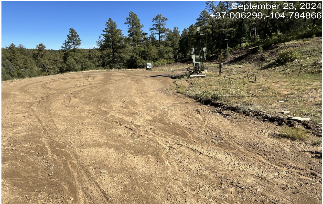
Photo 3. Facing east toward the wellsite.