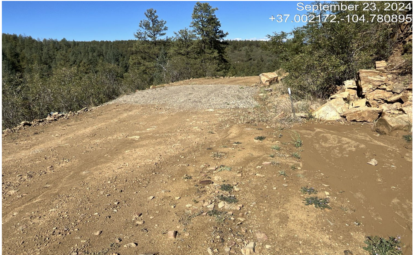
Photo 1. Facing northeast along the access road. The culvert has filled in with sediment and needs to be cleaned out. Previous CA was not completed.