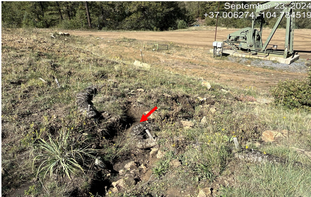
Photo 4. Facing northwest the cut slope. There are erosion channels that need to be repaired. The wattles at red arrow has failed. Previous CA was not completed.