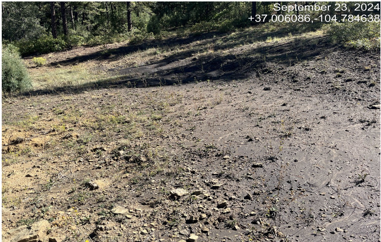
Photo 5. The top of the cut slope need to be stabilized and may require a run-on ditch or other BMP's.