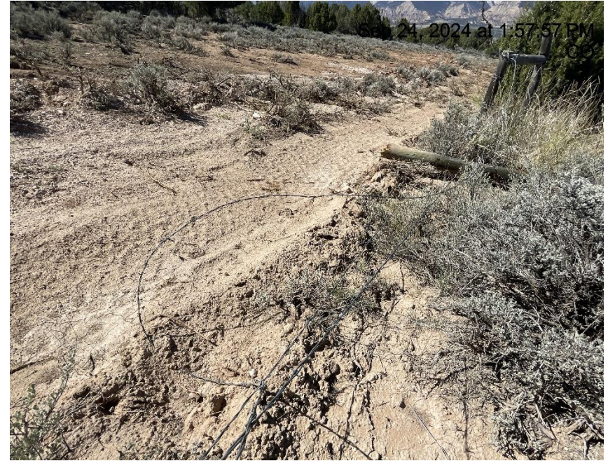
Photo # 1700 Barbed wire fence around location needs maintenance/wildlife hazard (S/SW area of location)