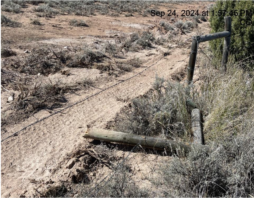
Photo # 1699 Barbed wire fence around location needs maintenance/wildlife hazard (S/SW area of location)