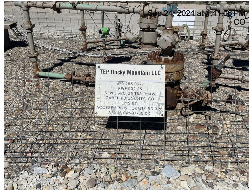
Photo # 1696 RWF 532-25 wellhead sign weathered, cracking & peeling/some info is starting to become illegible