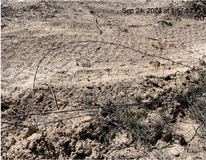
Photo # 1701 Barbed wire fence around location needs maintenance/wildlife hazard (S/SW area of location)