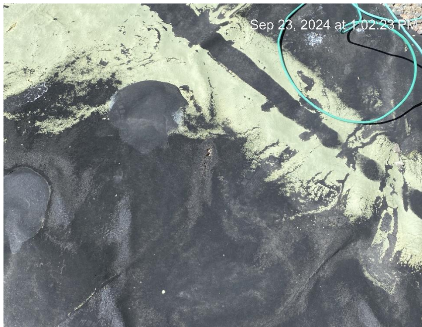
Hole in liner