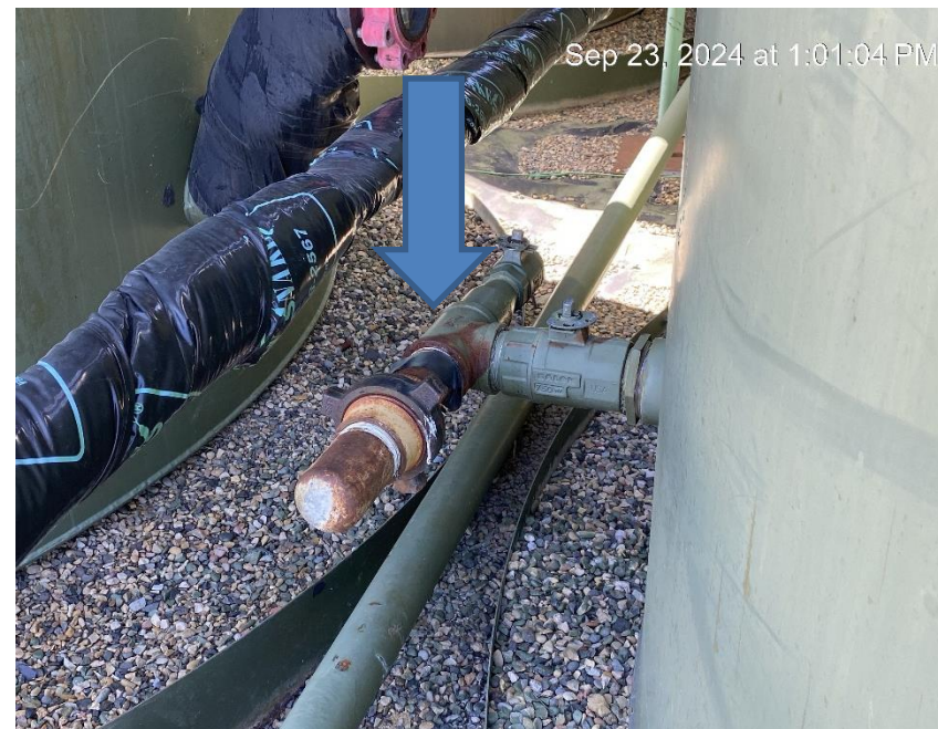
Disconnected Condensate tank