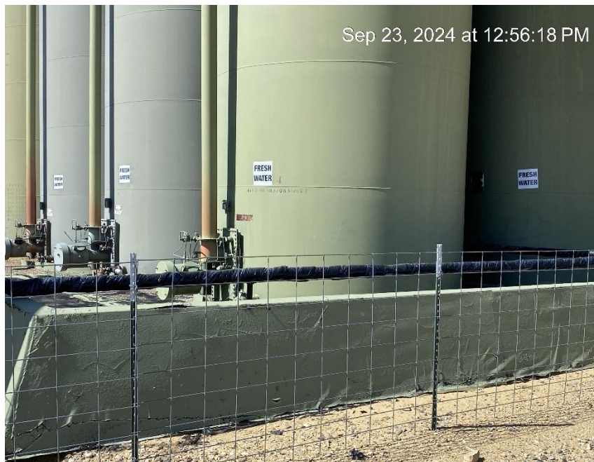
Disconnected Production Tanks relabeled "Fresh Water"