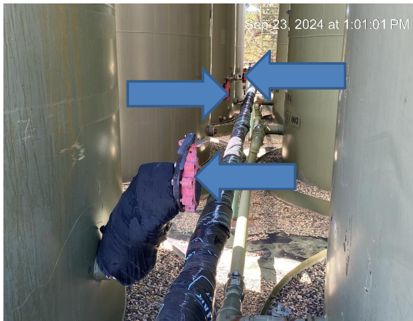
Disconnected Production Water tanks