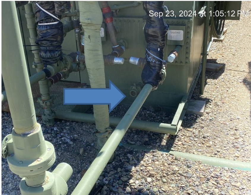
Separator antifreeze drain valve missing plug