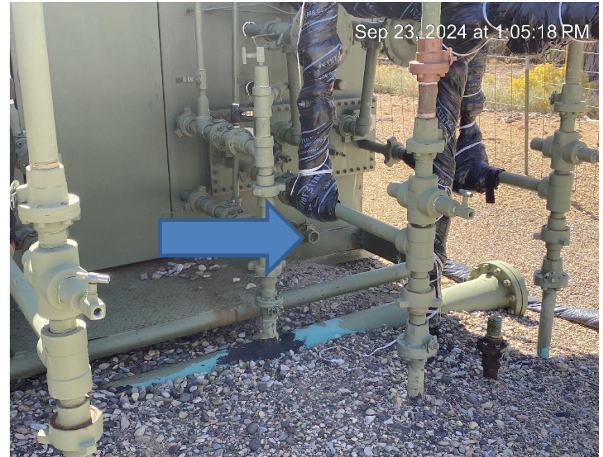
Separator antifreeze drain valve missing plug