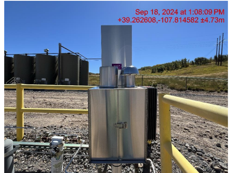
TEG - Photo #06046