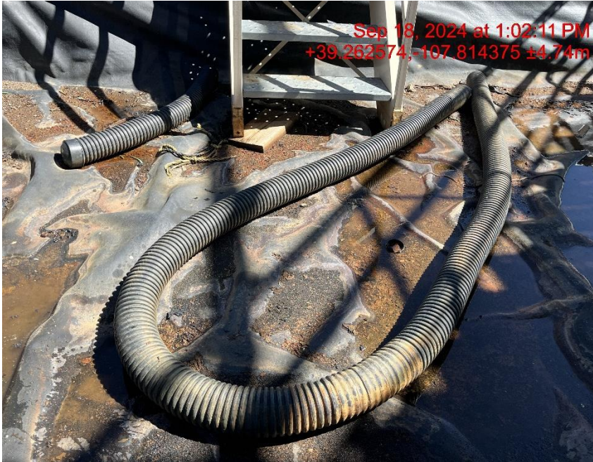
Debris - Photo #06038