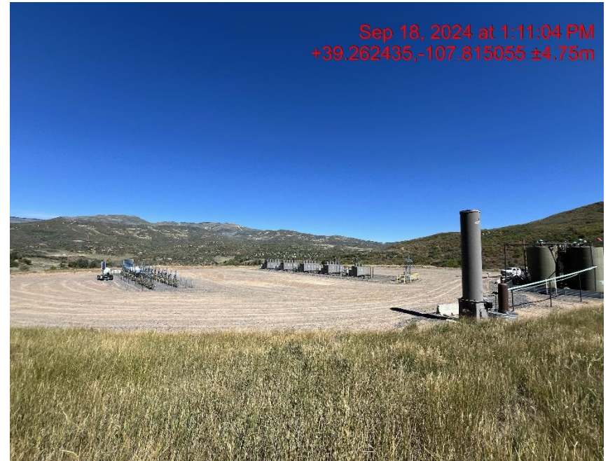
ECD - Photo #06049

Sep 18, 2024 at 1:11:04 PM +39.262435,-107.815055 ±4.75m