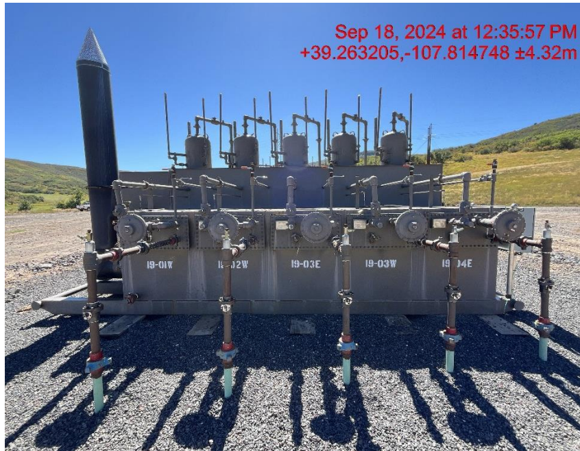
Separators - Photo #06001