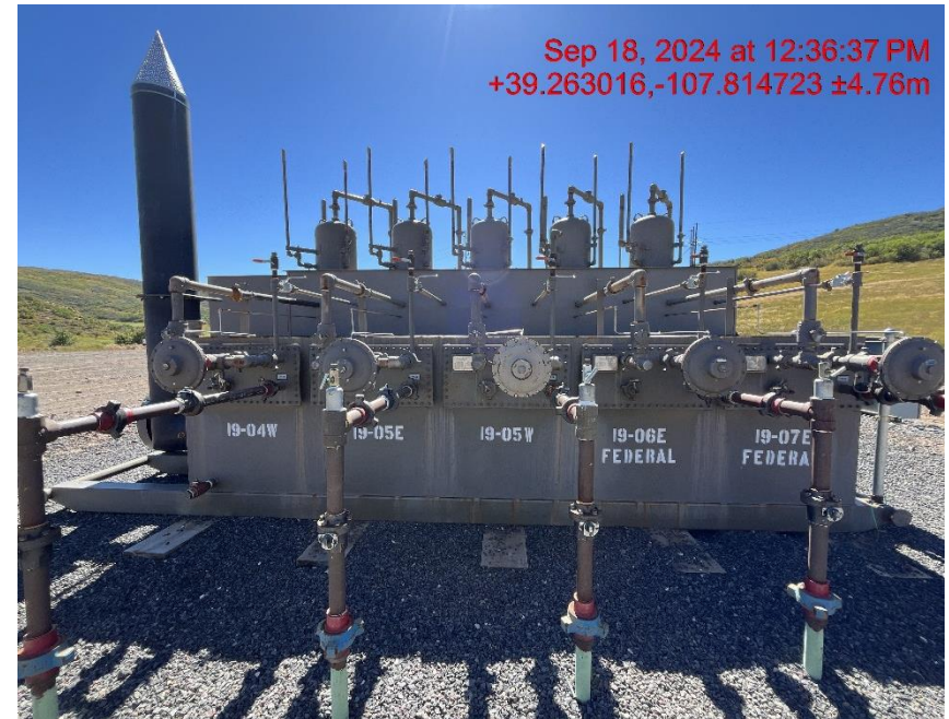
Separators - Photo #06002