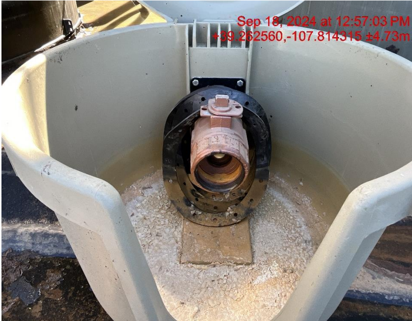
Open ended load line - Photo #06029