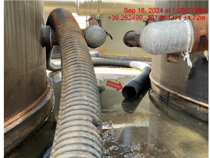
Wildlife hazard - Photo #06042