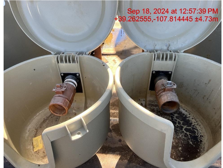
Open ended load lines - Photo #06030