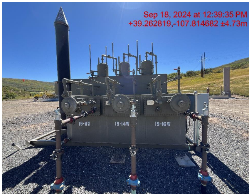
Separators - Photo #06005