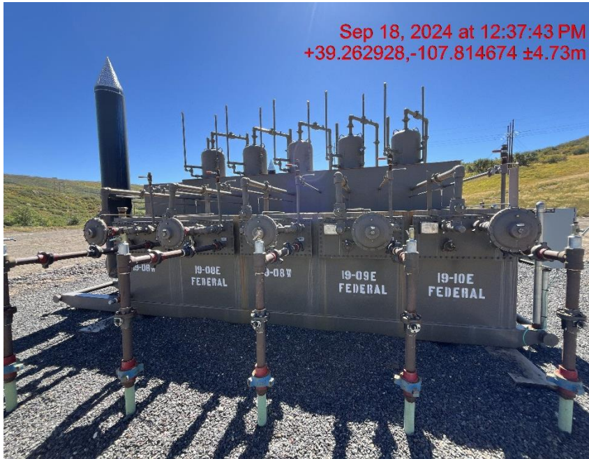
Separators - Photo #06003