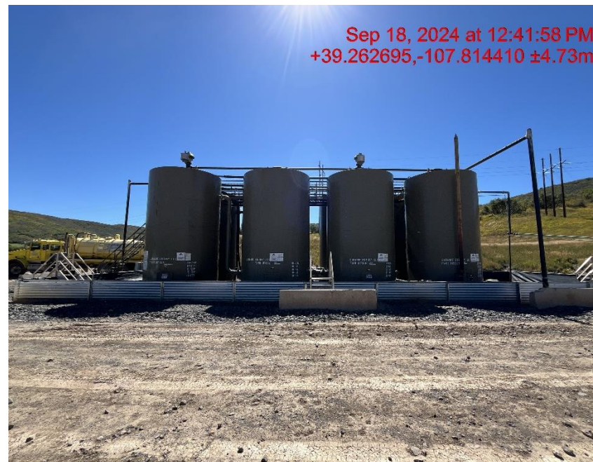
Tank battery - Photo #06007