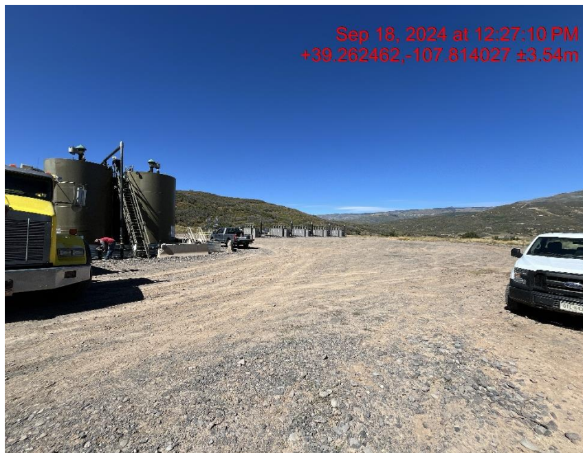
Entrance to location - Photo #05995