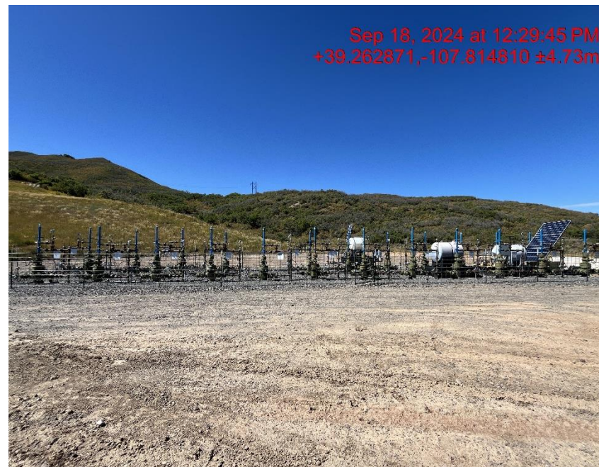
Wellheads - Photo #05996