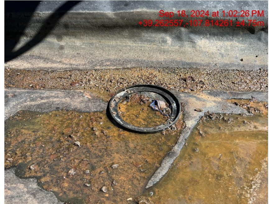
Debris - Photo #06039