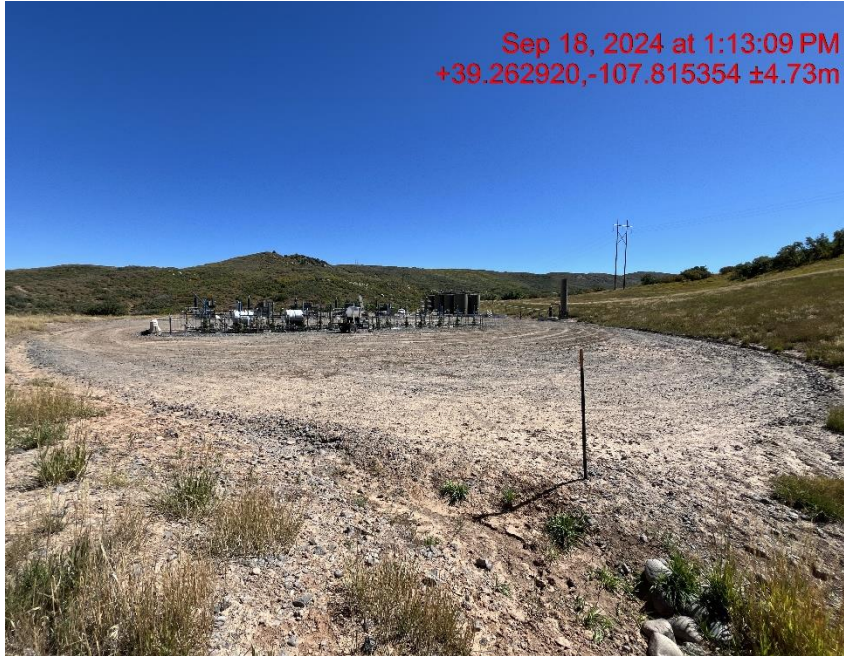
NW corner of location - Photo #06051