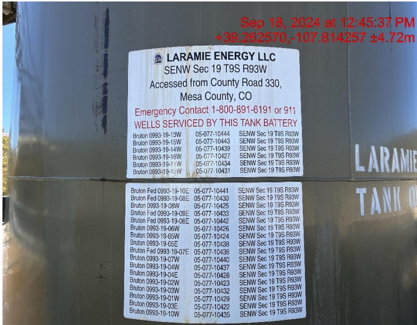
Location - Photo #06009