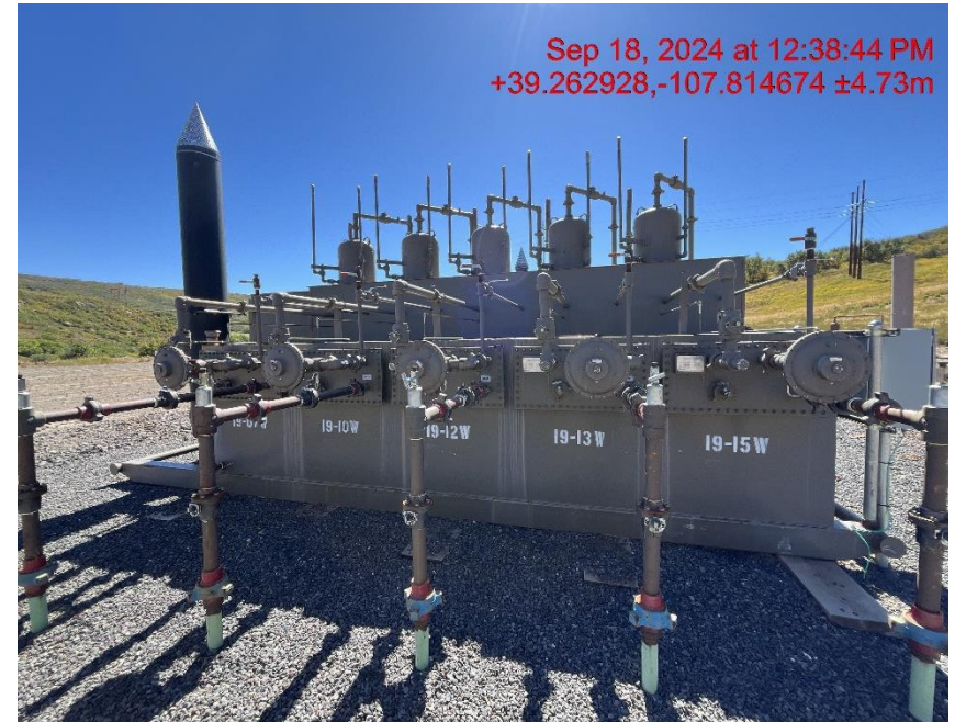
Separators - Photo #06004