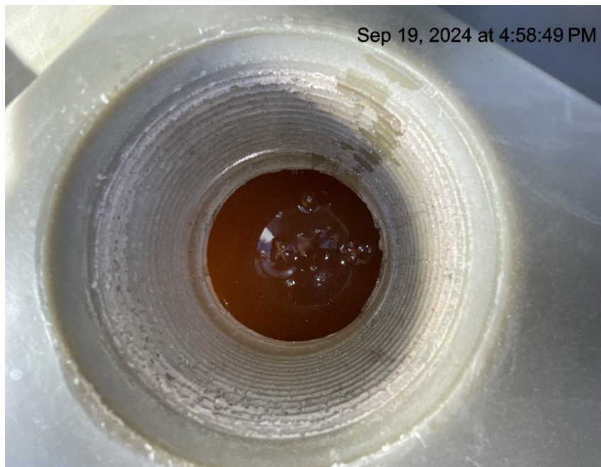
Photo # 1375 Failure to maintain chemical BMP/chemical tank containment full of fluid/BMP insufficient to contain possible spill