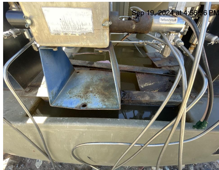
Photo # 1376 Failure to maintain chemical BMP/chemical tank containment full of fluid/BMP insufficient to contain possible spill (Fluid on the top of chemical tank containment is also a wildlife hazard)