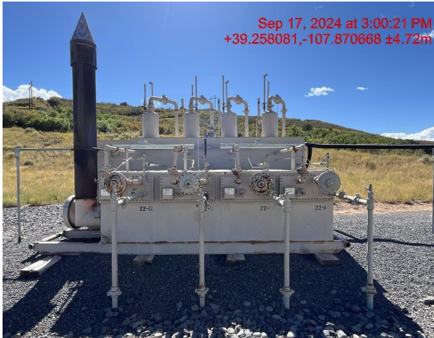
Separators - Photo #05880