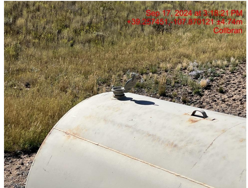
Wildlife hazard - Photo #05903