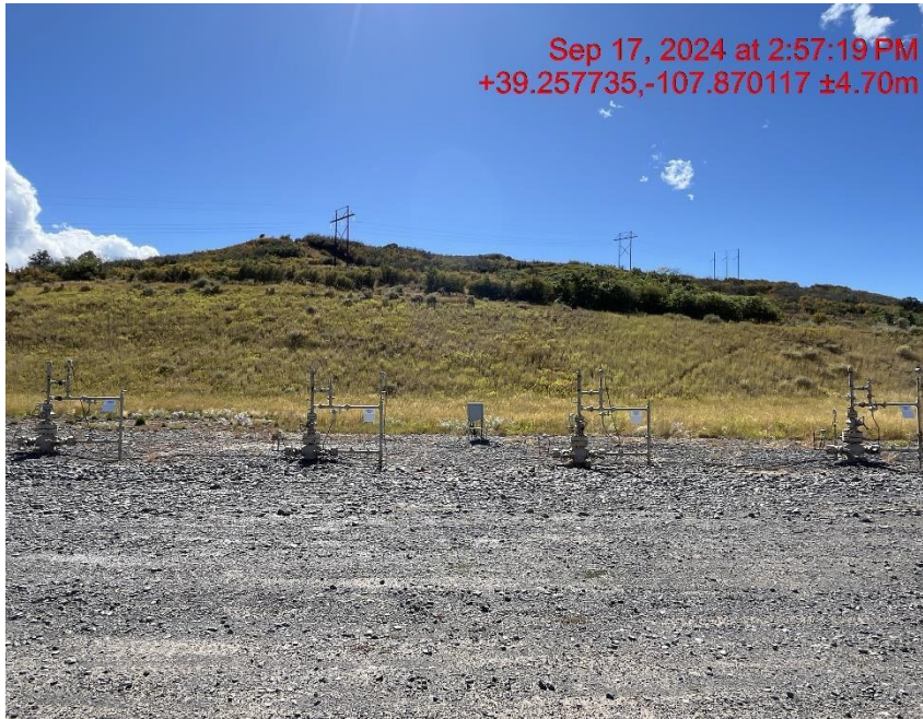
Wellheads - Photo #05877