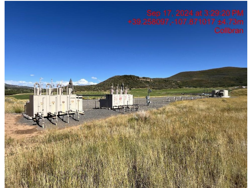
NW corner of location - Photo #05913