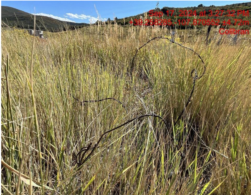
Wildlife hazard - Photo #05910