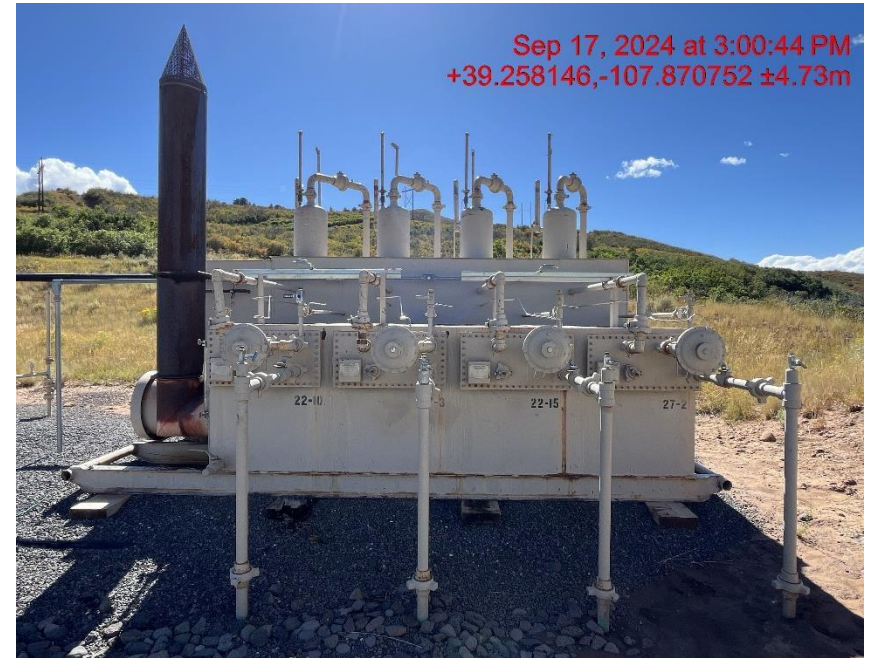
Separators - Photo #05881