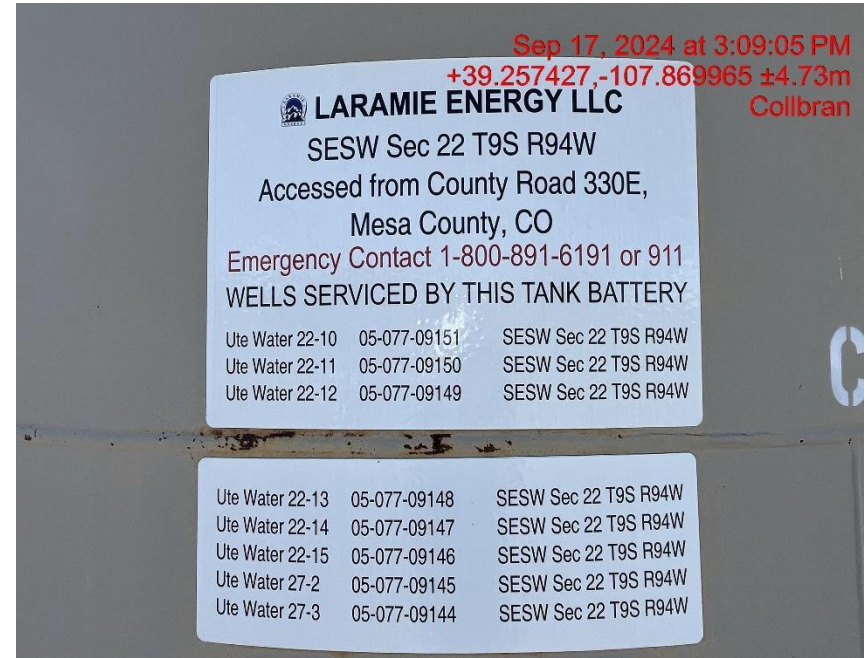
Tank battery - Photo #05887

Sep 17, 2024 at 3:09:05 PM +39.257427,-107.869965 ±4.73m Collbran