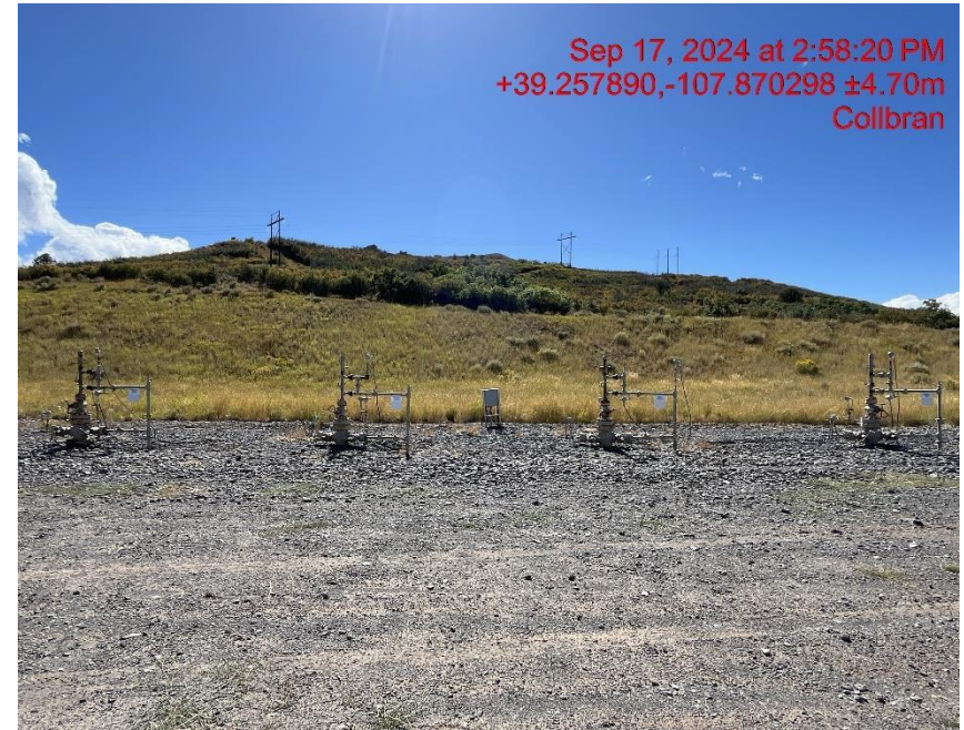
Wellheads - Photo #05878