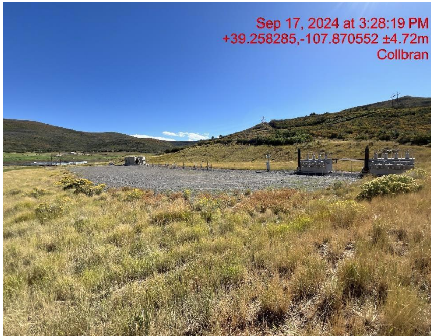
NE corner of location - Photo #05912