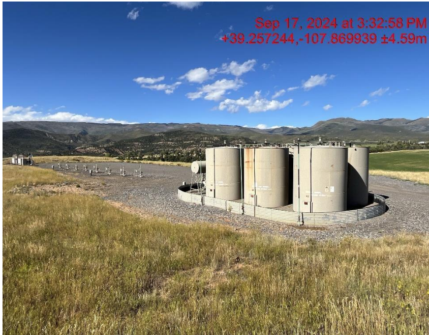
SW corner of location - Photo #05915