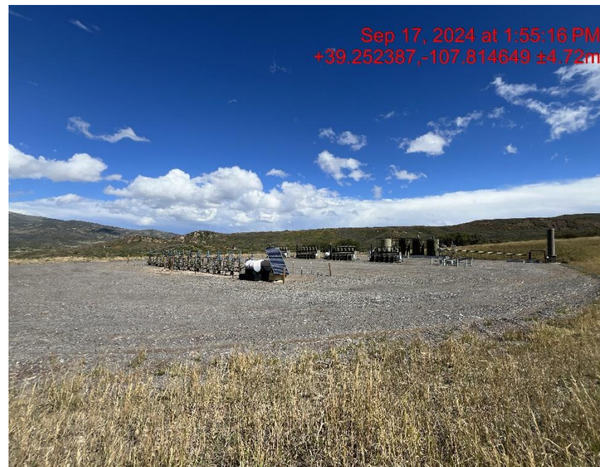
SW corner of location - Photo #05864