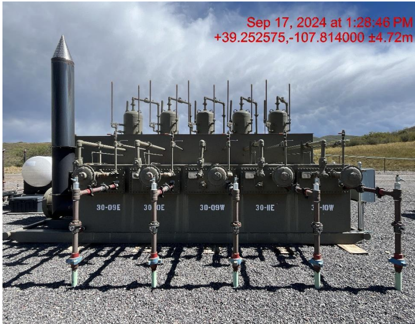
Separators - Photo #05833