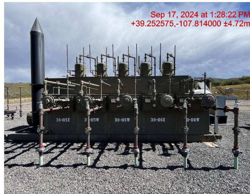
Separators - Photo #05831