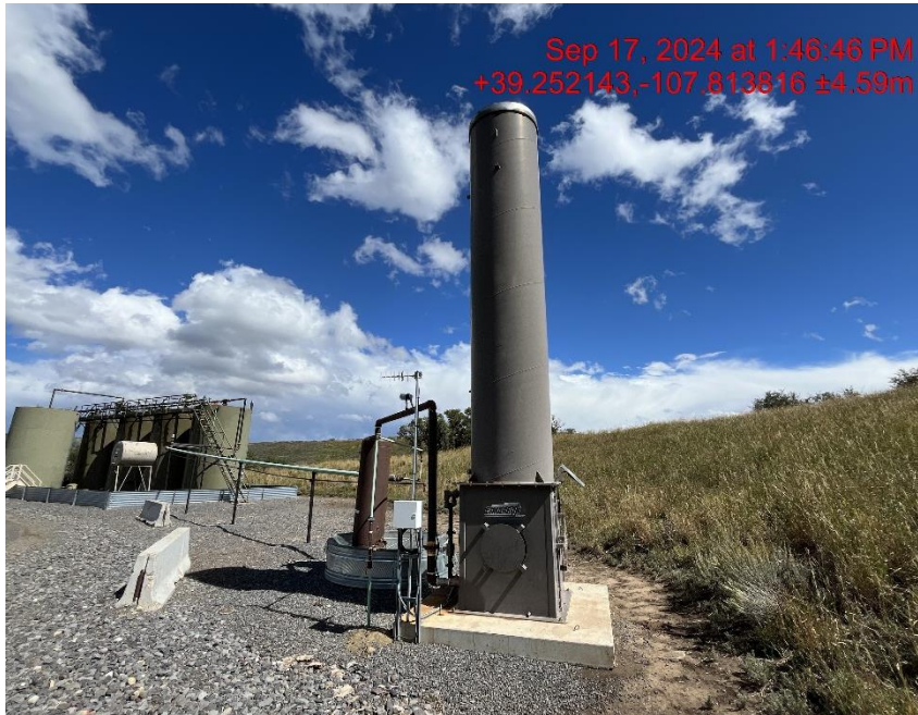
ECD - Photo #05856