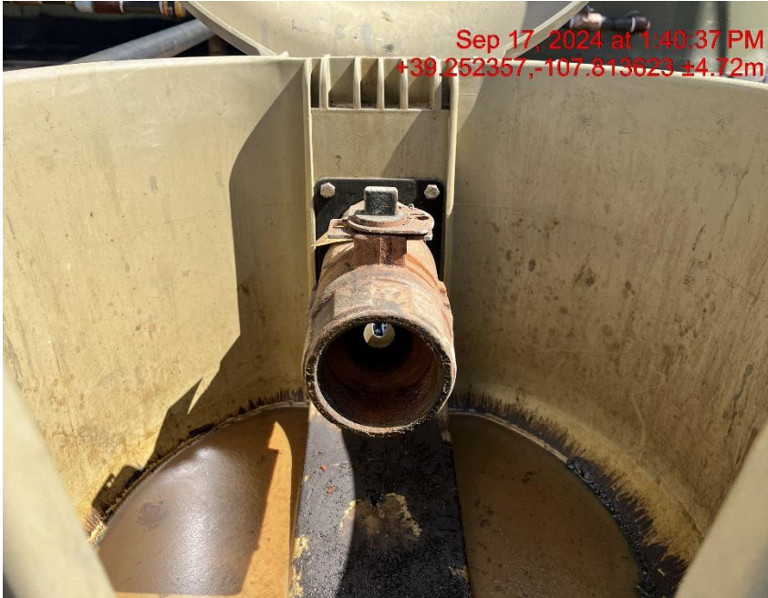
Open ended load line - Photo #05851