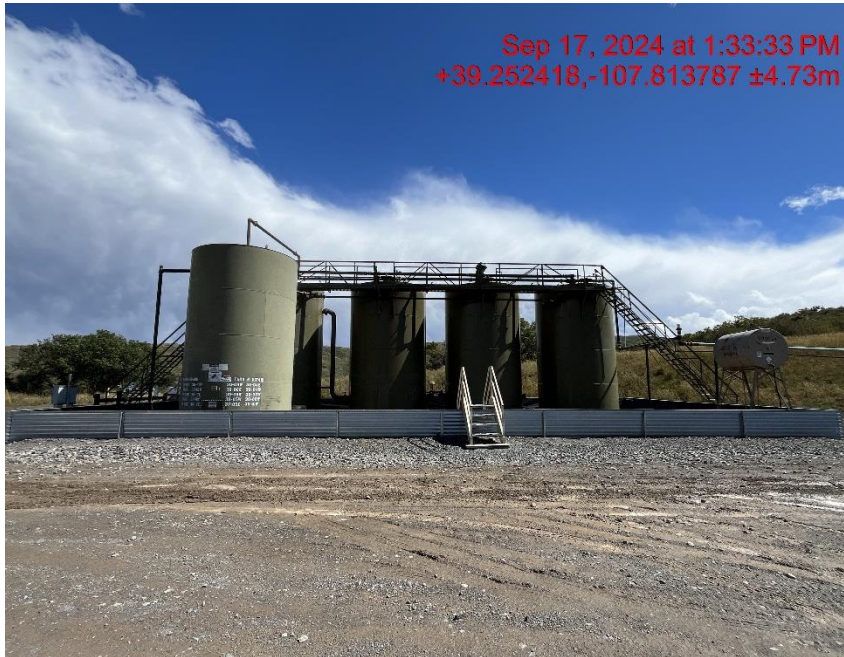
Tank battery - Photo #05841