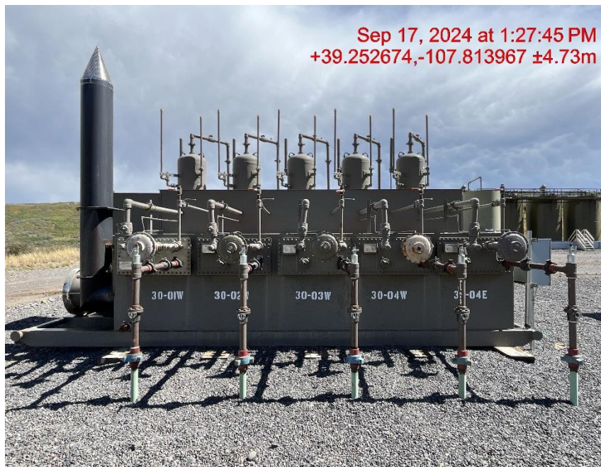
Separators - Photo #05830