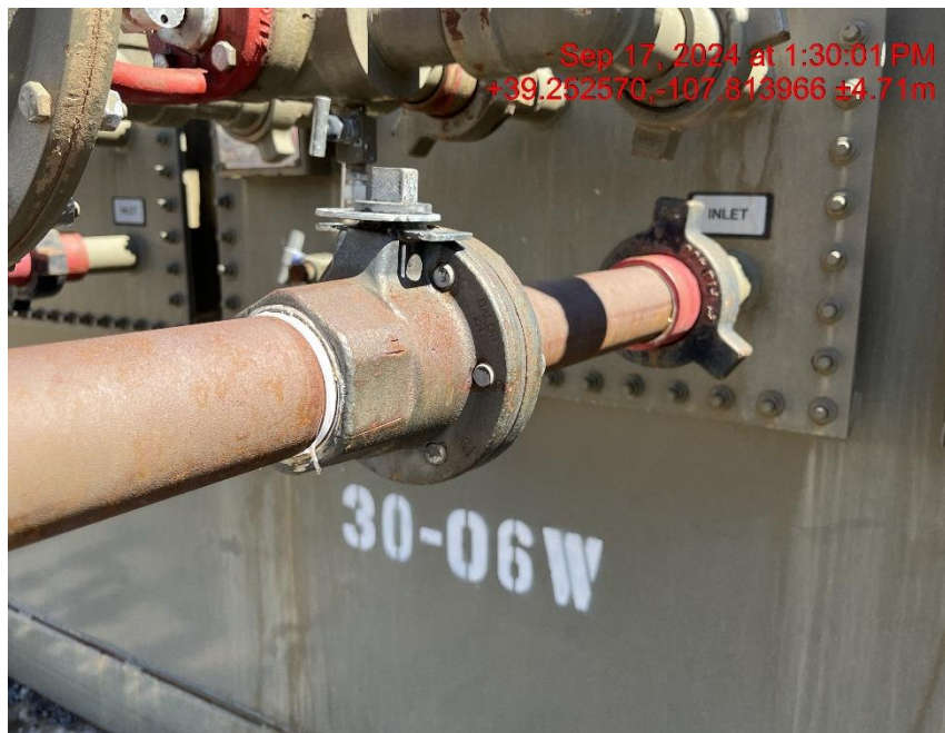
Shut in - Photo #05835