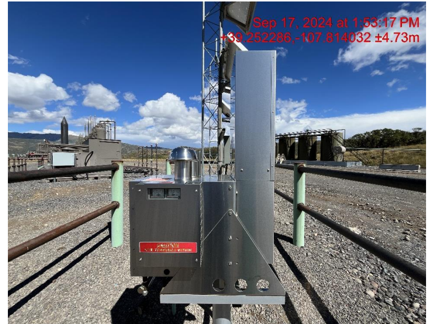
TEG - Photo #05862