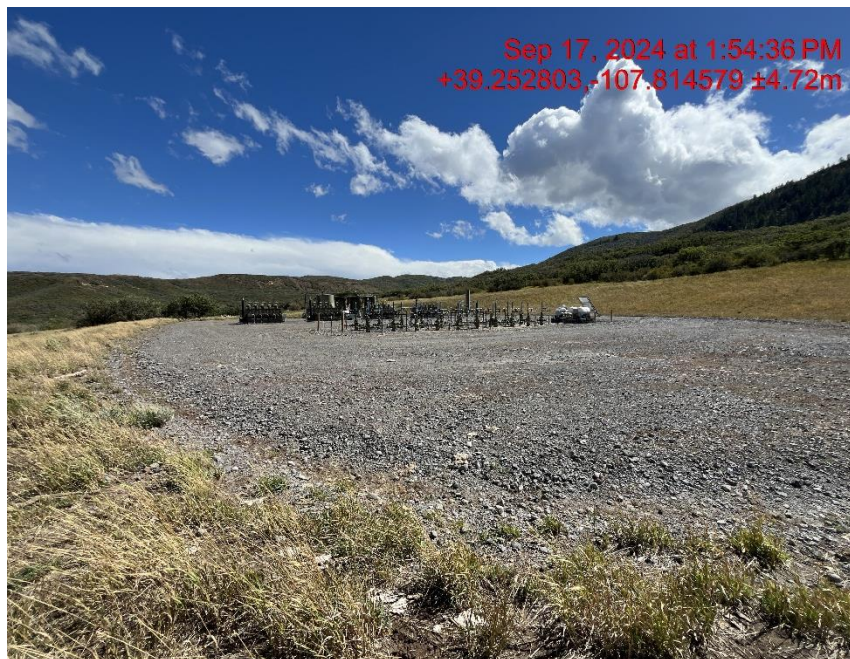
NW corner of location - Photo #05863