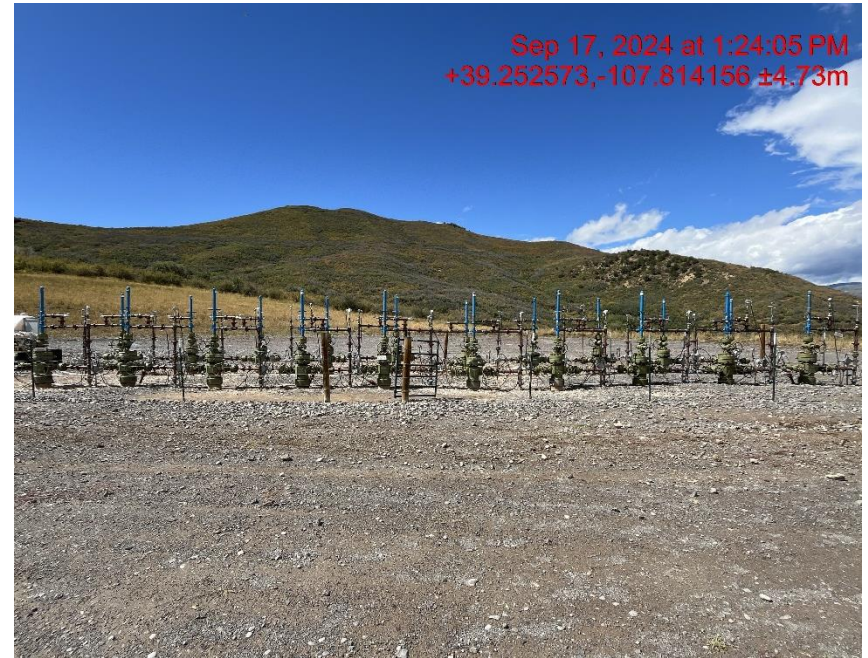
Wellheads - Photo #05824