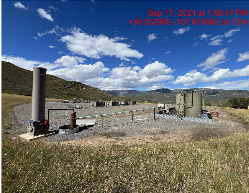
SE corner of location - Photo #05865