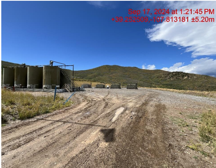
Entrance to location - Photo #05823