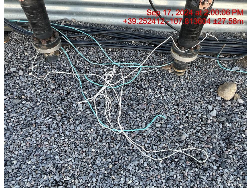
Debris - Photo #05866