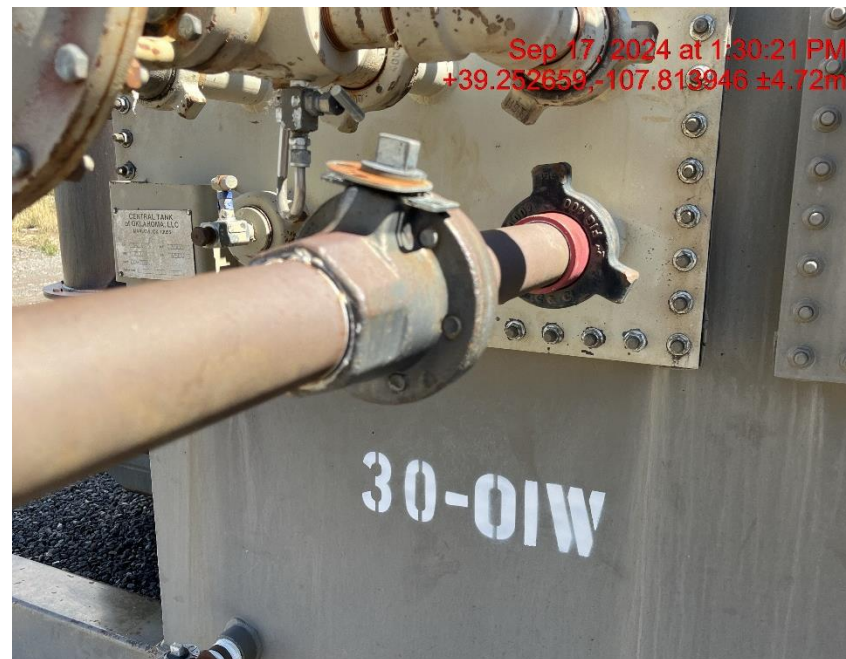
Shut in - Photo #05836