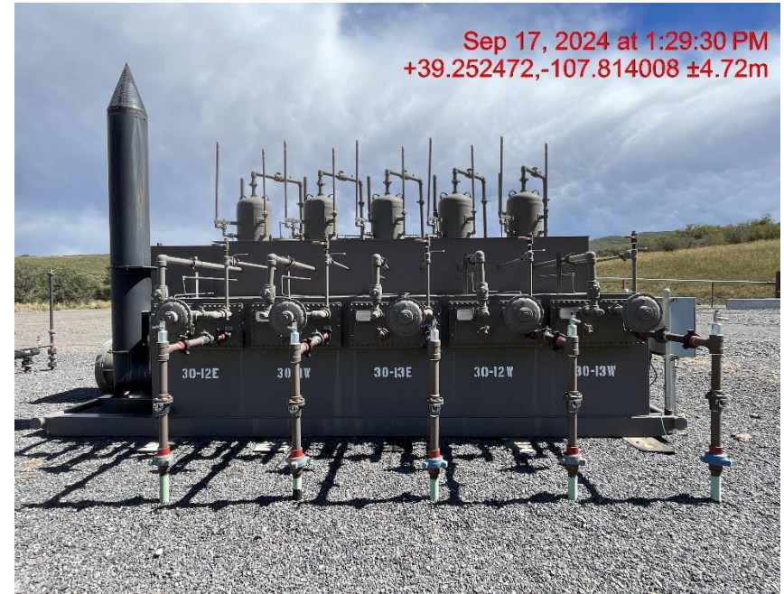
Separators - Photo #05834