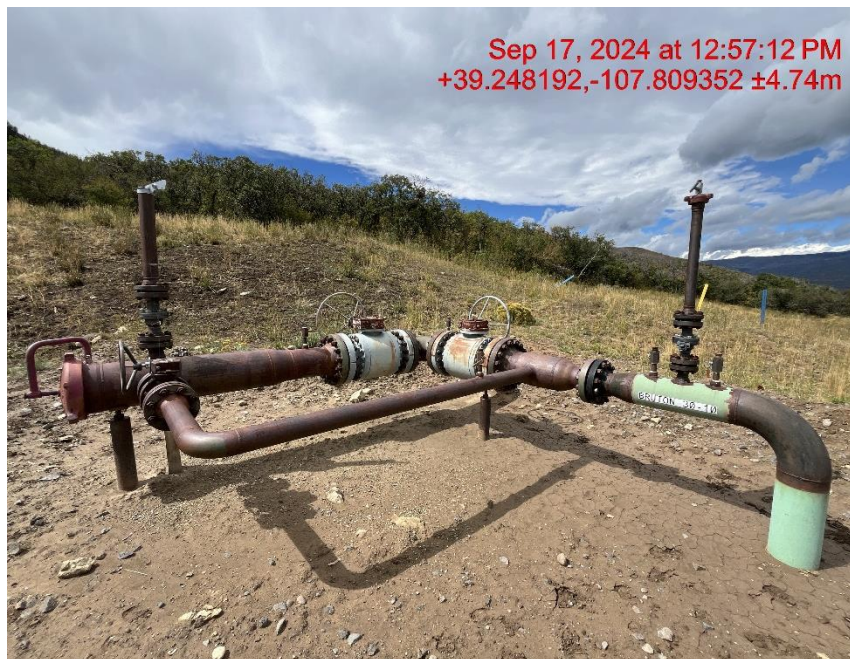
Pig station - Photo #05791