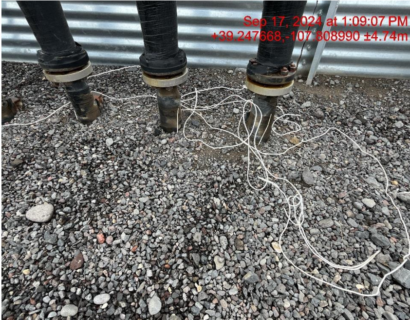
Debris - Photo #05880