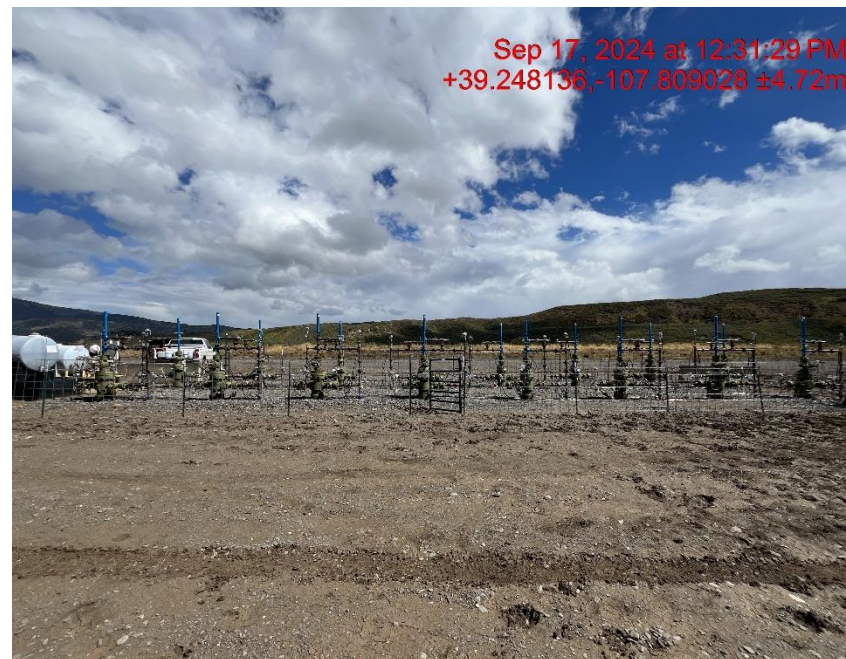
Wellheads - Photo #05757