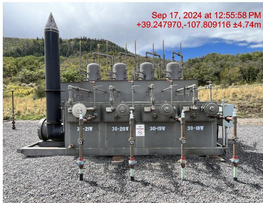
Separators - Photo #05787