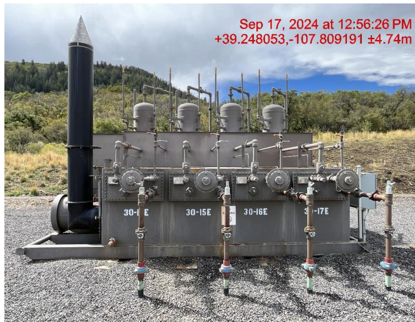
Separators - Photo #05789