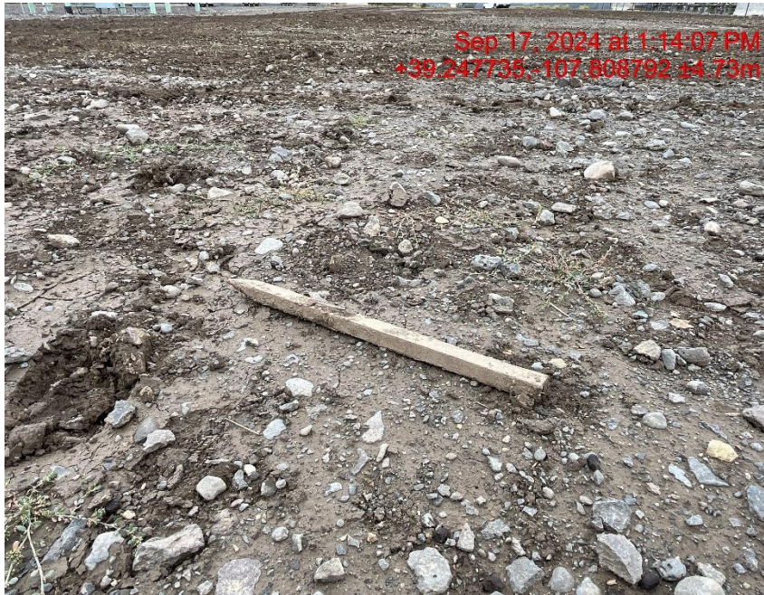
Debris - Photo #05816