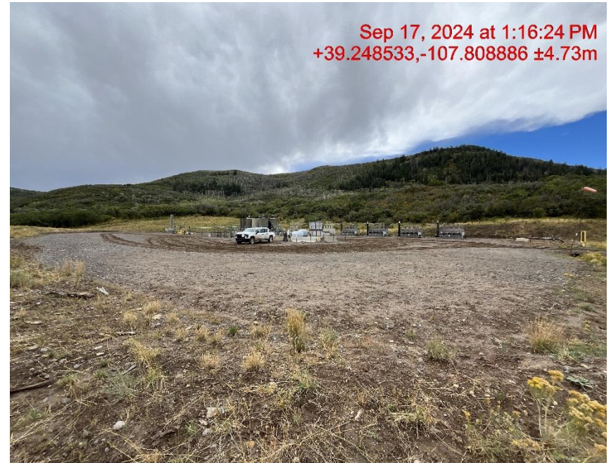
NE corner of location - Photo #05818