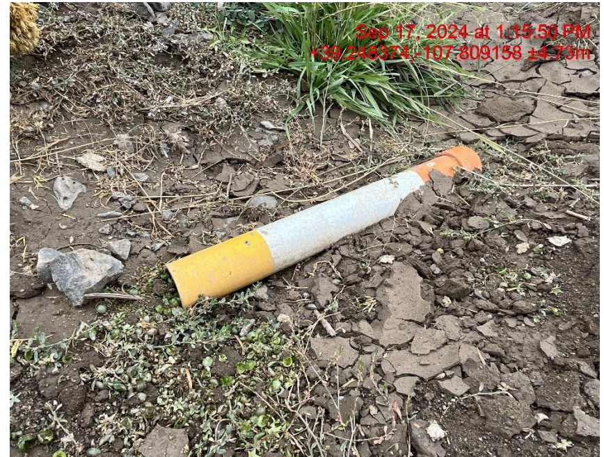
Debris - Photo #05817