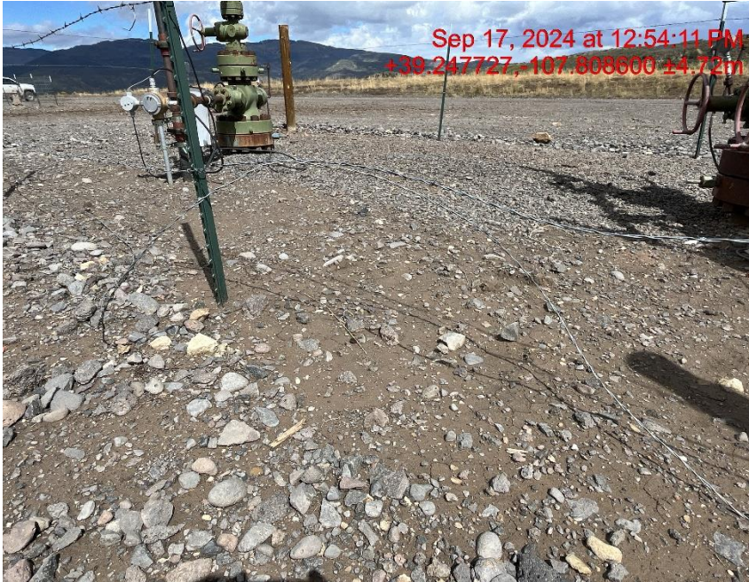
Wildlife hazard - Photo #05783