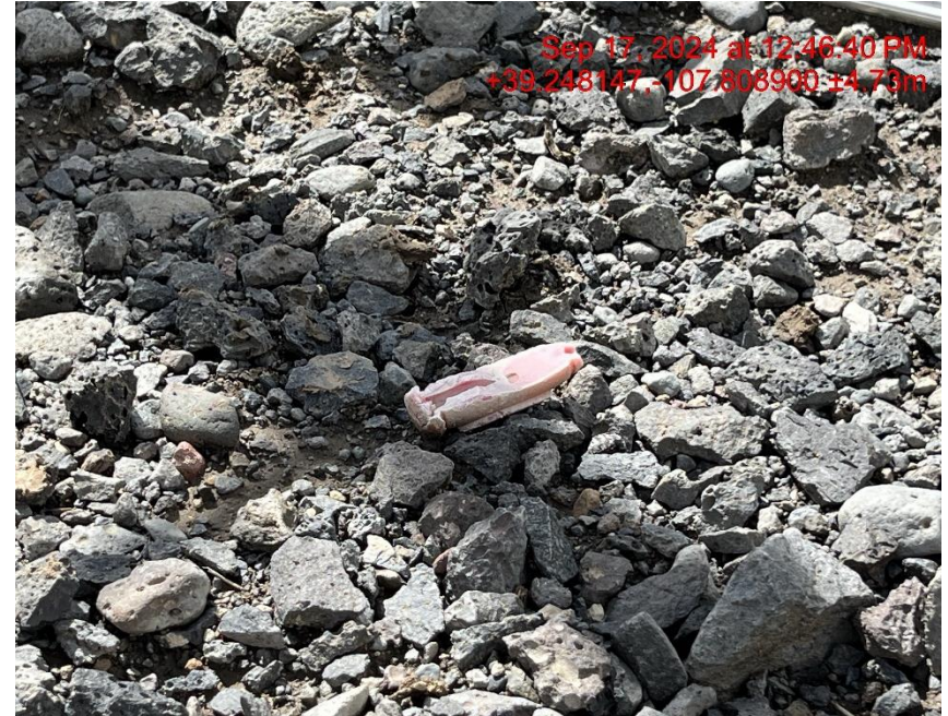
Debris - Photo #05771