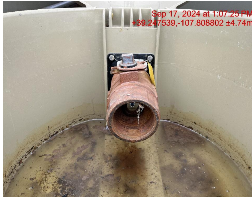
Open ended load line - Photo #05805