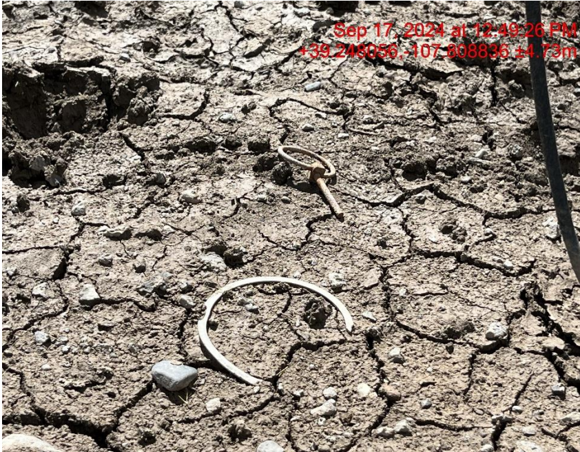
Debris - Photo #05776