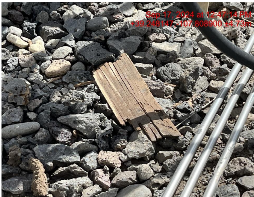
Debris - Photo #05773