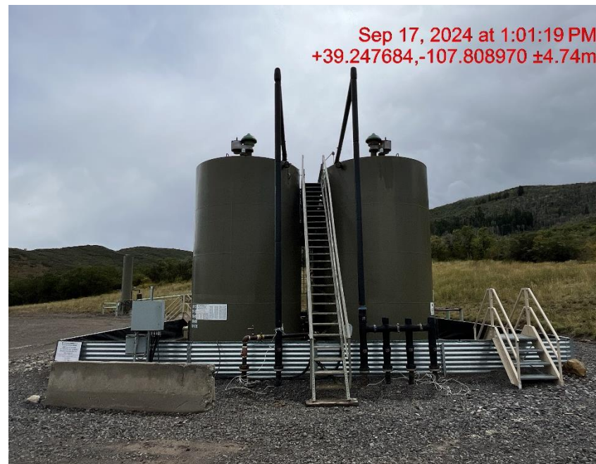
Tank battery - Photo #05793