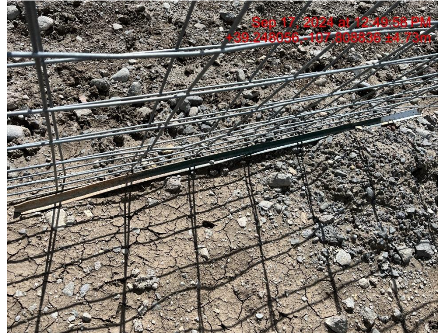
Debris - Photo #05777