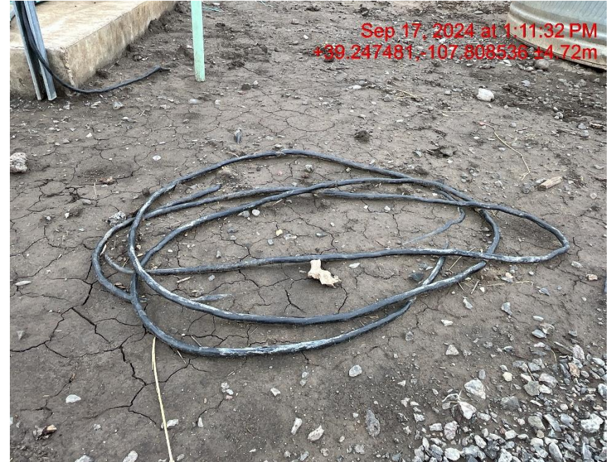
Debris - Photo #05813