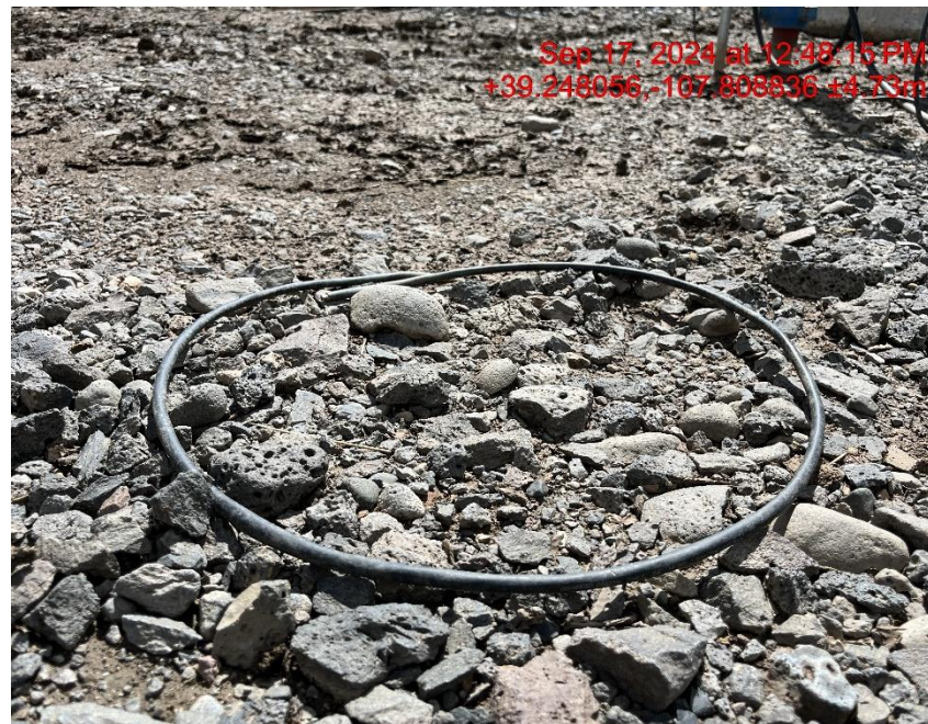
Debris - Photo #05775