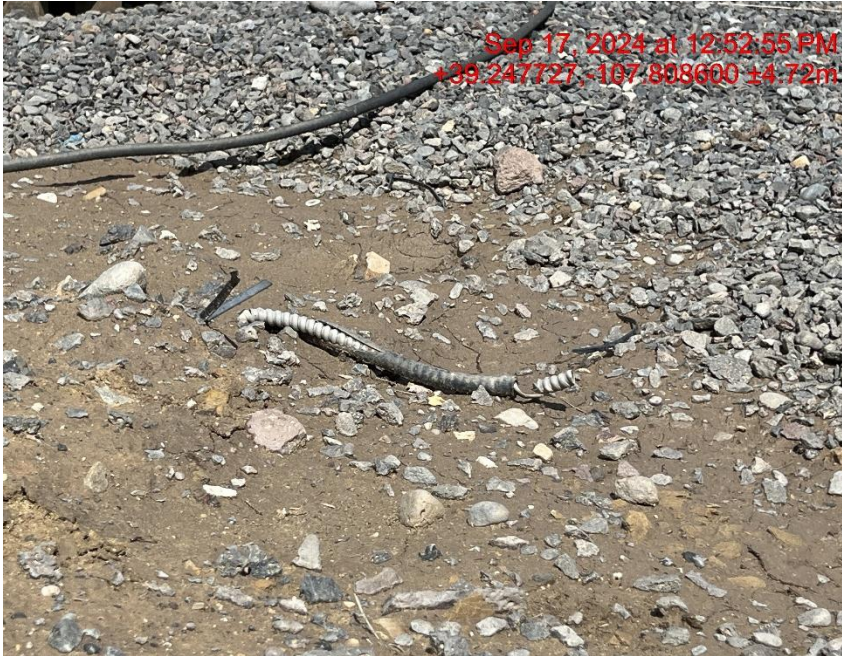
Debris - Photo #05780