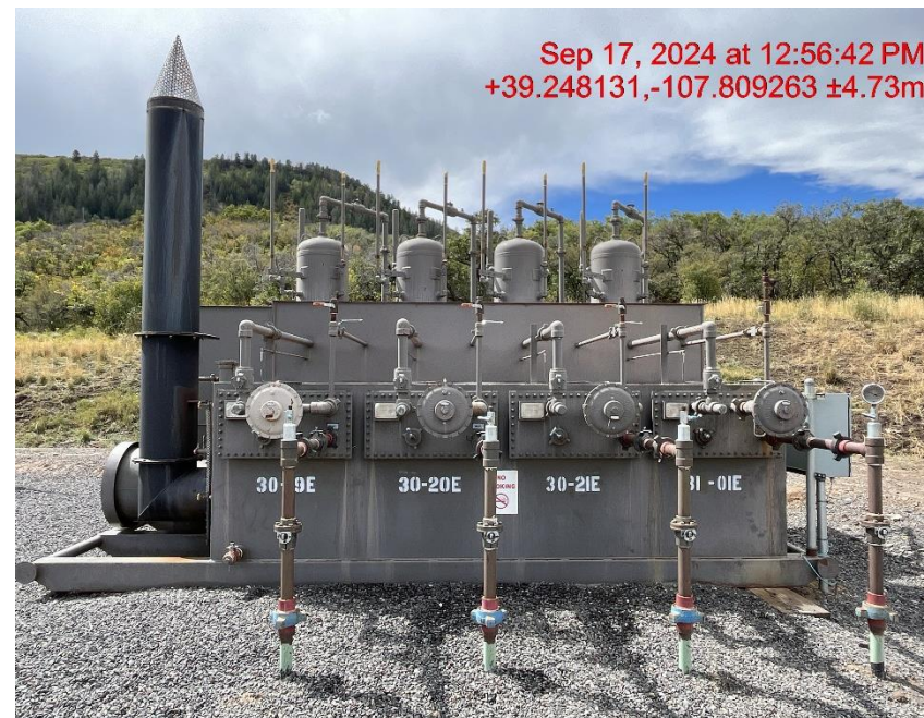
Separators - Photo #05790