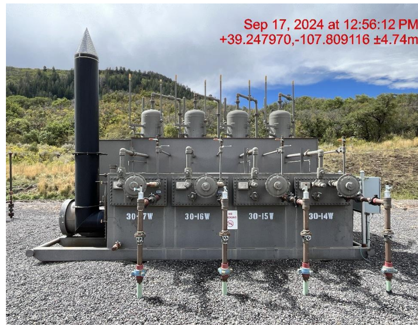
Separators - Photo #05788