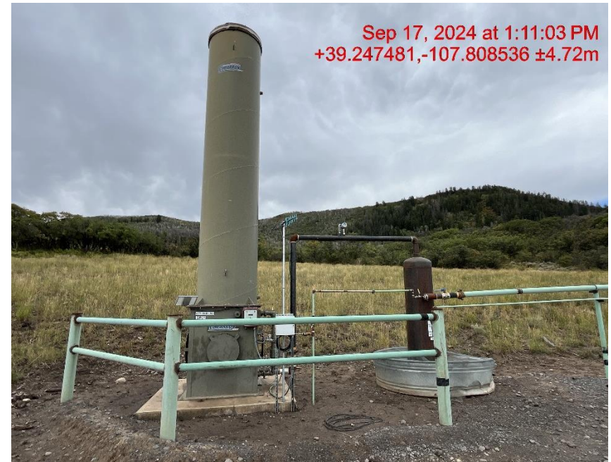
ECD - Photo #05812