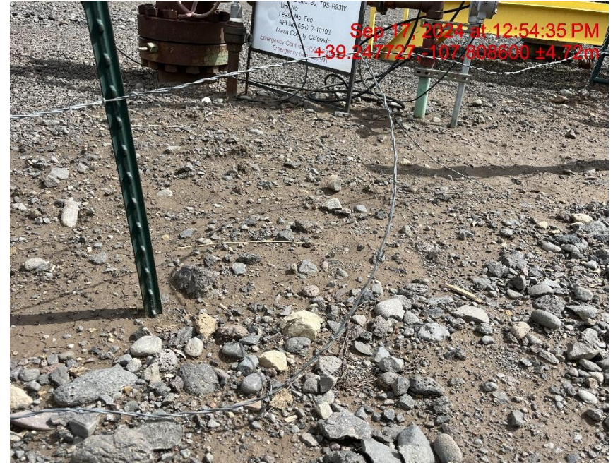
Wildlife hazard - Photo #05784