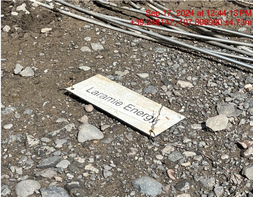
Debris - Photo #05770