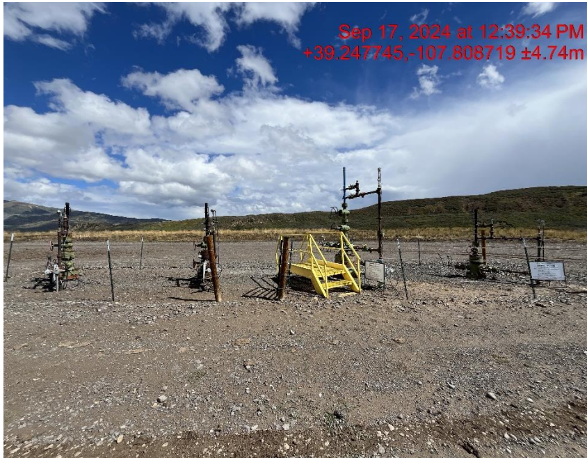
Wellheads - Photo #05767