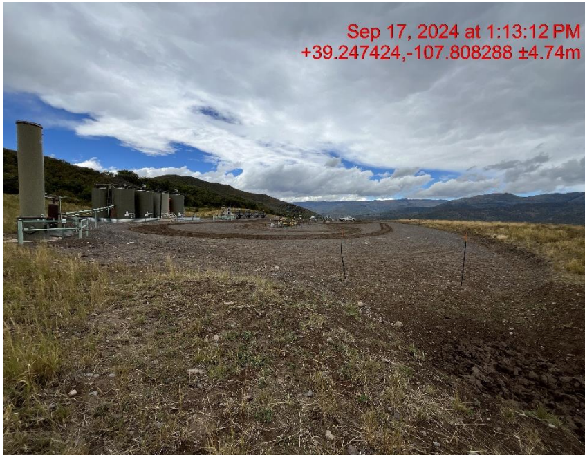
SE corner of location - Photo #05814