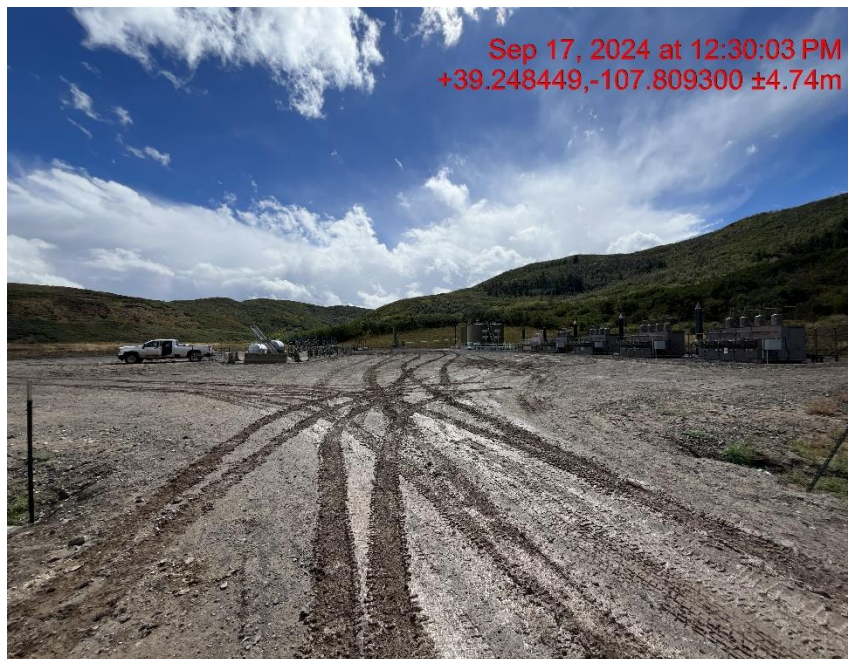
Entrance to location - Photo #05756