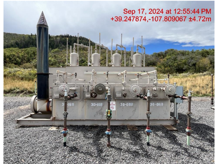
Separators - Photo #05786