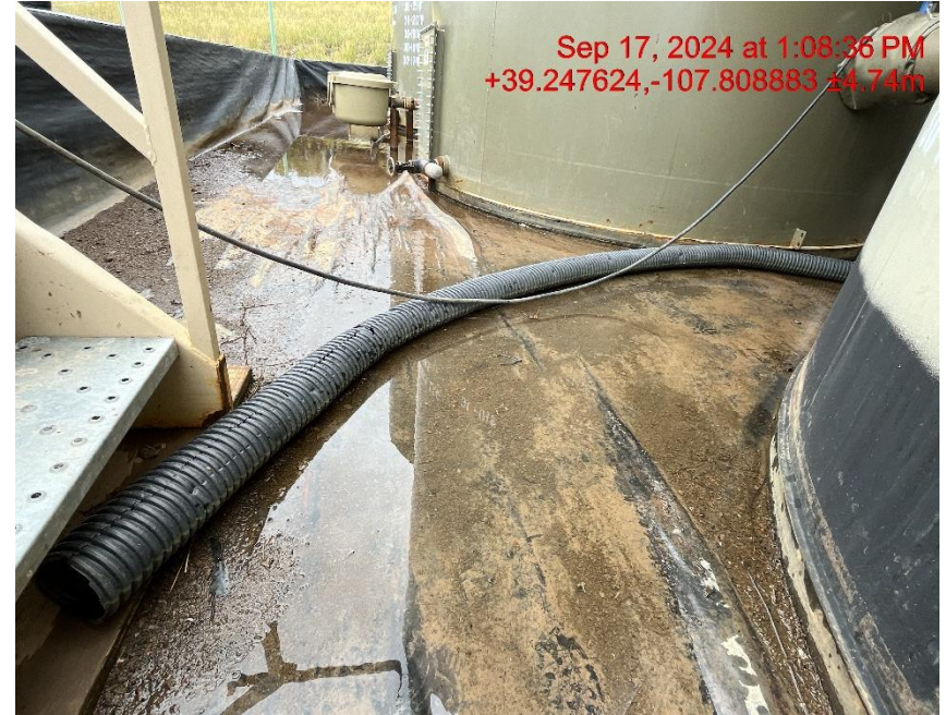
Debris - Photo #05807