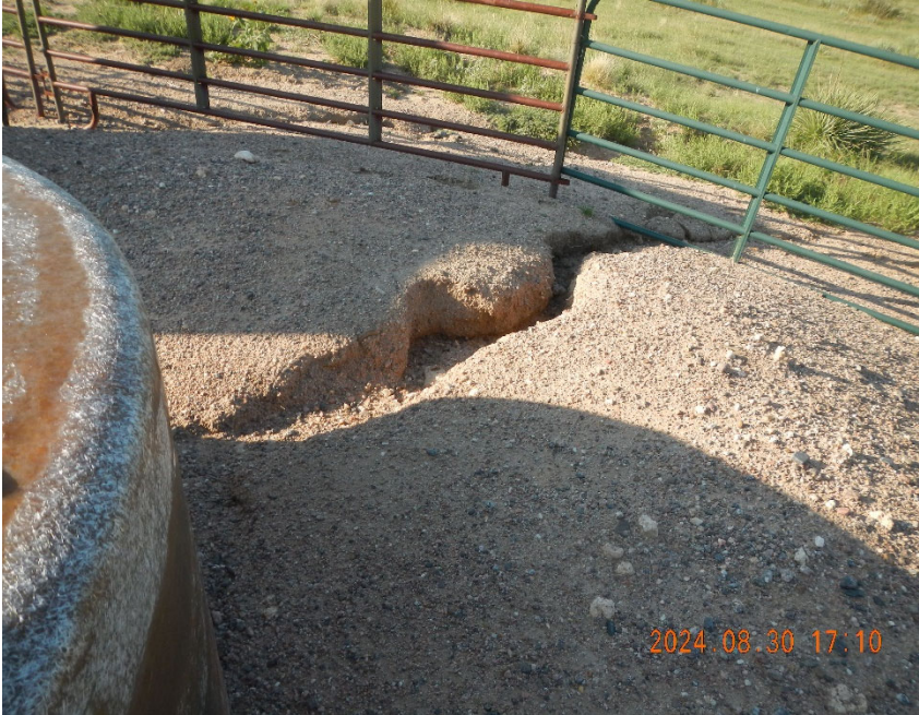
7. Erosion channel that has cut through berm wall.