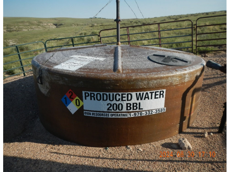
4. Produced water tank at well location.