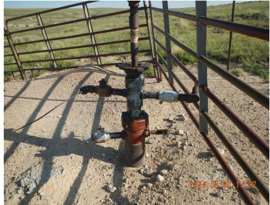
2. View of wellhead.