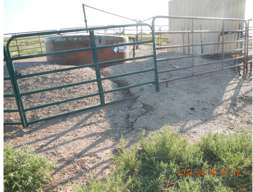
8. Channel coming through fencing and flowing down grade off location.