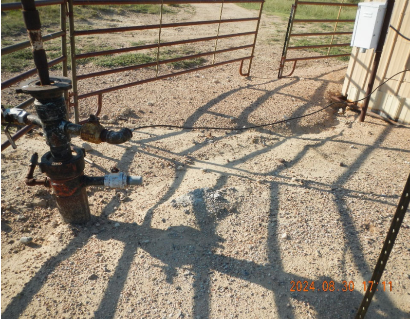
5. Erosion channel that starts above wellhead and flows towards meter shed.