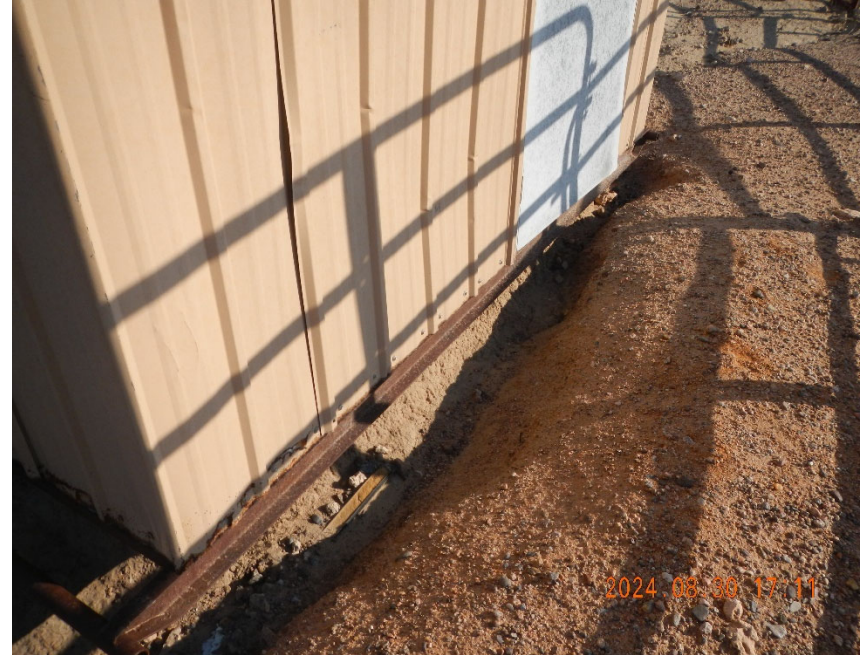
6. Erosion channel at front of meter shed.