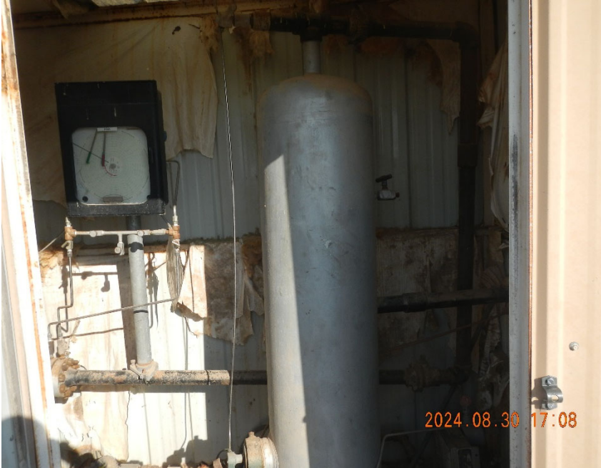
3. Gas meter and vertical separator inside shed.