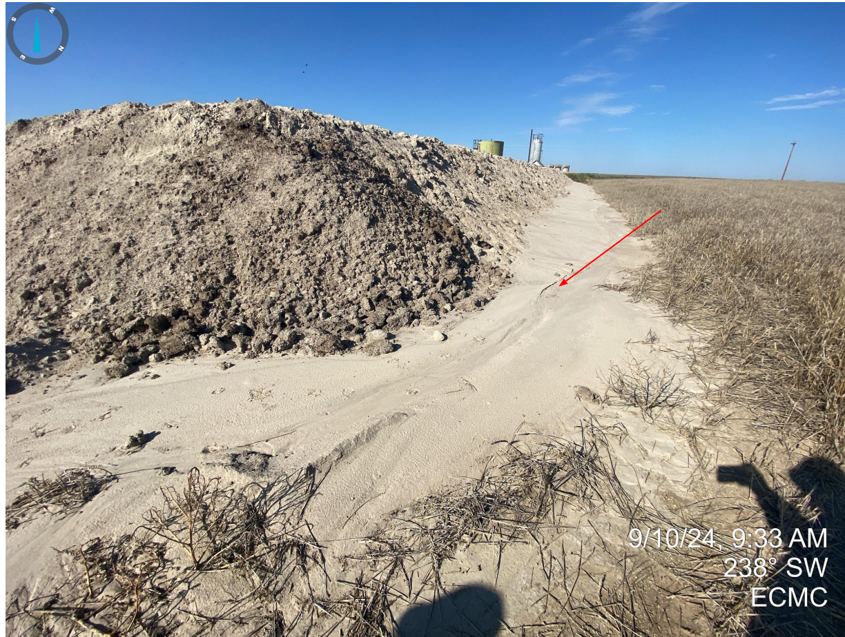
Photo 10. Northeast corner of pit, facing southwest. No apparent stormwater controls measures observed around the northern portion of the pit. Red arrow indicates erosion degradation.