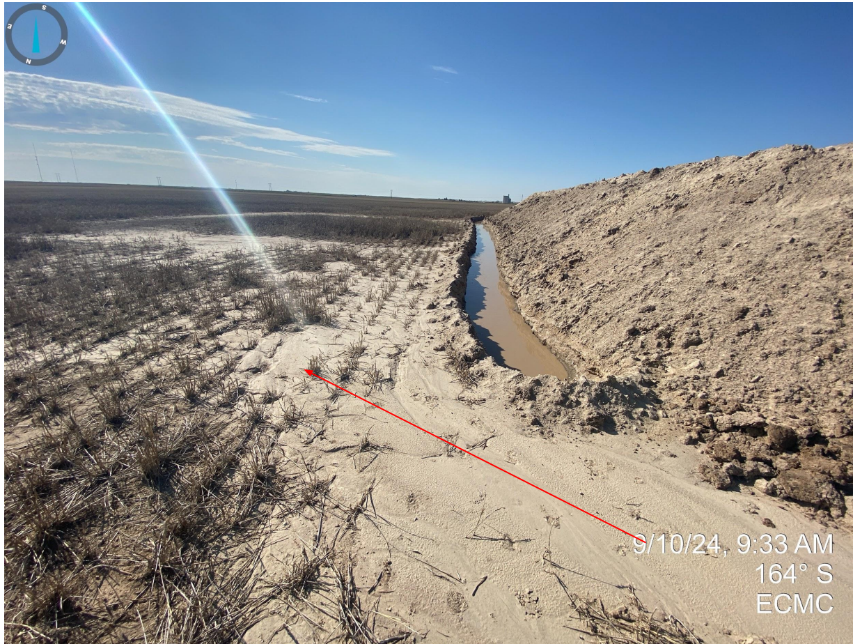
Photo 11. Continued from Photo 10. Evidence of sediment transport in the adjacent field.