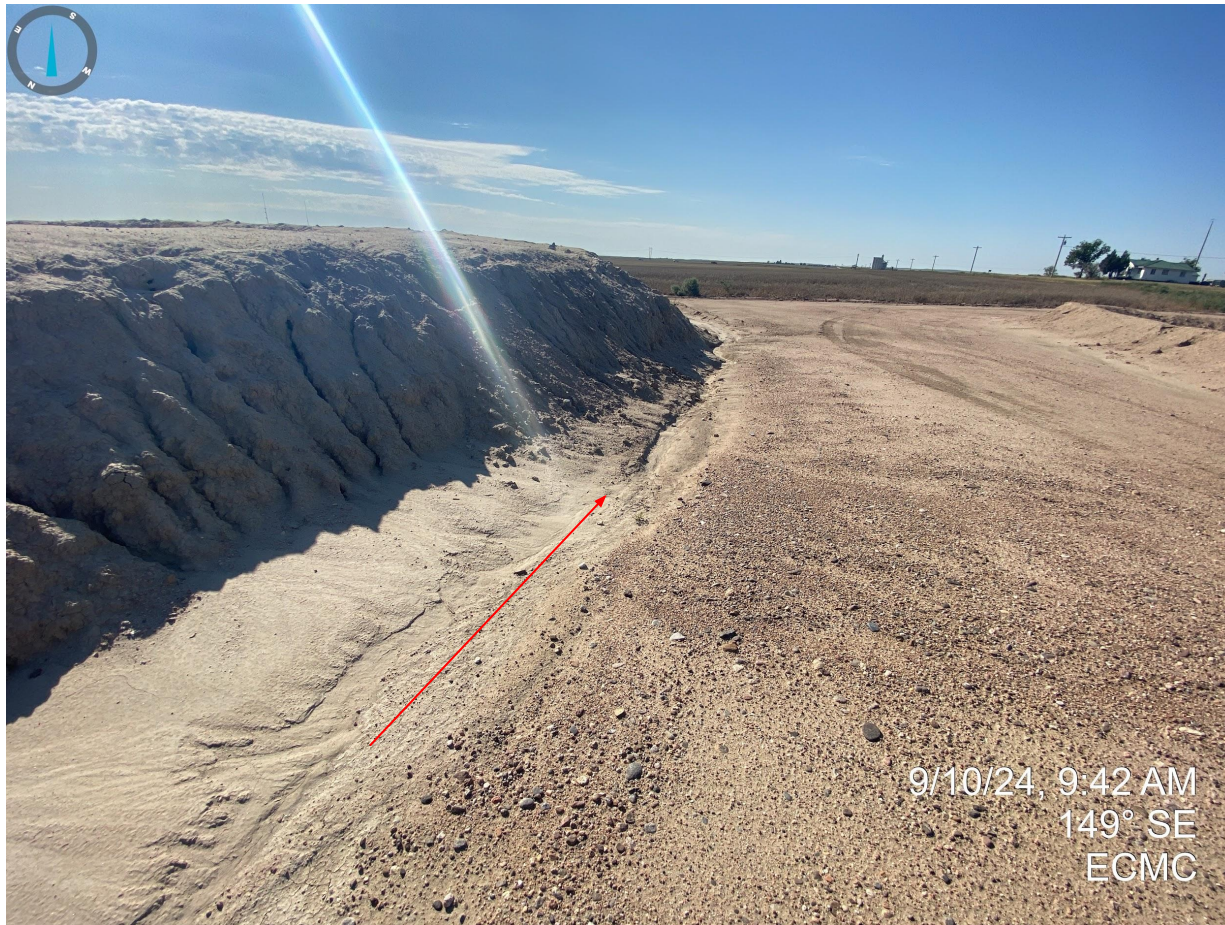
Photo 15. Continued from Photo 14; Erosion degradation observed on the western portion of the pit.