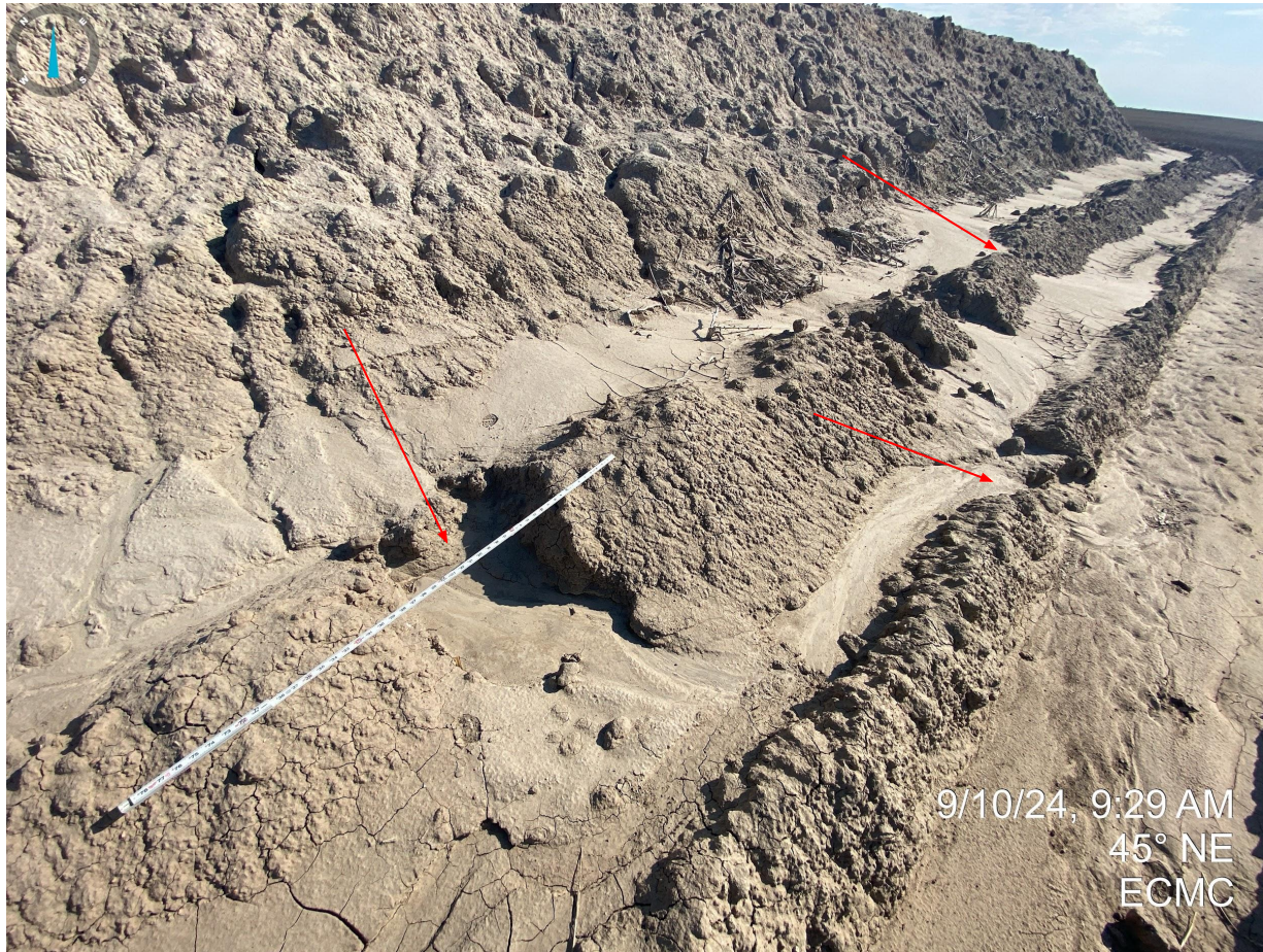
Photo 5. Continued from Photo 4. Berm material does not appear to be properly stabilized.