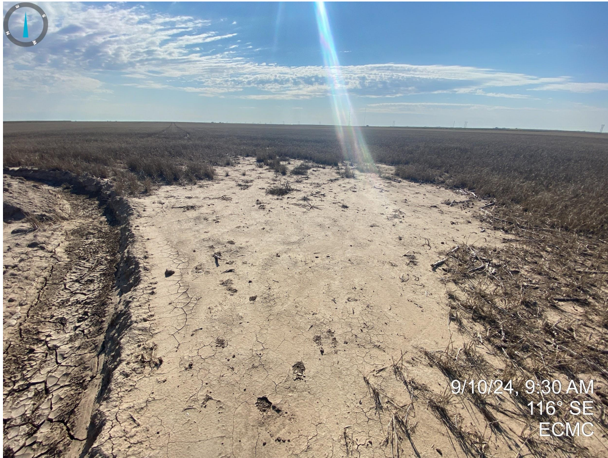
Photo 7. Facing southeast into the impacted area located southeast of the pit. The bare area is failing to vegetate either due to continued sediment deposition, salt kill impacts, or both. Impacted areas require soil sampling and additional reclamation activities.