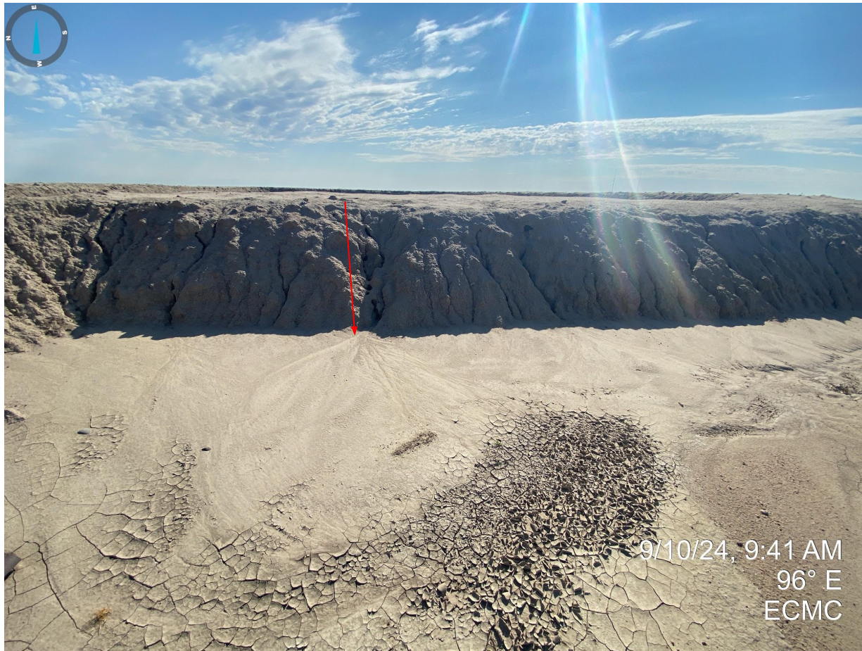
Photo 14. Erosion degradation and unstabilized pit berms on the western portion of the pit