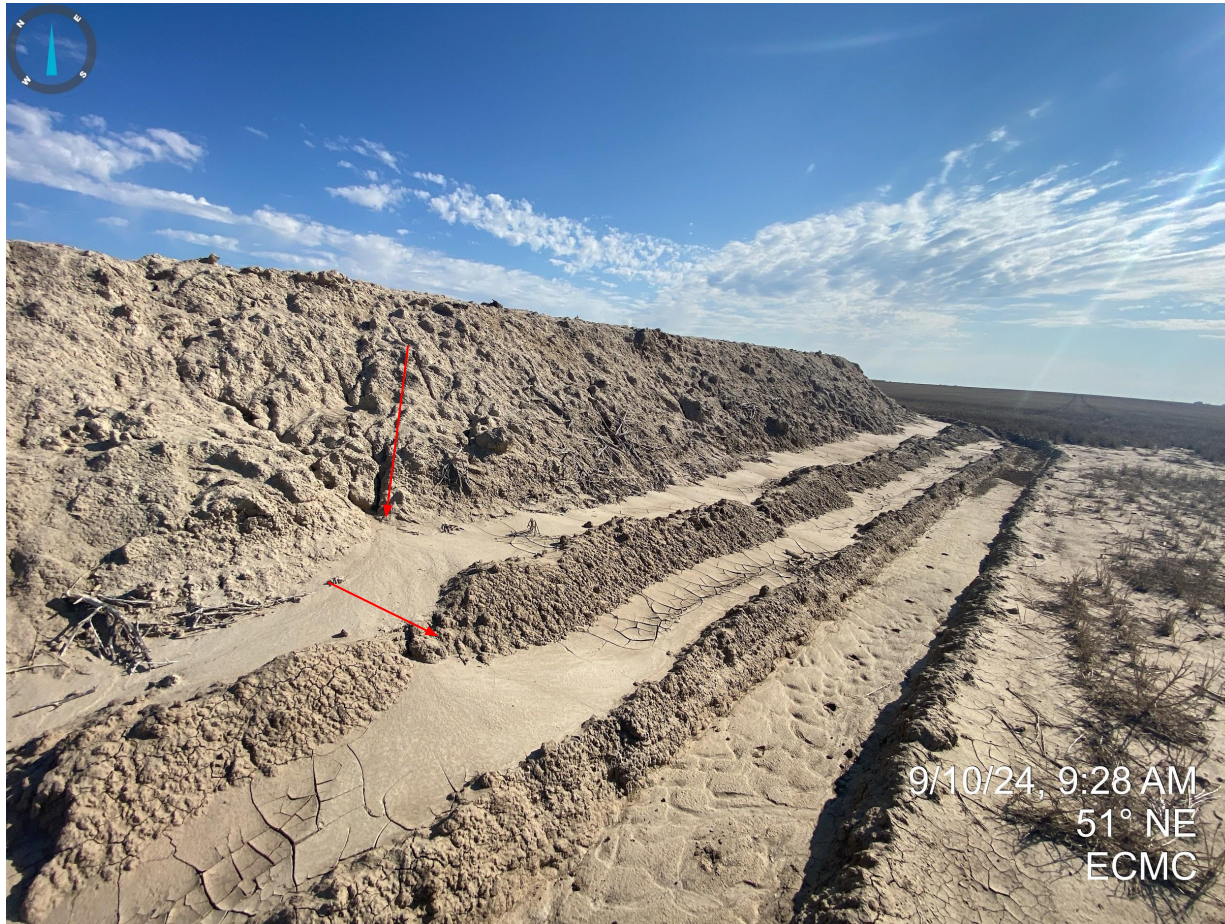
Photo 4. Pit berms do not appear to be properly stabilized with evidence of unconsolidated material and erosion degradation.