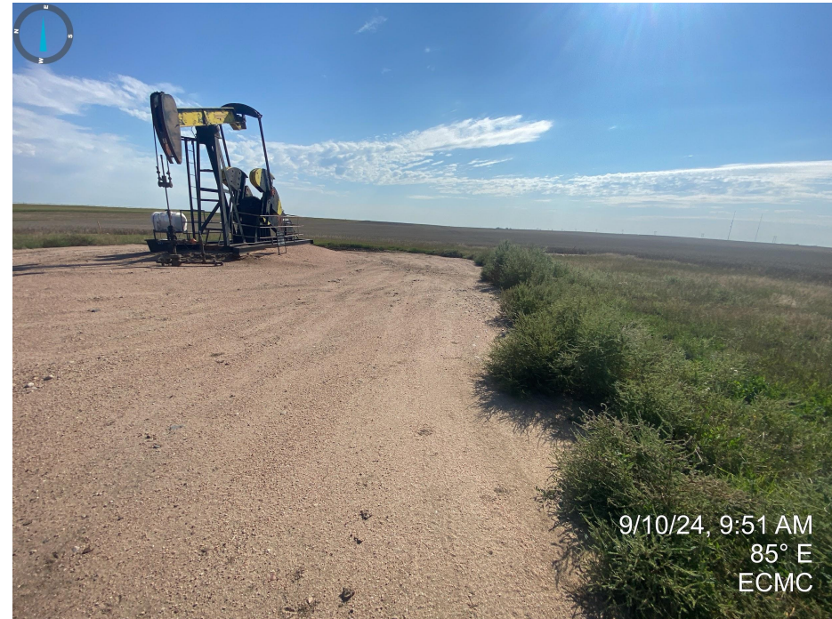
Photos 17 & 18. Undesirable vegetation observed around the well location.