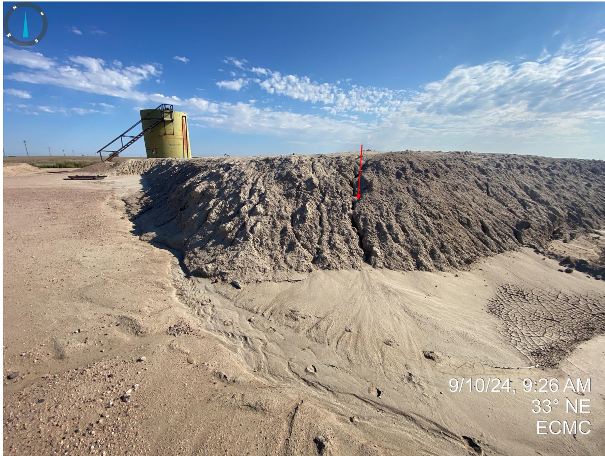
Photo 1. Southwest corner of pit. Evidence of erosion degradation and unstabilized pit berms.