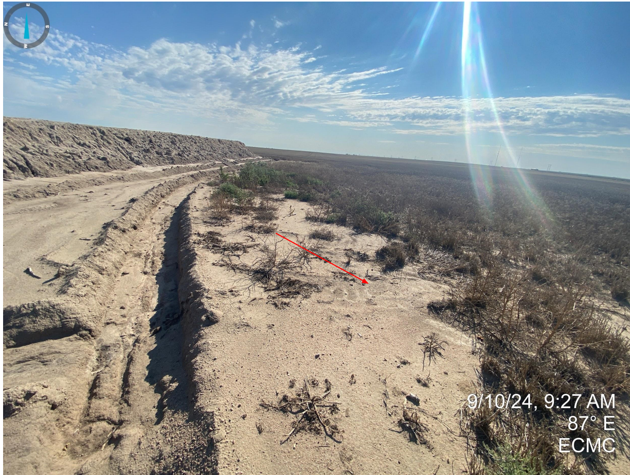
Photo 3. Continued from Photo 2, facing east. Photo illustrates evidence of off location sediment transport and undesirable vegetation.