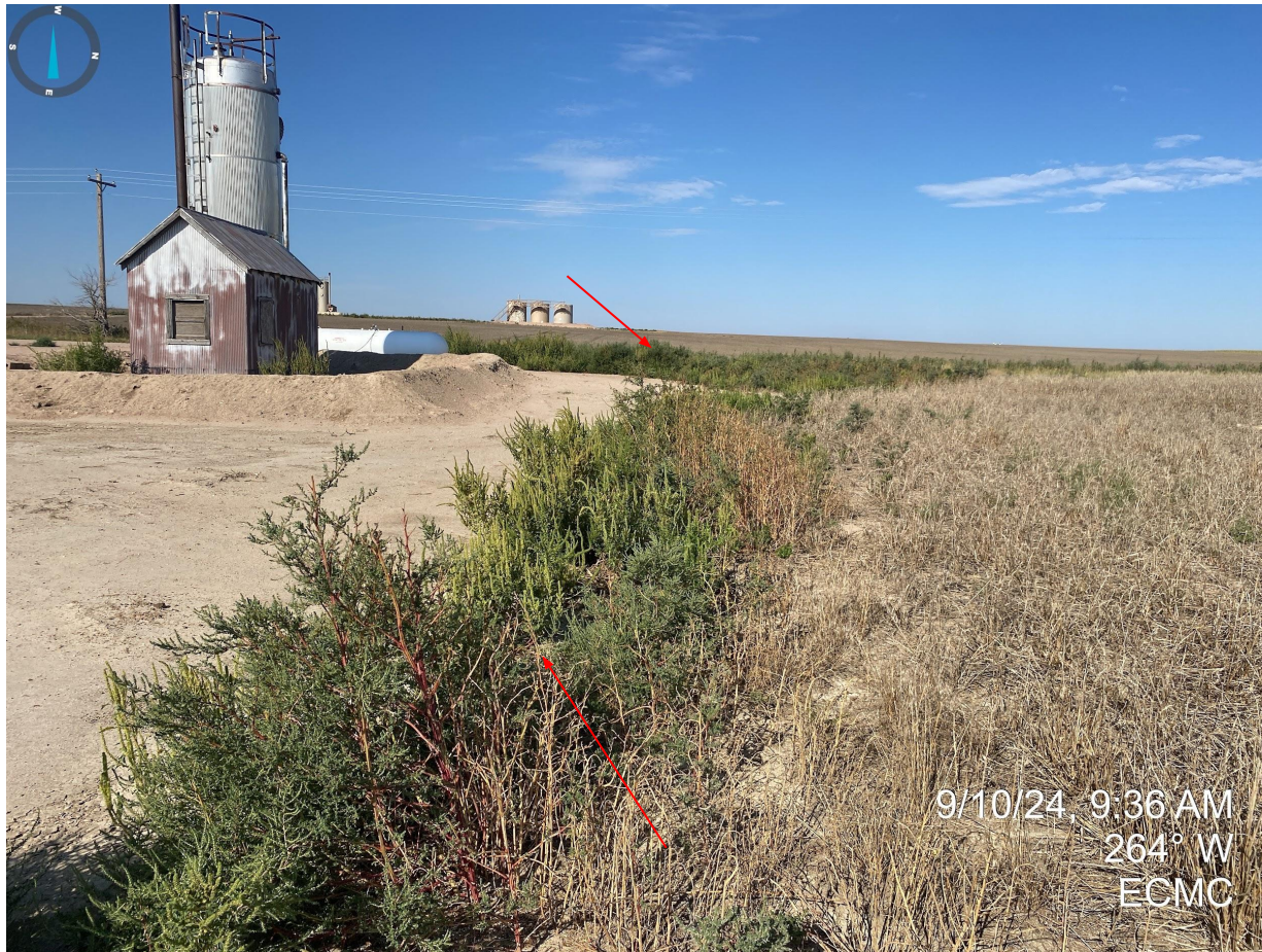
Photo 13. Undesirable vegetation observed throughout the production facilities.