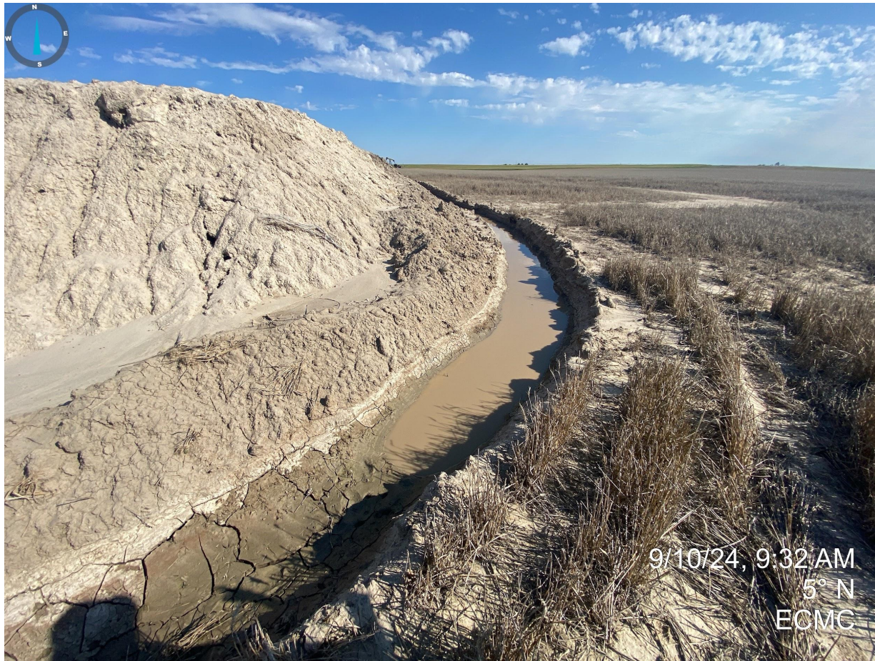
Photo 9. A perimeter ditch has been installed around the southern and eastern side of the pit.