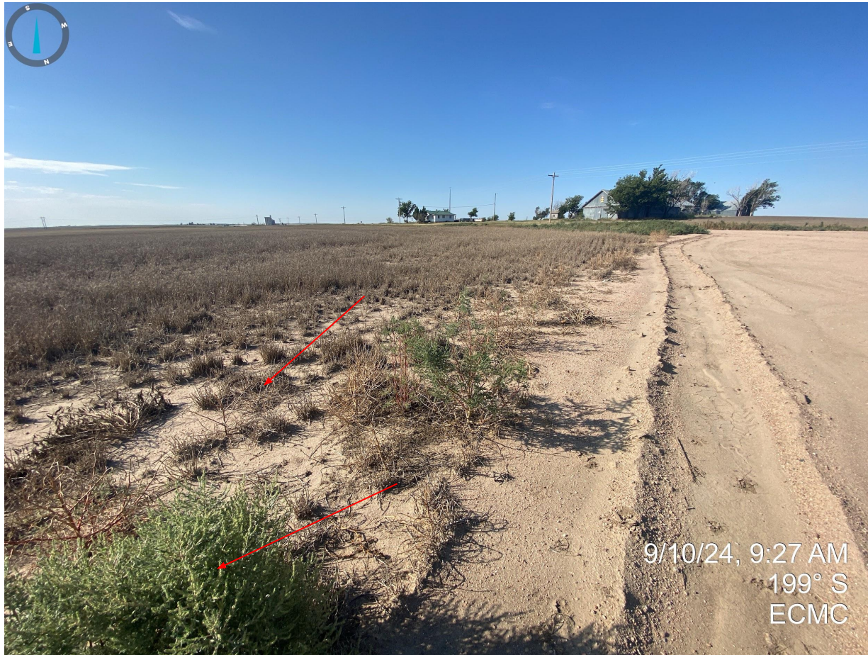
Photo 2. Southern portion of the production facilities, evidence of off location sediment transport and undesirable vegetation.