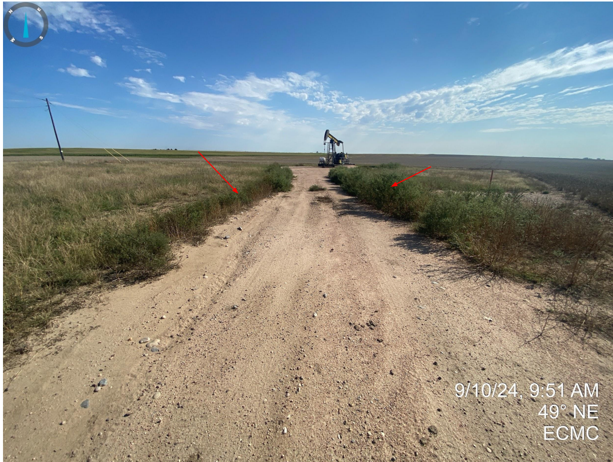
Photo 16. Undesirable vegetation observed along the access road to the well.