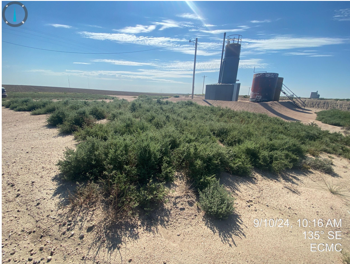
Photo 5. Undesirable vegetation (e.g. kochia and russian thistle) observed at tank battery.