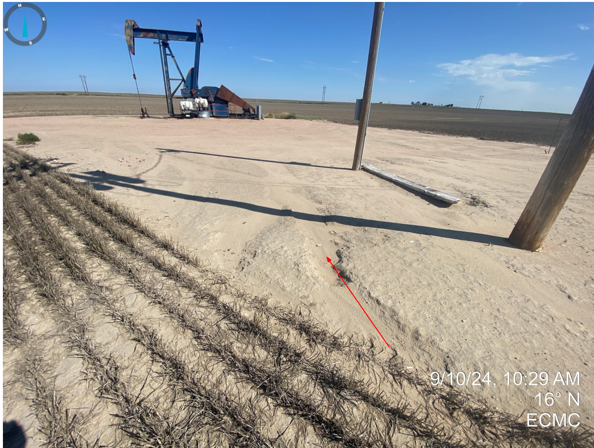
Photo 18. Erosion degradation at well API 121-10211, south side of location.