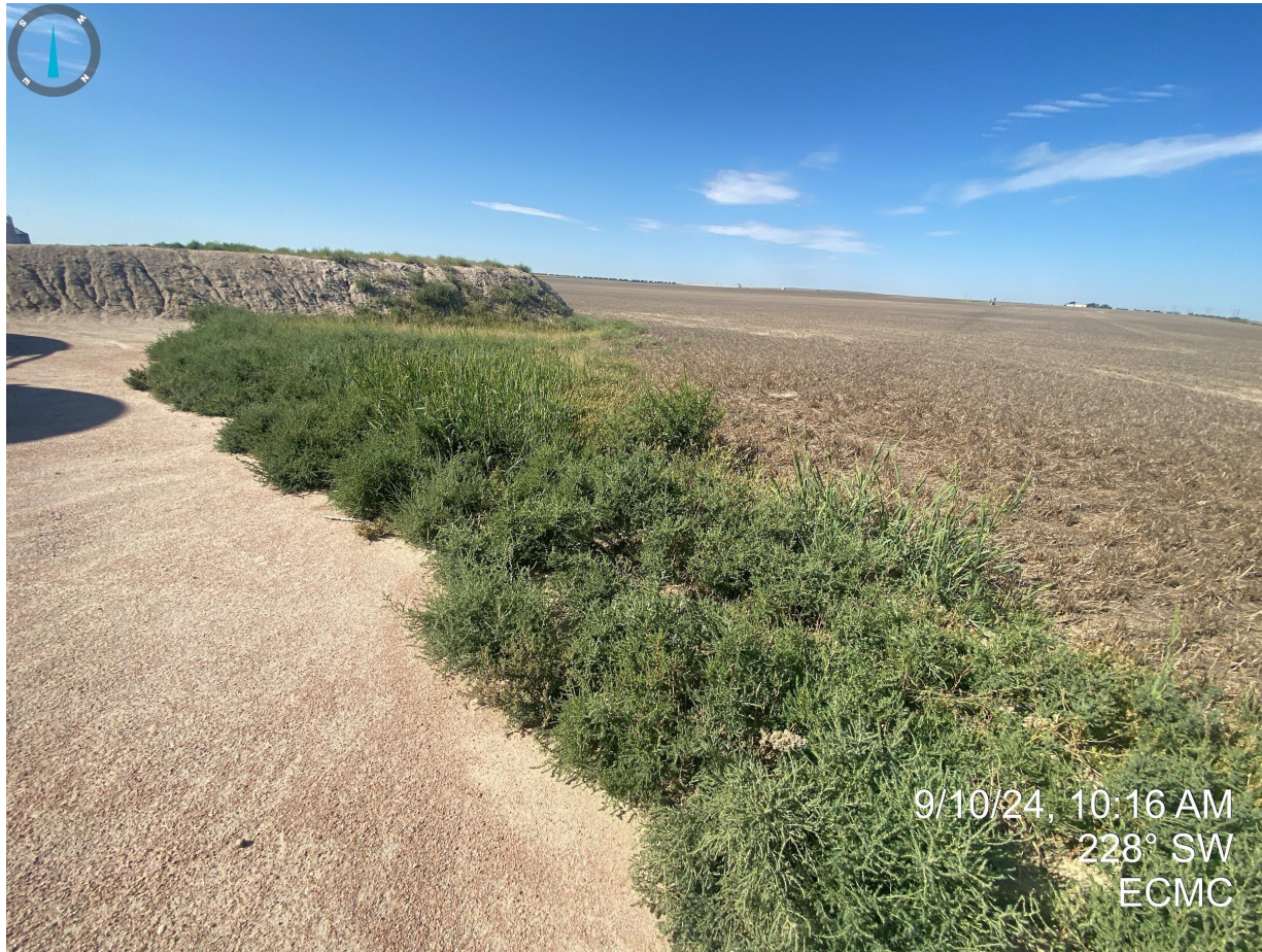
Photo 10. Undesirable vegetation observed north of pit.