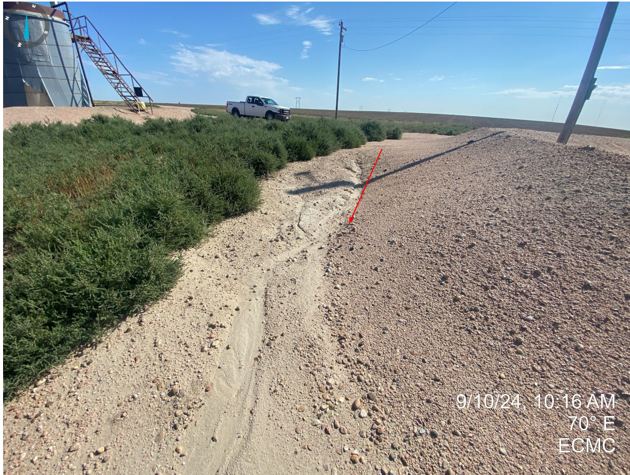
Photo 9. Continued from Photo 8, photo illustrates rill erosion.