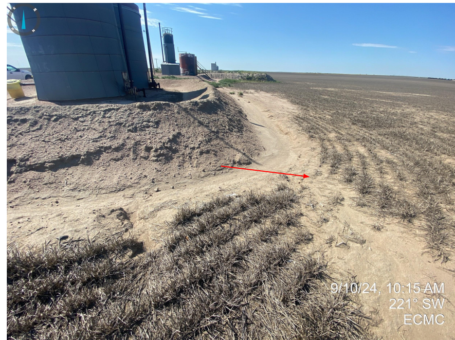
Photos 2 & 3. Erosion degradation north of tank battery (left photo) and sediment discharge into adjacent field (right). No apparent perimeter stormwater controls observed.