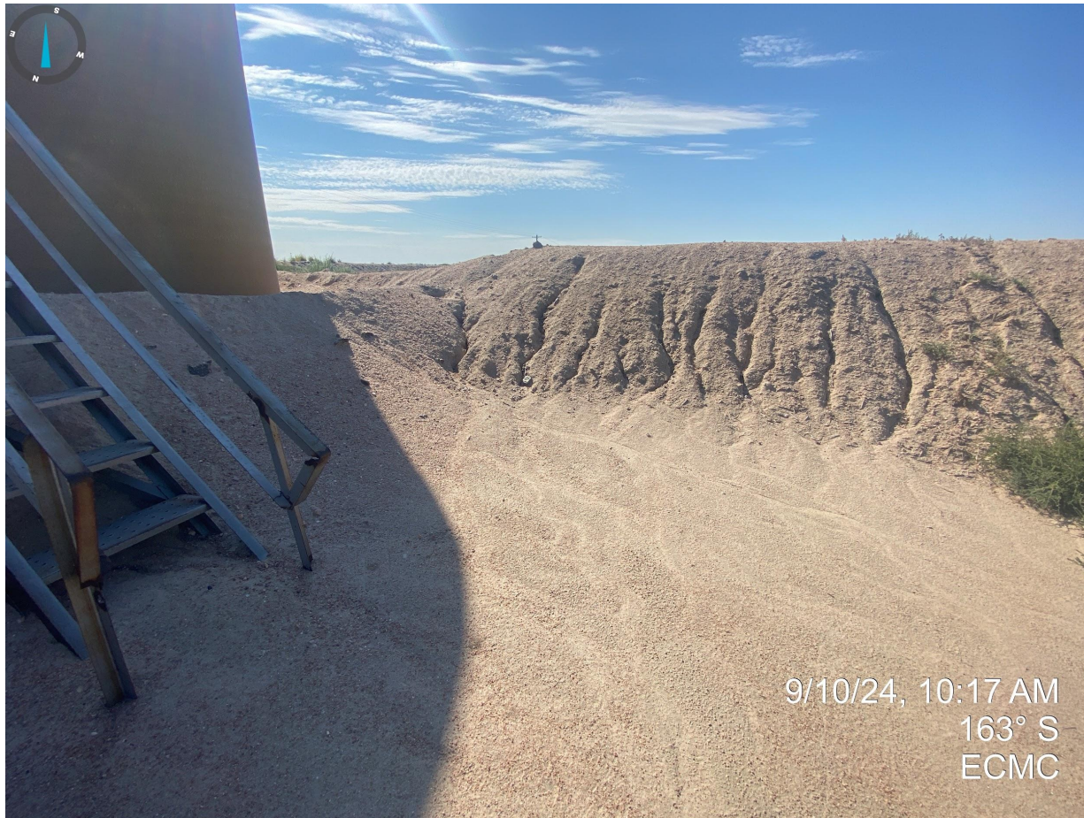
Photo 11. Erosion degradation on pit berms.