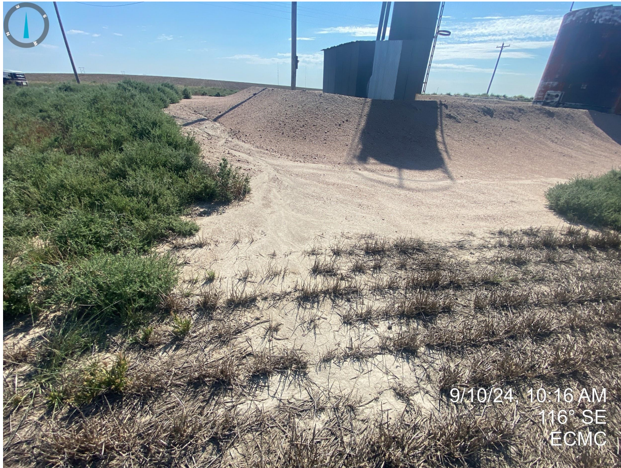
Photo 8. Erosion degradation and sediment discharge observed west of separator. No perimeter stormwater controls observed.