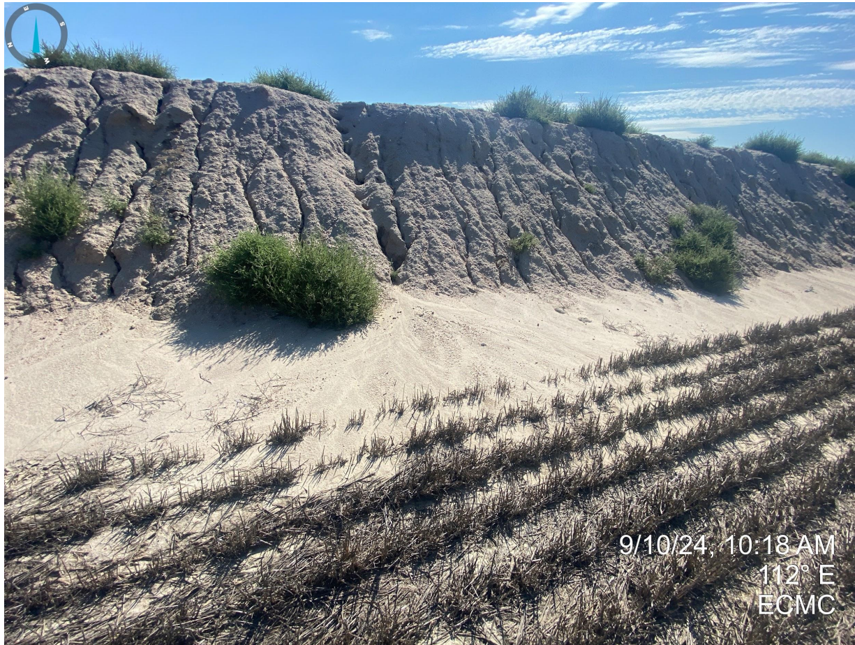
Photo 13. Western pit berm; evidence of sediment transport and erosion degradation. No apparent perimeter stormwater controls observed.