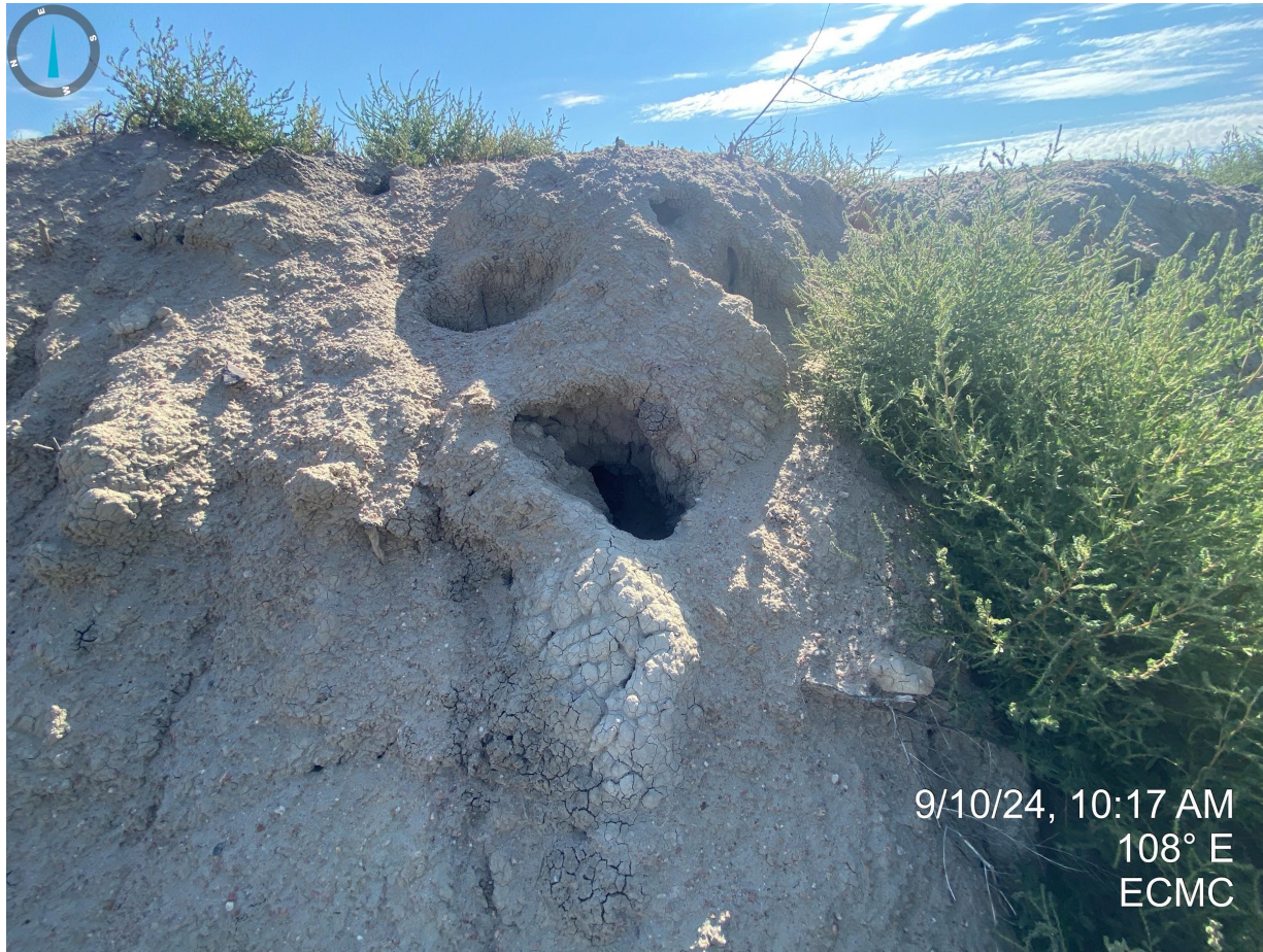
Photo 12. Close up of void in pit berm, illustrating unconsolidated material.