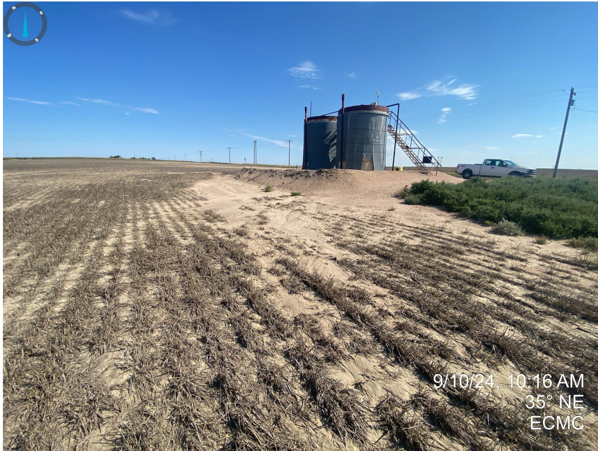
Photo 7. Continued from Photo 6, facing northeast.