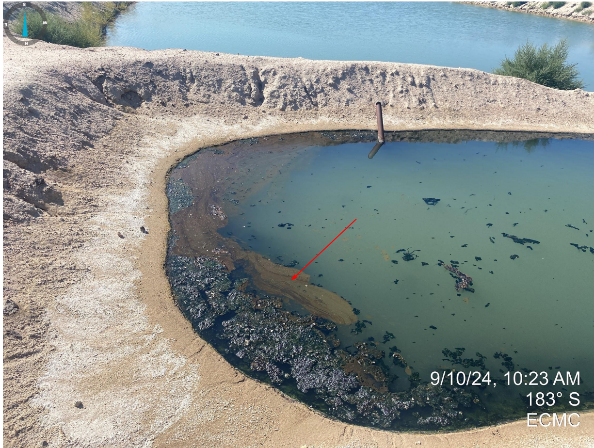
Photo 16. Visible hydrocarbon at pit.