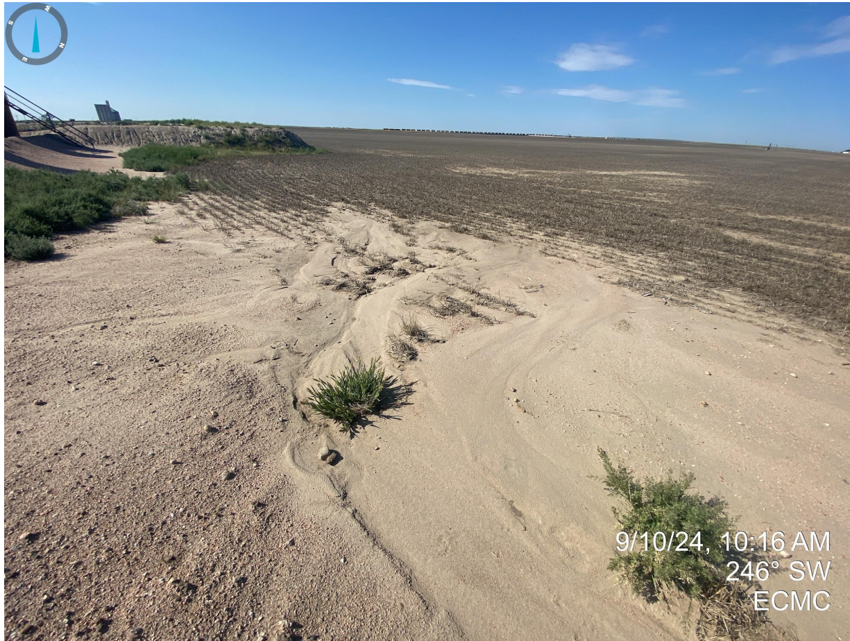
Photo 6. Erosion degradation and sediment discharge observed on the southwest corner of tank battery. No perimeter stormwater controls observed.