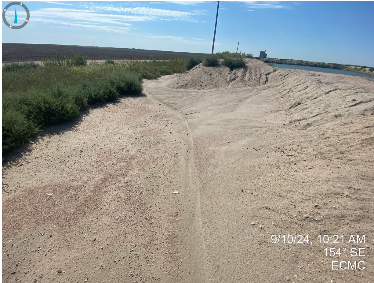
Photo 15. Erosion degradation on northeast corner of pits.