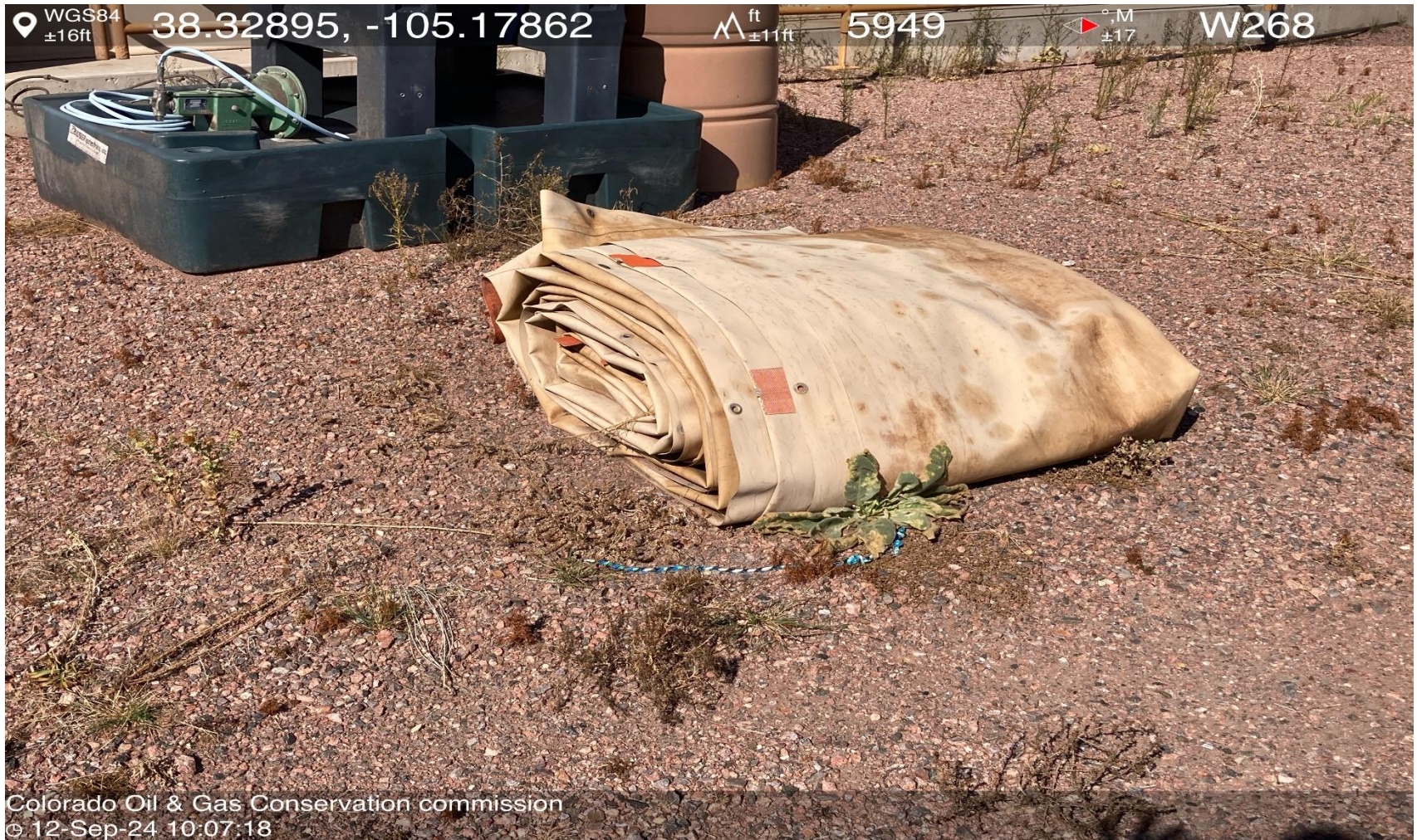
PHOTO 10: UNUSED EQUIPMENT STORED ON LOCATION (CANVAS TARP). REMOVE ALL UNUSED EQUIPEMENT FROM LOCATION PER RULE 606. CA DATE 9-18-2024.