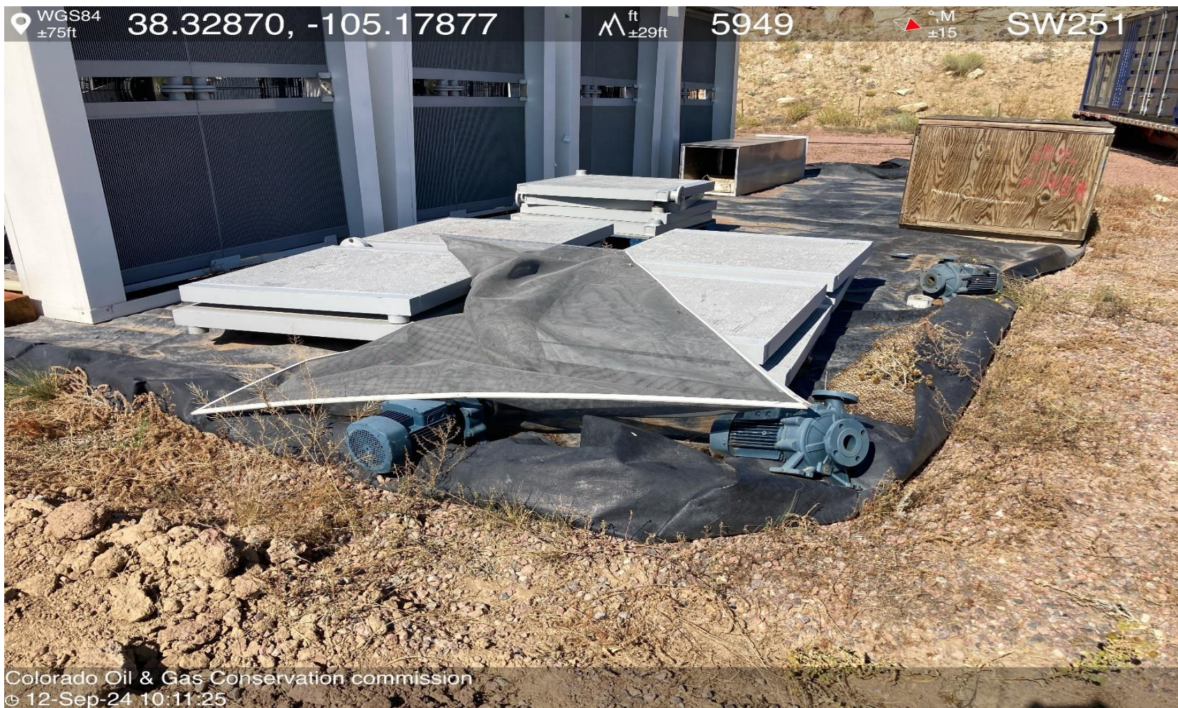
PHOTO 9: TRASH, SOME KIND OF SCREEN IS DAMAGED. REMOVE ALL TRASH FROM LOCATION PER RULE 606. CA DATE 9-18-2024.