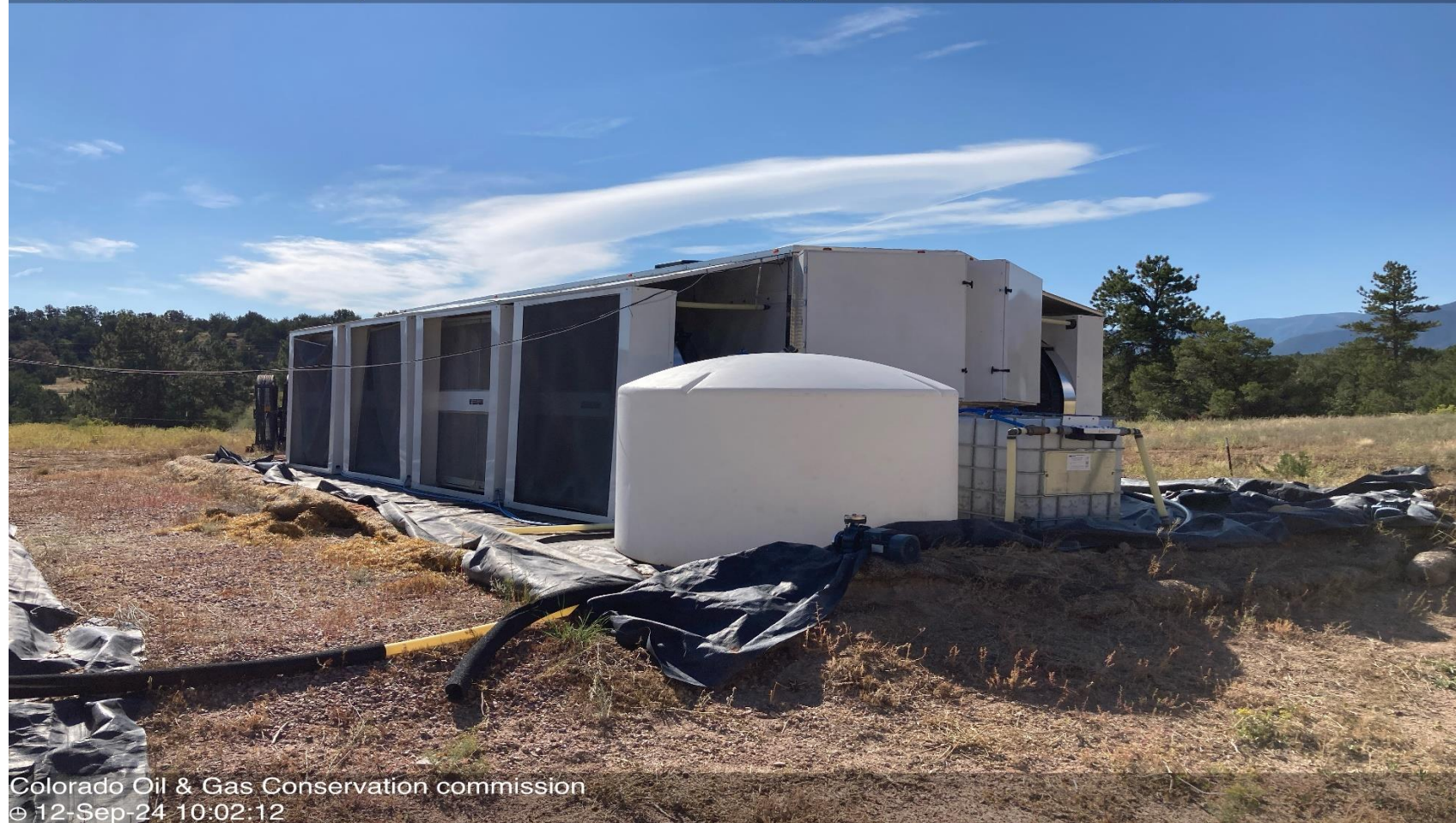
PHOTO 20: UNUSED EQUIPMENT STORD ON LOCATION (MINING COOLER UNITS AND TANKS). REMOVE UNUSED EQUIPMENT PER RULE 606. CA DATE 12/12/2024.

WGS84 \pm 16\text{ft} 38.32857, -105.17911 \Delta^{\text{ft}}_{\pm 10\text{ft}} 5962 \triangle^{\circ, \text{M}}_{\pm 16} SE133