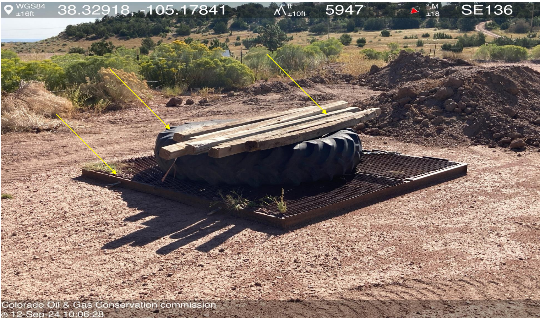
PHOTO 15: UNUSED EQUIPMENT STORED ON LOCATION (TRACKOR TIRE, WOOD AND APPEARS TO BE DECK OFF OF A WORKOVER RIG). REMOVE ALL UNUSED EQUIPEMENT FROM LOCATION PER RULE 606. CA DATE 9-18-2024.