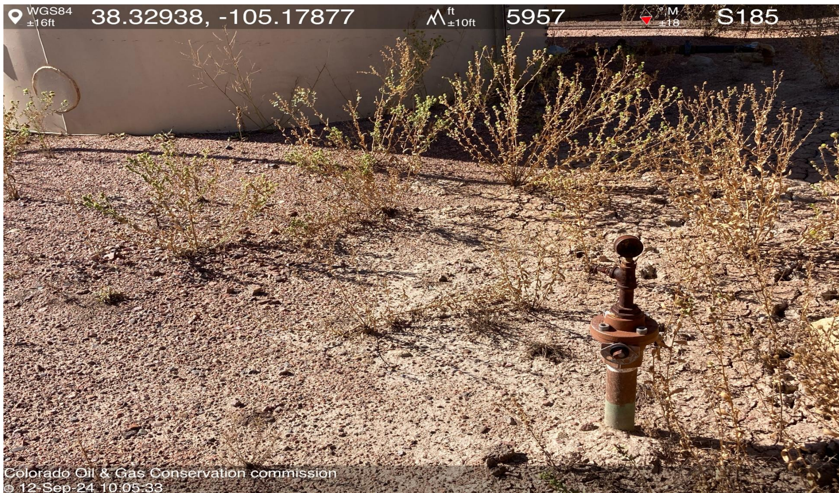
PHOTO 24: UNUSED EQUIPMENT ( UNUSED RISER NEAR CRUDE OIL TANKS). REMOVE OR MARK UNUSED RISERS PER RULE 606. CA DATE 10-12-2024.