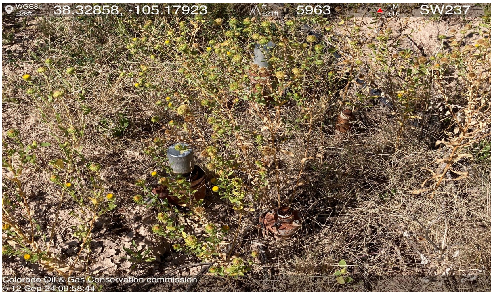
PHOTO 23: UNUSED EQUIPMENT ( UNUSED RISERS BY ECD'S). REMOVE OR MARK UNUSED RISERS PER RULE 606. CA DATE 10-12-2024.