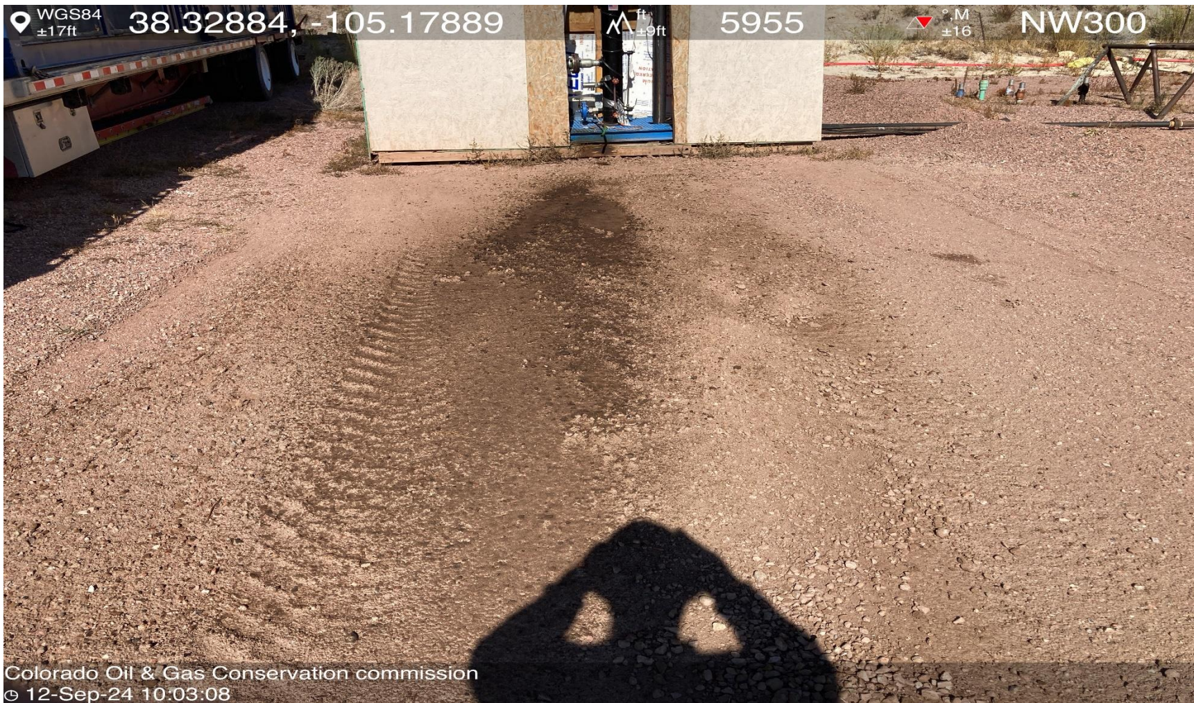
PHOTO 26: AREA OF IMPACTED SOIL APPEARS TO BE OILY WASTE FROM DRAINING SEPARATOR ON GROUND. REMOVE IMPACTED SOIL AND DISPOSE OF PROPERLY, INCREASE Self-inspection, maintenance, and good housekeeping procedures and schedules. CA DATE 10/12/2024