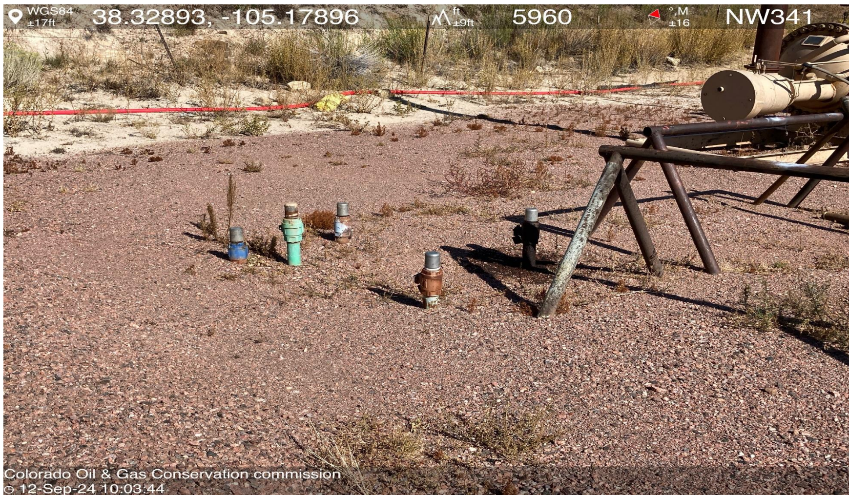
PHOTO 24: UNUSED EQUIPMENT ( UNUSED RISER NEAR HEATED SEPARATOR). REMOVE OR MARK UNUSED RISERS PER RULE 606. CA DATE 10-12-2024.