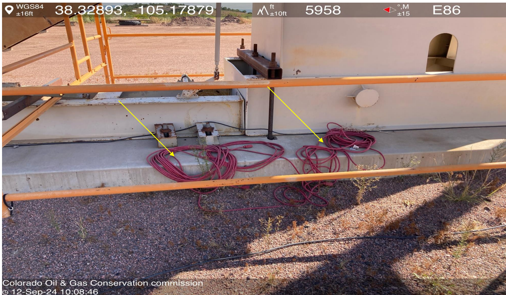
PHOTO 11: UNUSED EQUIPMENT STORED ON LOCATION (POWER CORD). REMOVE ALL UNUSED EQUIPEMENT FROM LOCATION PER RULE 606. CA DATE 9-18-2024.