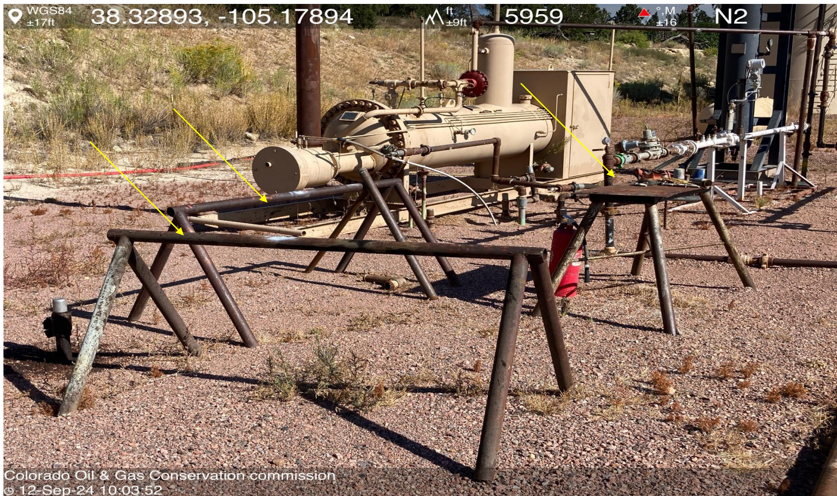
PHOTO 14: UNUSED EQUIPMENT STORED ON LOCATION (WORK BENCH AND SAW HORSES). REMOVE ALL UNUSED EQUIPEMENT FROM LOCATION PER RULE 606. CA DATE 9-18-2024.