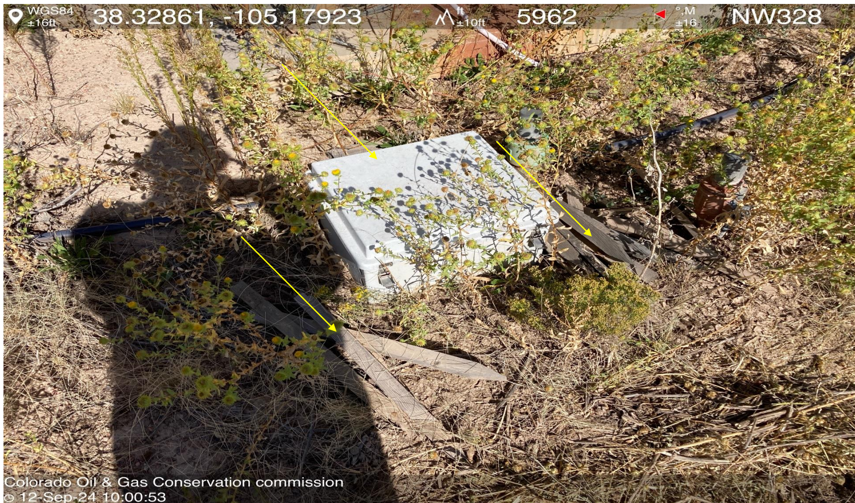
PHOTO 12: UNUSED EQUIPMENT STORED ON LOCATION (EMPTY FIBERGLASS BOX AND SOME WATTLE STAKES). REMOVE ALL UNUSED EQUIPEMENT FROM LOCATION PER RULE 606. CA DATE 9-18-2024.