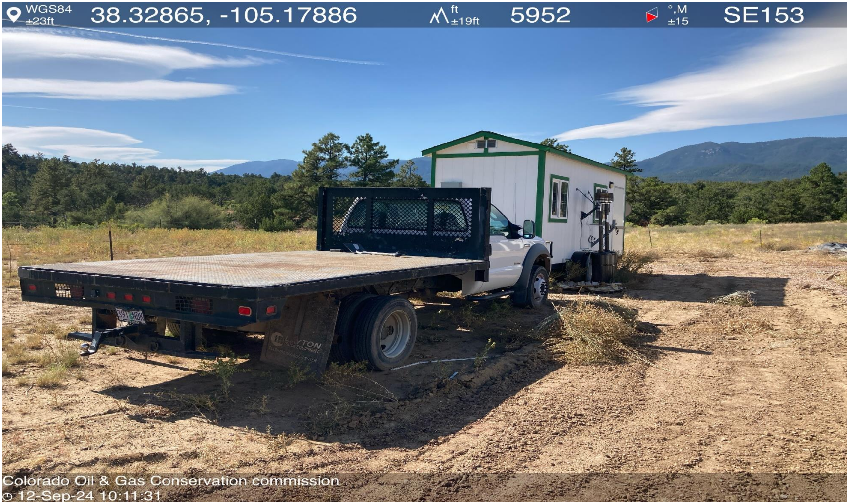
PHOTO 19: UNUSED EQUIPMENT STORD ON LOCATION (TRUCK, OFFECE AND HEATERS). REMOVE UNUSED EQUIPMENT PER RULE 606. CA DATE 12/12/2024.