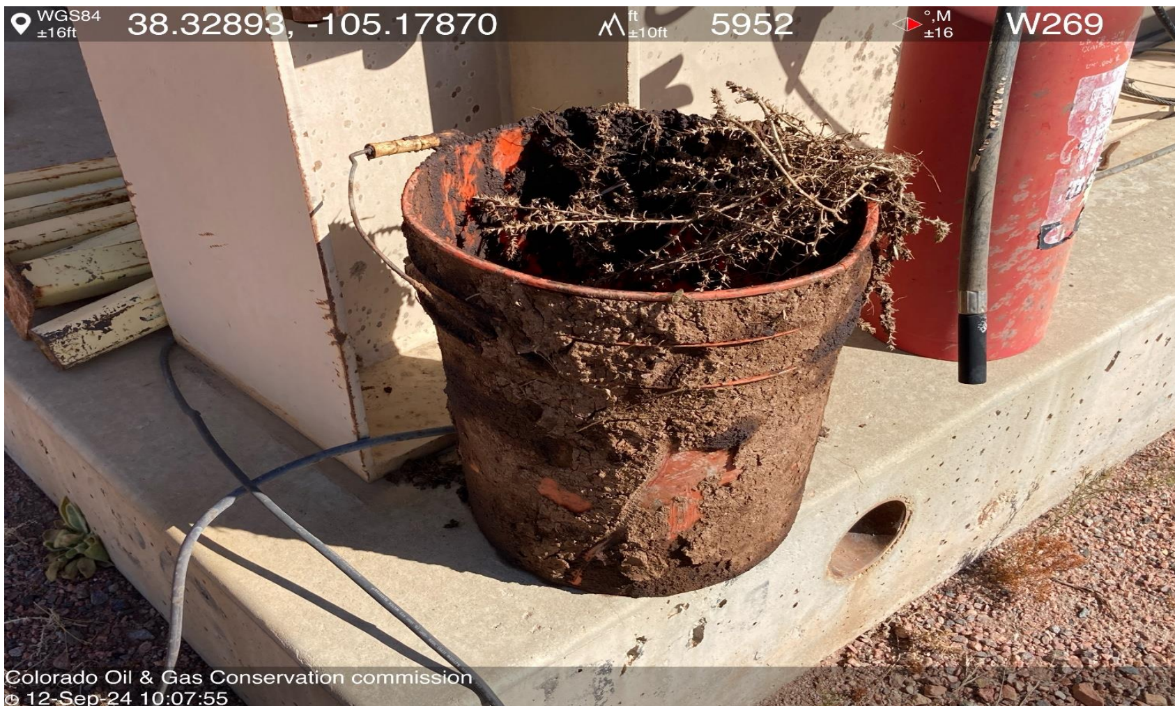
PHOTO 8: TRASH 5 GAL. BUCKETS NEAR WELLHEAD. REMOVE ALL TRASH FROM LOCATION PER RULE 606. CA DATE 9-18-2024.