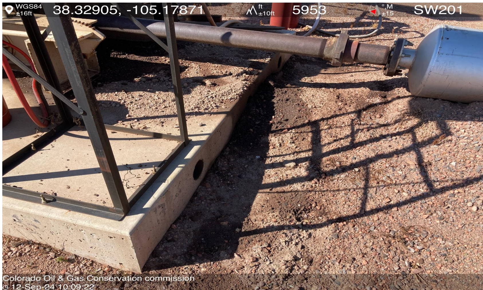
PHOTO 27: AREA OF IMPACTED SOIL NEAR LEAKING PUMPJACK MOTOR OR GEAR BOX. REMOVE IMPACTED SOIL AND DISPOSE OF PROPERLY, INCREASE Self-inspection, maintenance, and good housekeeping procedures and schedules AND REPAIR LEAKING EQUIPMENT. CA DATE 10/12/2024.