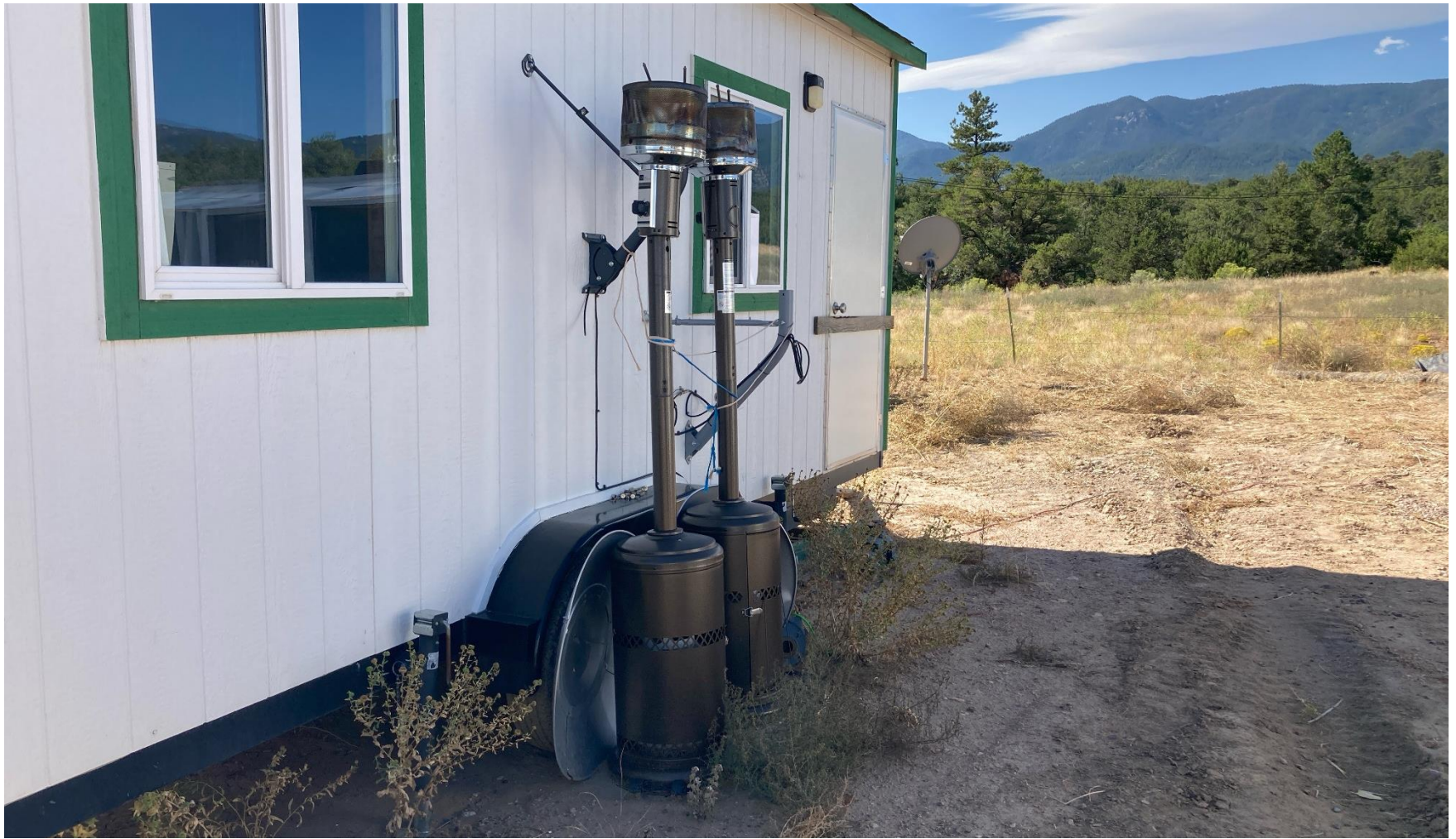
PHOTO 18: UNUSED EQUIPMENT STORD ON LOCATION (OFFECE AND HEATERS). REMOVE UNUSED EQUIPMENT PER RULE 606. CA DATE 12/12/2024.