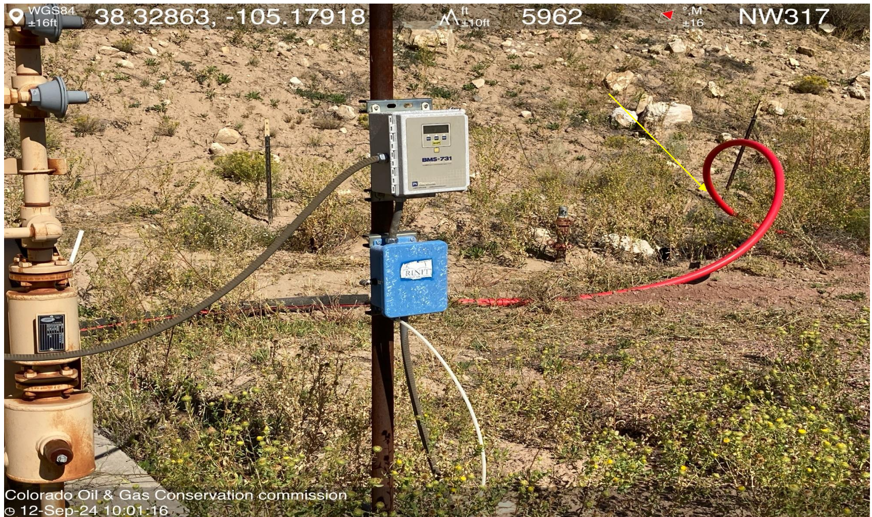
PHOTO 17: UNUSED EQUIPMENT STORED ON LOCATION (ORANGE 2" POLY PIPE CONNECTED TO PRODUCED WATER TANK IS NOT CONNECTED ON SOUTH END). REMOVE ALL UNUSED EQUIPEMENT FROM LOCATION PER RULE 606. CA DATE 12/12/2024.