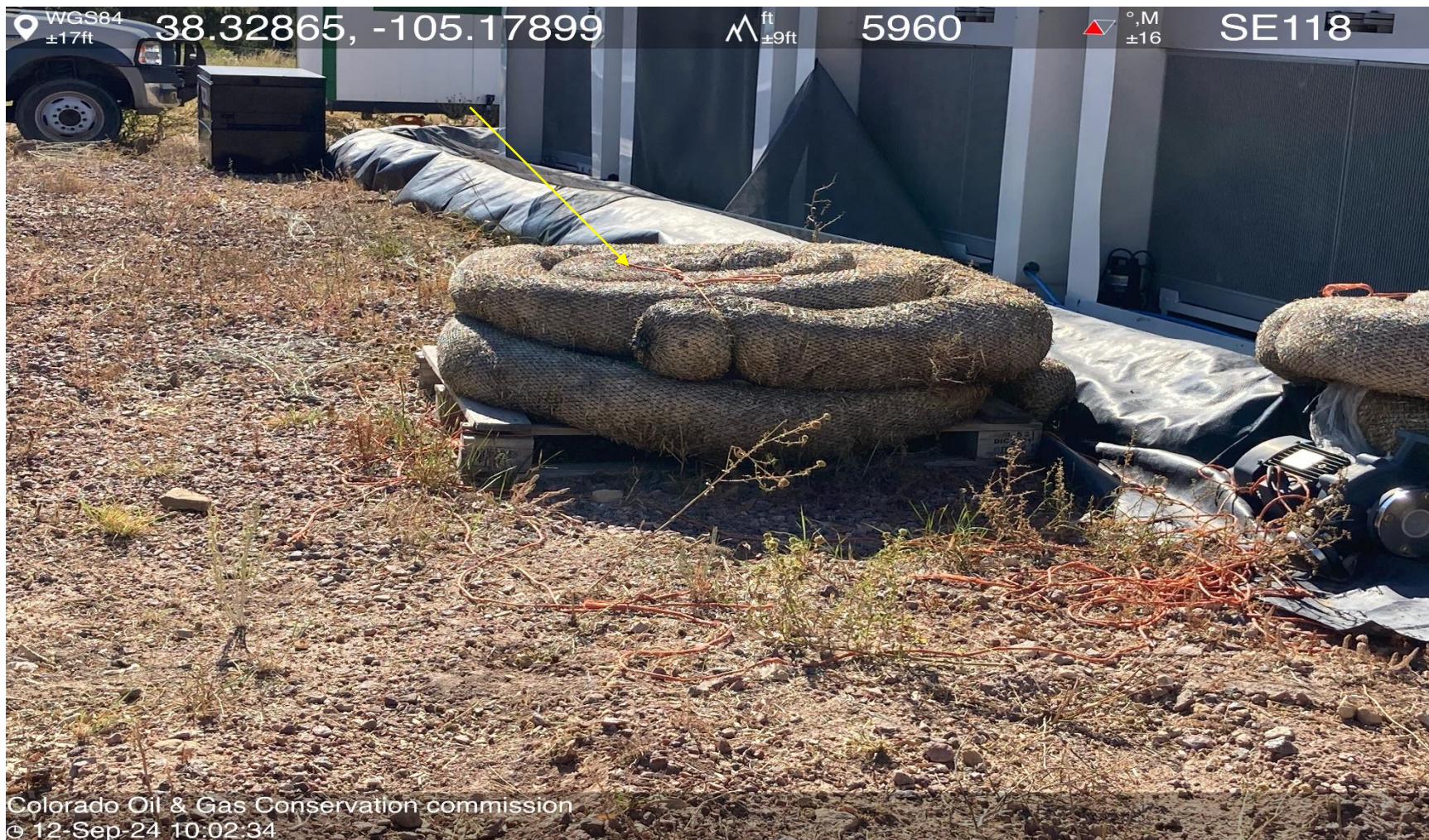
PHOTO 13: UNUSED EQUIPMENT STORED ON LOCATION (PALLET OF WATTLES). REMOVE ALL UNUSED EQUIPEMENT FROM LOCATION PER RULE 606. CA DATE 9-18-2024.