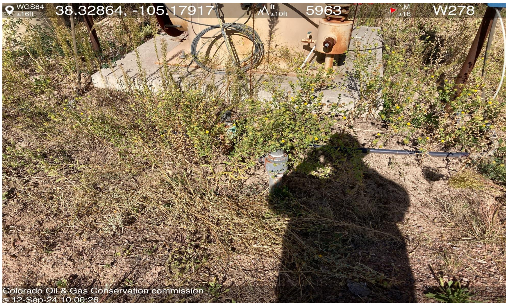
PHOTO 22: UNUSED EQUIPMENT ( UNUSED RISERS BY ECD'S). REMOVE OR MARK UNUSED RISERS PER RULE 606. CA DATE 10-12-2024.