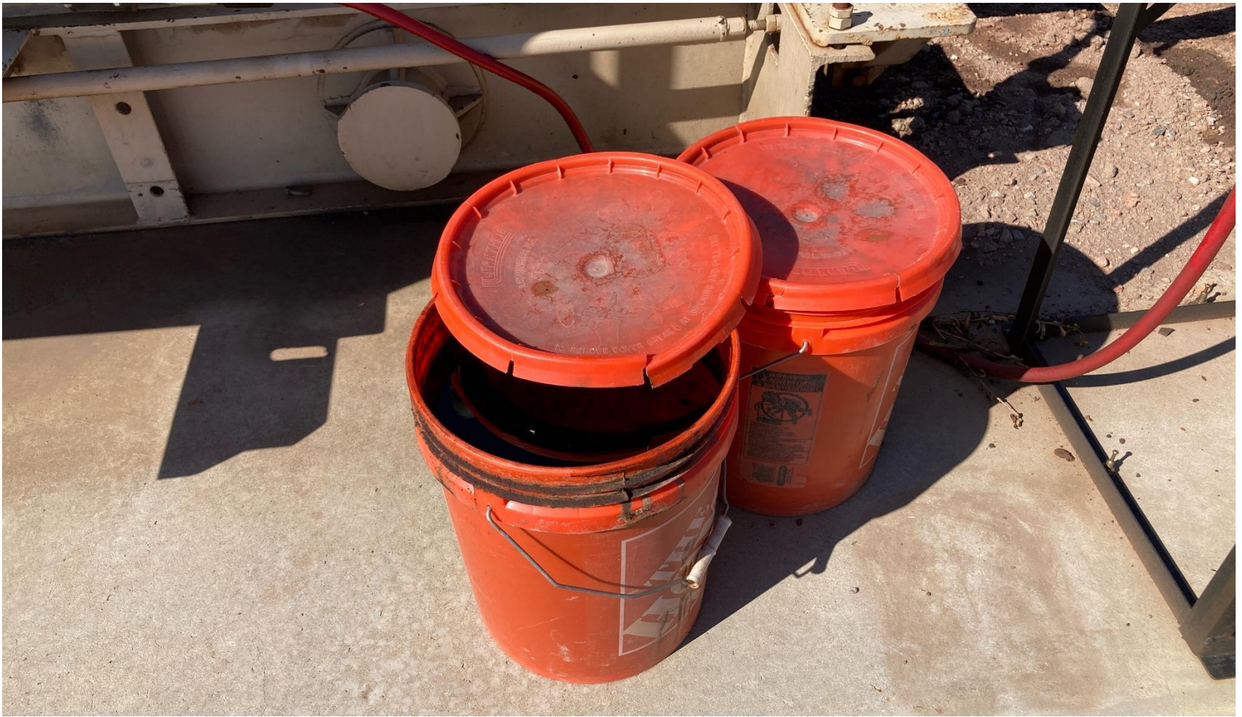
PHOTO 7: TRASH, IT APPEARS TO BE UNED ENGINE OIL IN TWO 5 GAL. BUCKETS NEAR PRIME MOVER. REMOVE ALL TRASH FROM LOCATION PER RULE 606. CA DATE 9-18-2024.