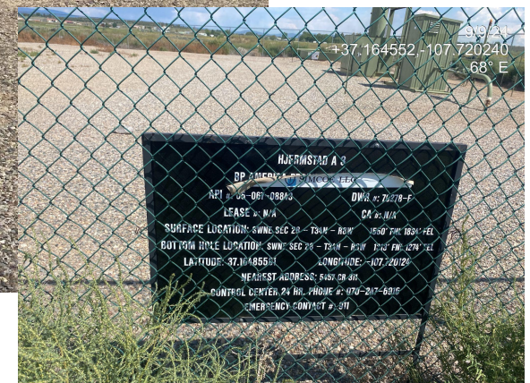
Photo 1. View of the well pad taken from the access point facing center.