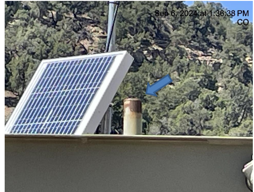
Photo # 9013 Rupture disc vent line does not comply with CECMC pressure safety device rules