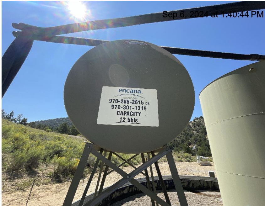
Photo # 9018 Label on methanol tank contains incorrect information/does not comply with CECMC rules