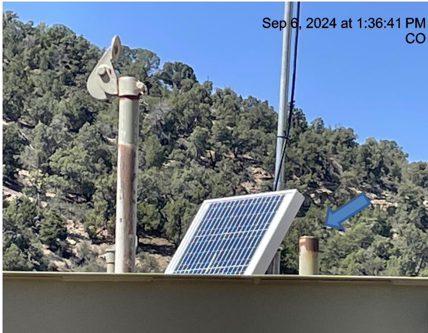
Photo # 9012 Rupture disc vent line does not comply with CECMC pressure safety device rules