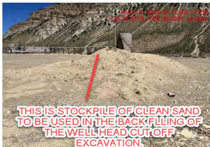
Stockpiled soils with no BMP's - Photo #04747

This is a stockpile of clean sand to be used in the backfilling of the excavation for the 35-AV well 10 and 12 cut off once soil sample lab results are received. See photos above and following: