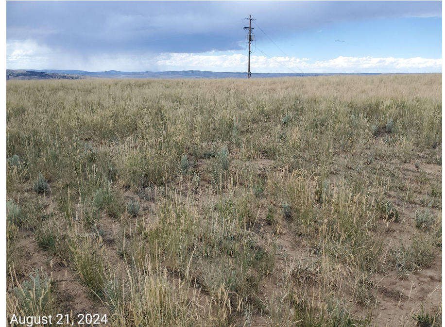
Photo 1: Photos 1-2 taken from the southeast end of the Location. Photos provide an overview of the Location from southwest, northeast, north to northeast.