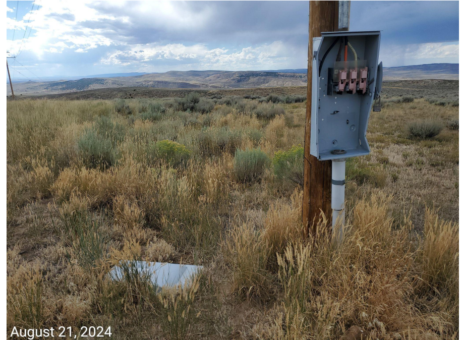
Photo 3: Photos show utility equipment on, and leading to, the Location has not been removed.