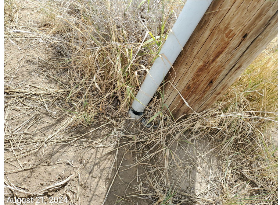
Photo 3: Photos shows Utility equipment on, and leading to, the Location has not been removed; utility equipment has been disconnected.