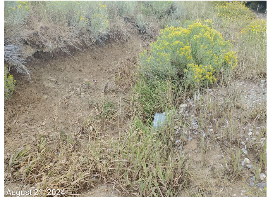
Photo 5: Photos shows the access road to the Location has not been reclaimed. Photo right example of culverts remaining along access road.