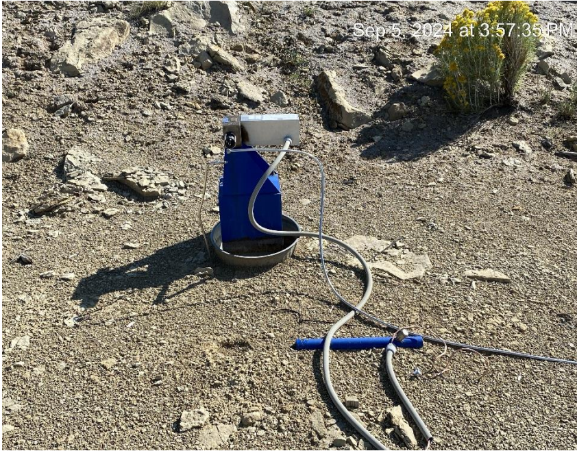
Unused equipment and debris