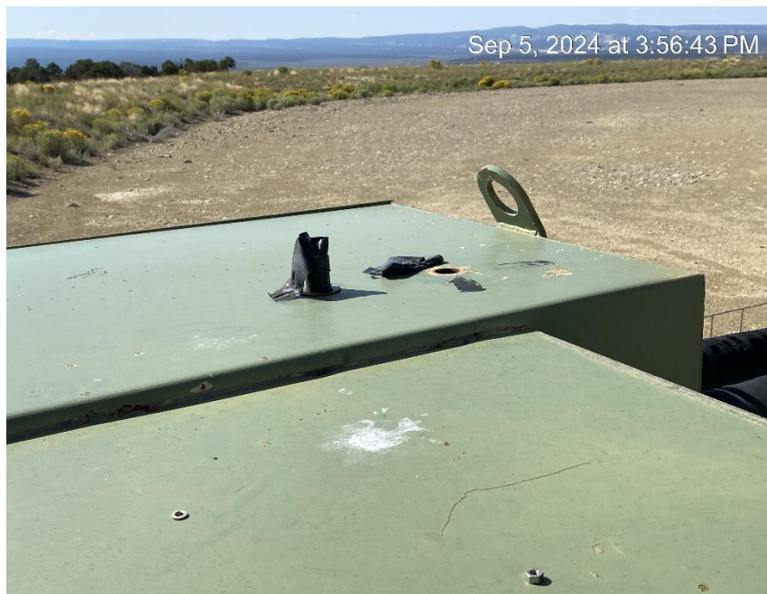
Relief riser missing protective cap