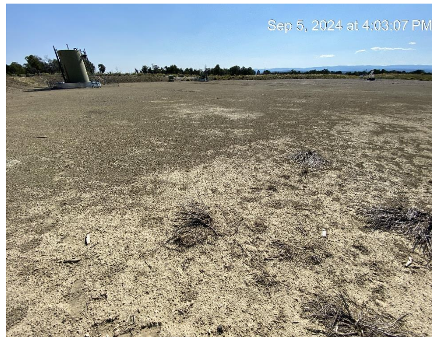
Location from North corner