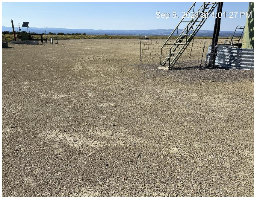
Location from South corner