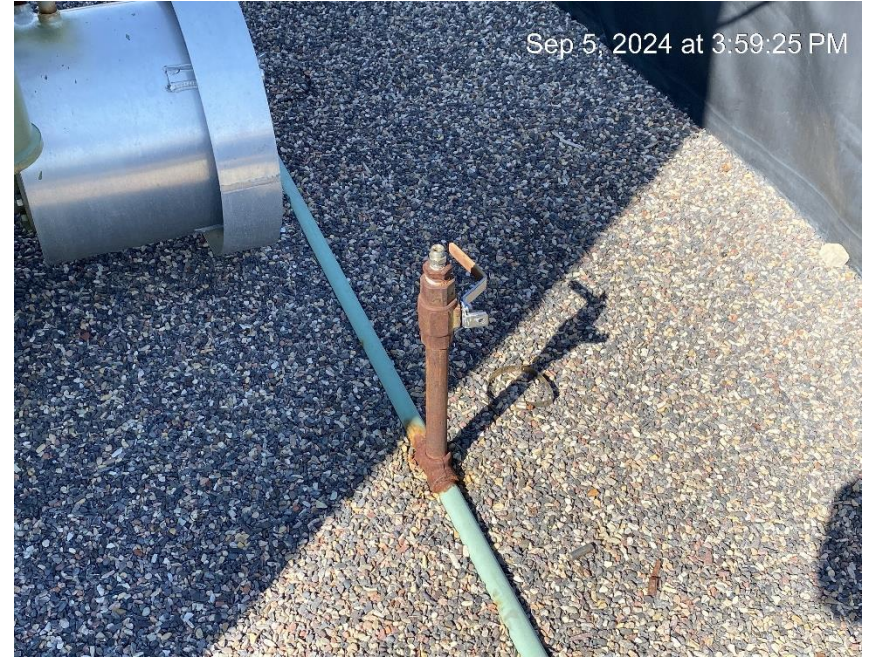
Open end gas line with handle attached creating a hazard