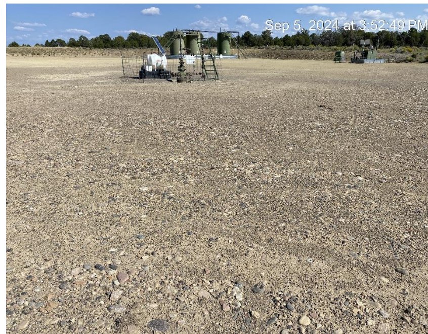
Location from West corner