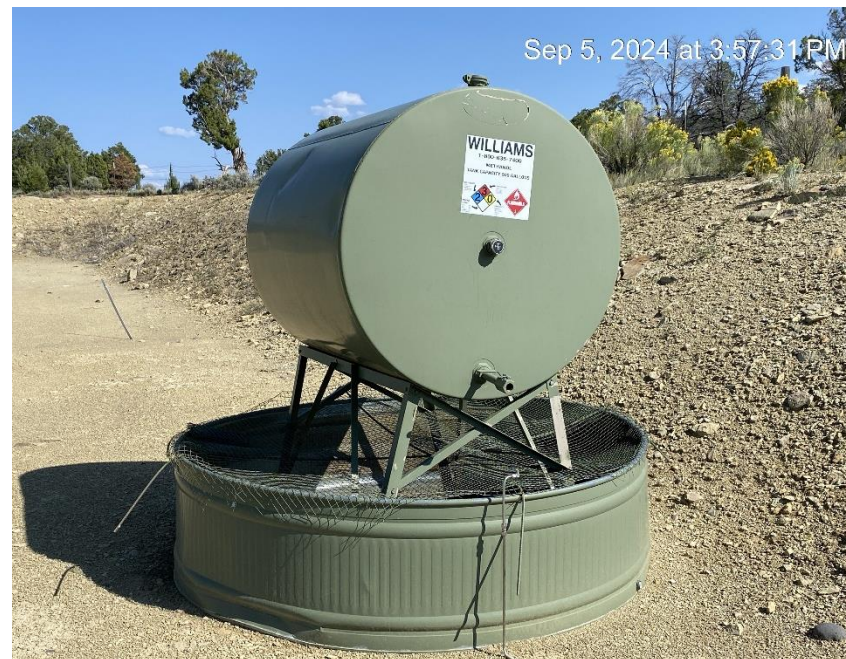
Not in use