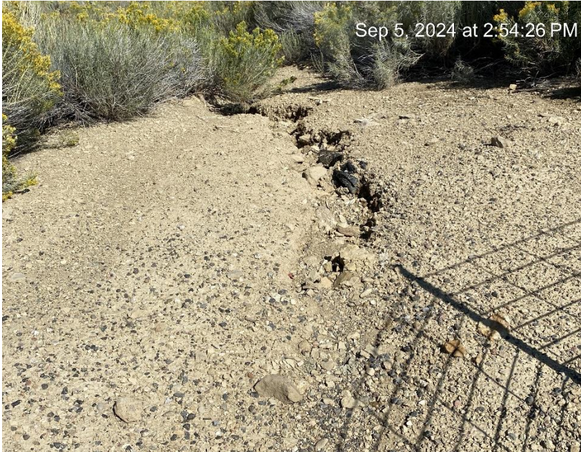
Maintain Stormwater BMPs