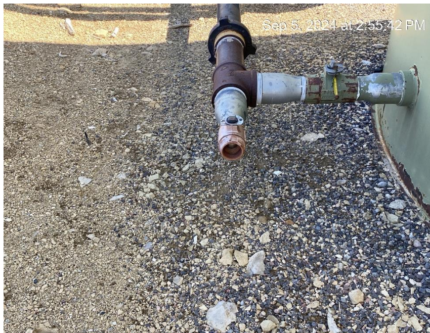
Double valves on both ends of loadline