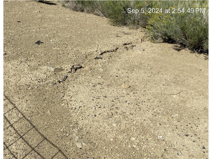
Maintain Stormwater BMPs