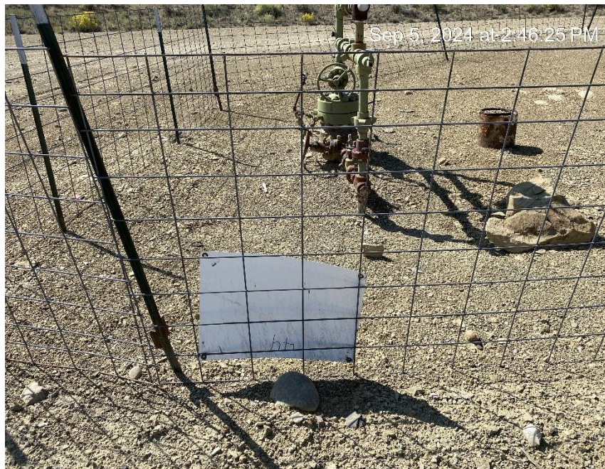
Well sign not displayed