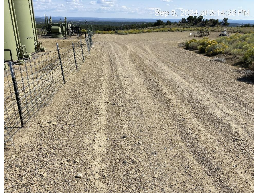
Location from Northwest entrance to location