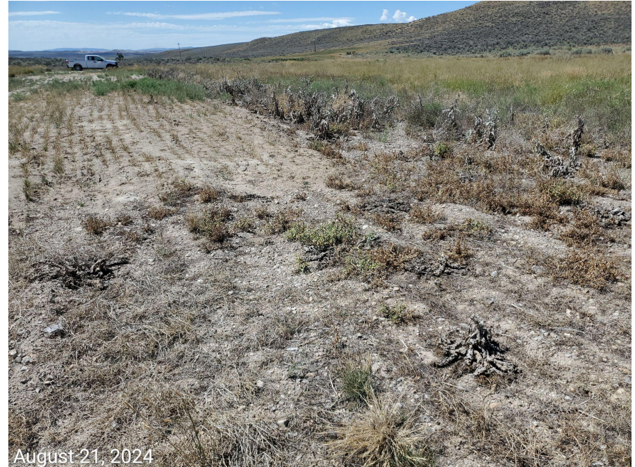
Photo 5: Photos taken from the southeast end of the well site Location, facing south. Access road has not been reclaimed in accordance with 1004 Rules. Operator appears to have pushed/dumped soil over this area of the access road without conducting gravel removal and compaction alleviation activities.