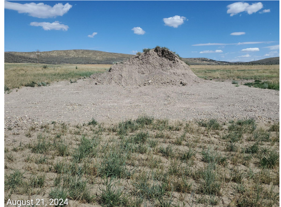
Photo 4: Photos taken from the northwest end of the well site Location, facing northwest and north. Photo shows areas that have not been reclaimed, including an access road, and an areas being used to store stockpiled soils/gravel material.