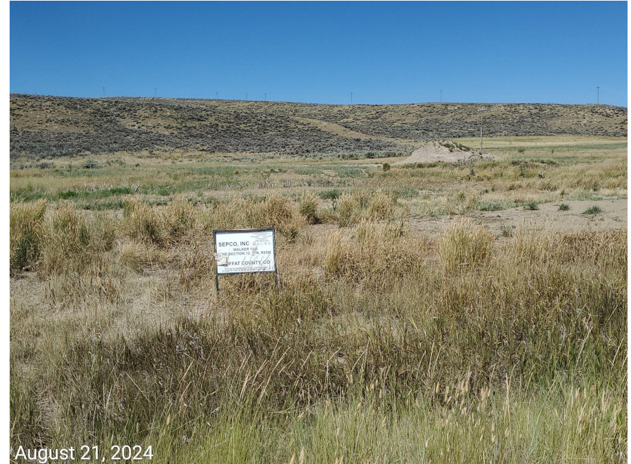
Photo 8: Photo left taken from the southeast end of the Location, facing north. Photo right taken from the east end of the Location, facing west. Photos show signage remaining with incorrect Operator information posted.