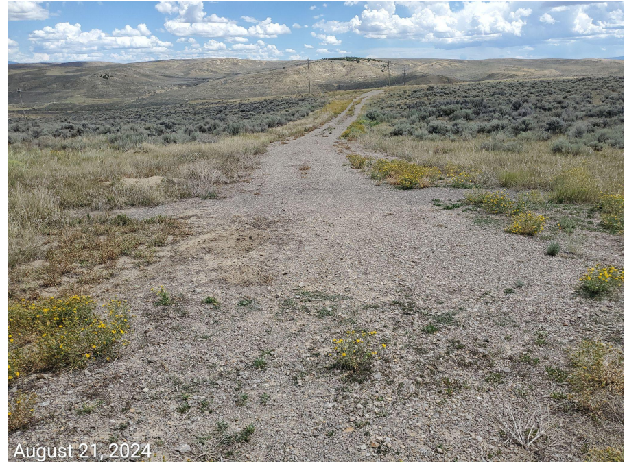
Photo 14: Photo left taken from the west end of the Pit facility Location, facing west. Photo right taken from the access road entrance leading to the Location, facing east. Photos show access road to the Pit Facility Location has not been reclaimed.