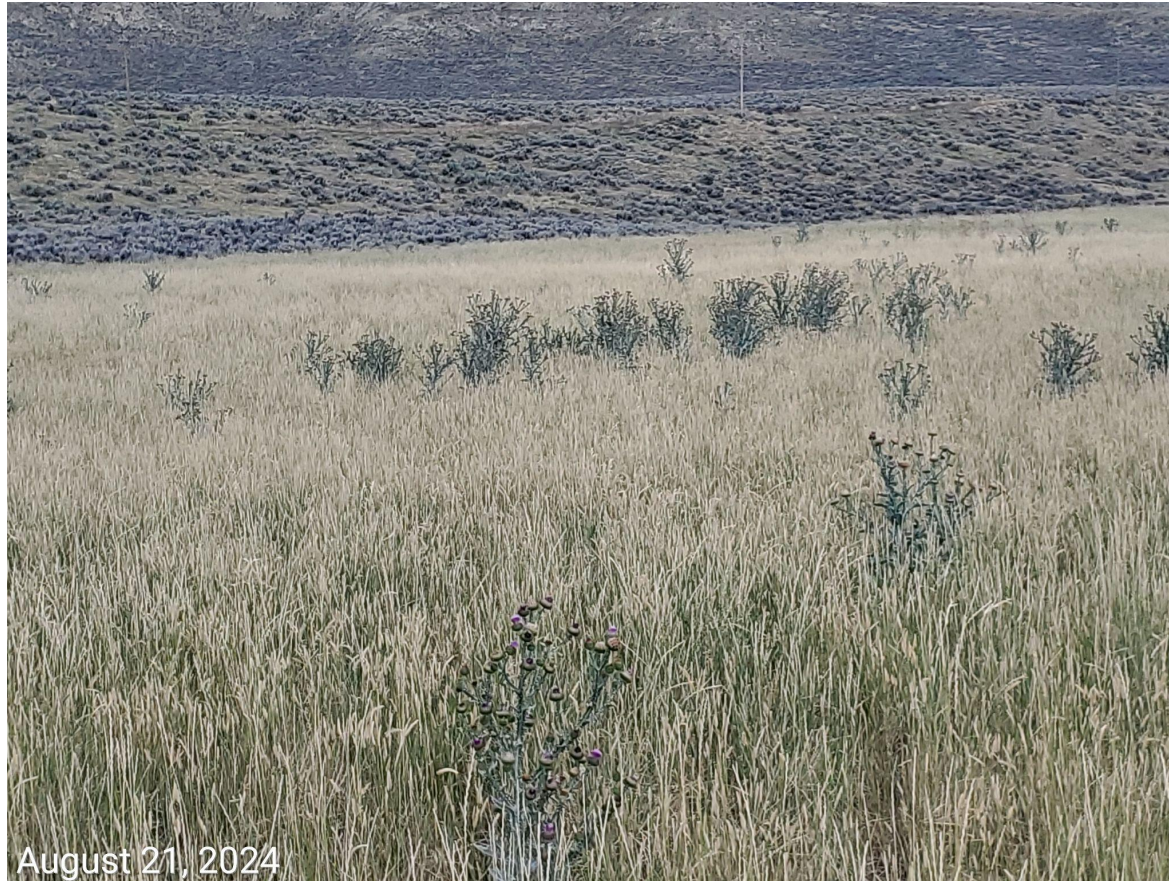
Photo 12: Photos examples showing Noxious weed establishment (Scotch thistle) observed throughout the Pit Facility Location.