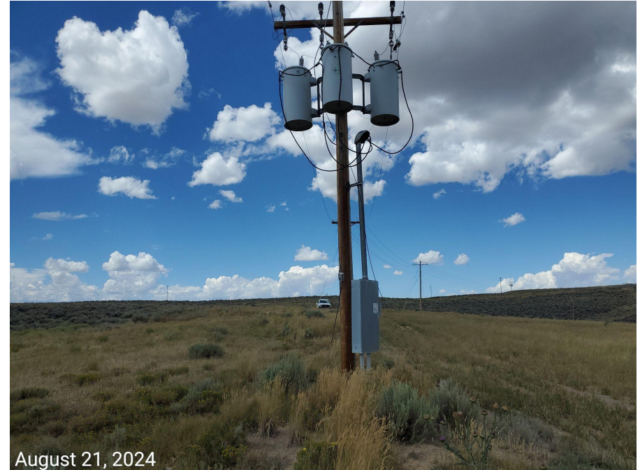
Photo 11: Photos taken from the south end of the Pit Facility Location. Photos show utility equipment on and leading to location has not been removed.