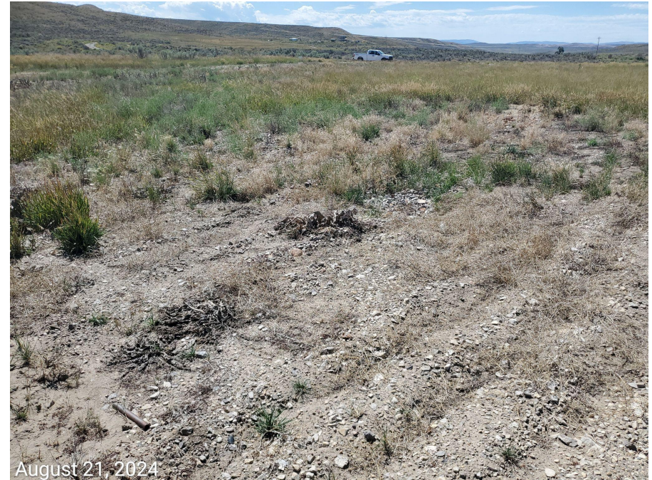
Photo 1: Photos 1-2 taken from the north end of the well site Location. Photos provide an overview from east, southeast, southwest to west. Photos shows Location has not been reclaimed in accordance with 1004 Requirements. Location is predominantly bare, or vegetated by undesirable plant species.