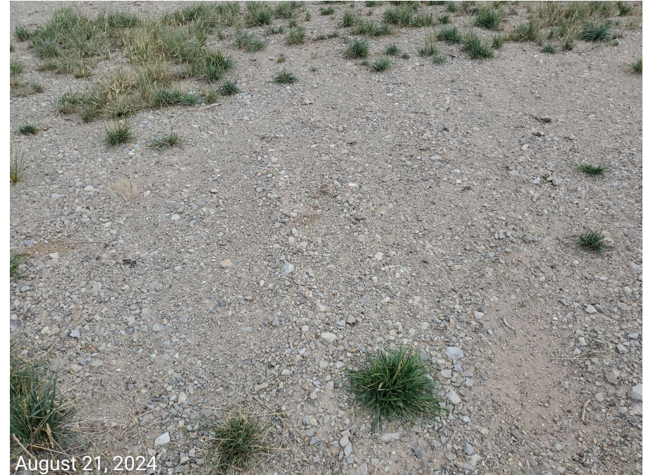
Photo 13: Photo taken from the west end of the Pit Facility Location. Photo example showing areas of the Location that have not been reclaimed in accordance with 1004 Rules and requirements.