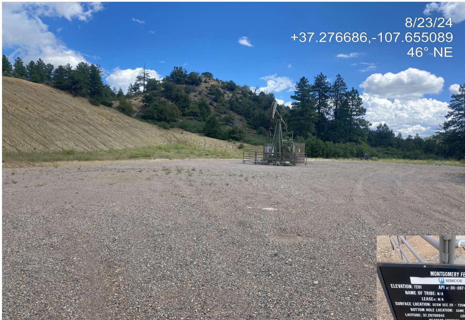
Photo 1. View of well pad taken from the access point facing center.