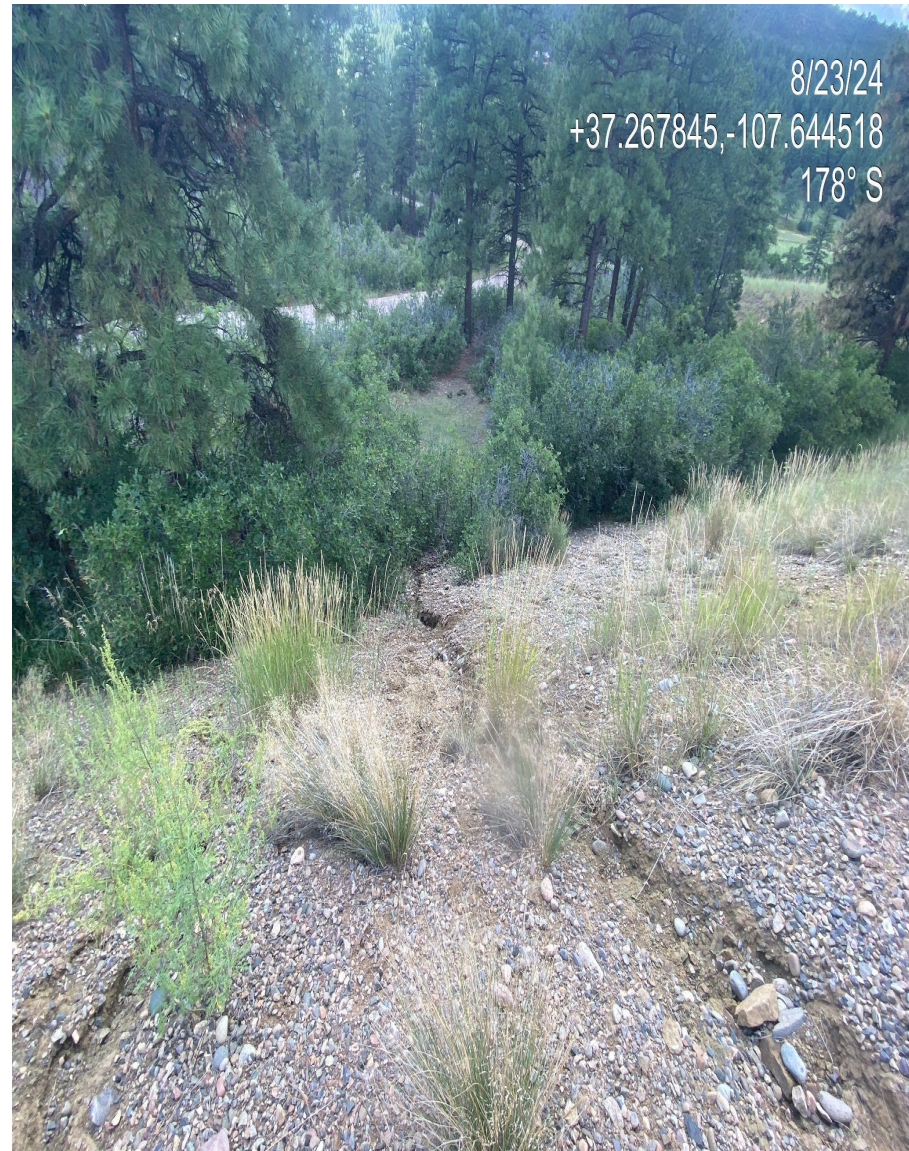
Photo 2. Gully erosion observed forming in the southern interim reclamation area, stabilization/control measures needed in this area.