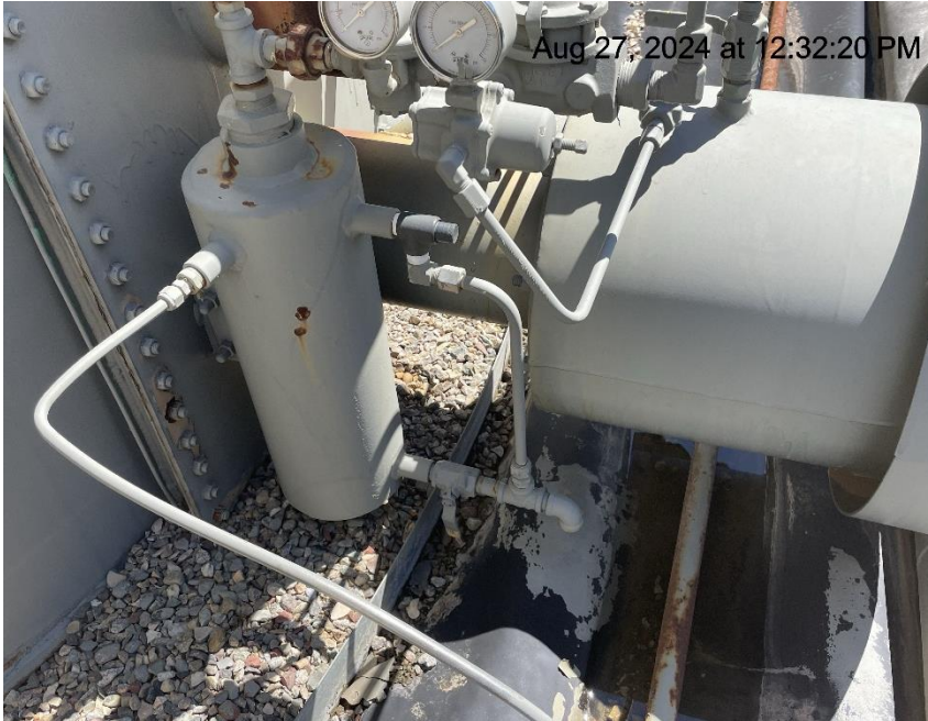
Photo # 6766 Multiple PRV vent lines do not comply with CECMC pressure safety device rules