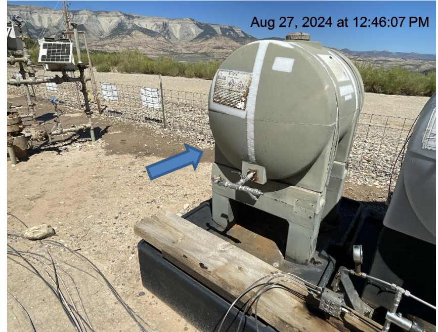
Photo # 6763 Unused equipment on location (labels on unused chemical tank are also illegible)