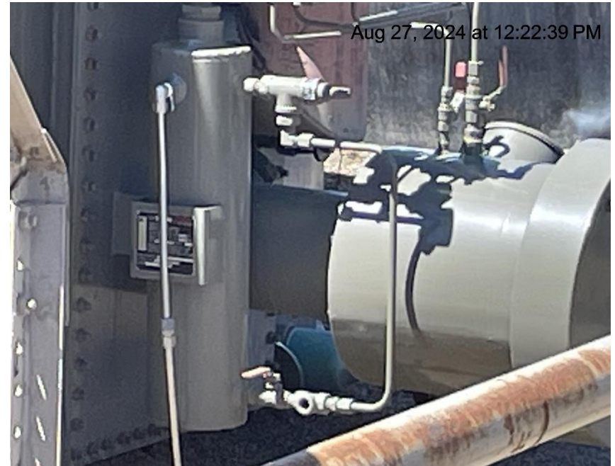
Photo # 6765 Multiple PRV vent lines do not comply with CECMC pressure safety device rules