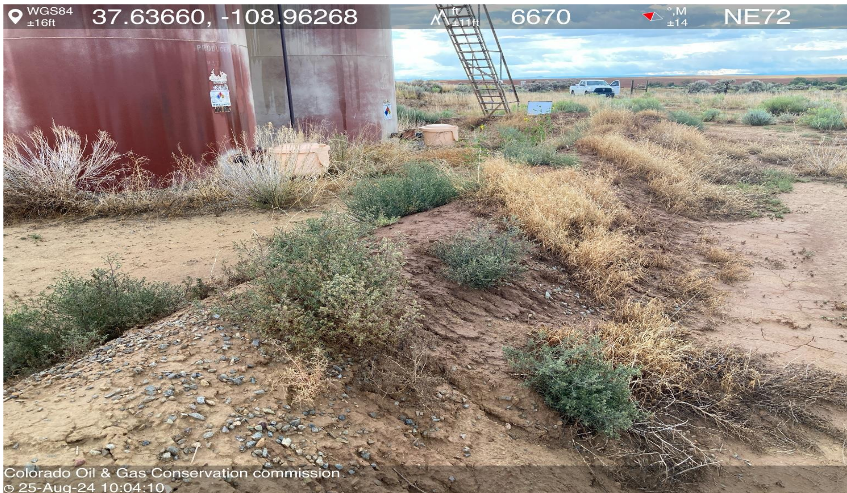
PHOTO 6: WELLHEAD AND EQUIPMENT/ WEEDS ON BURM SEE PHOTO 2 FOR CORRECTIVE ACTIONS.