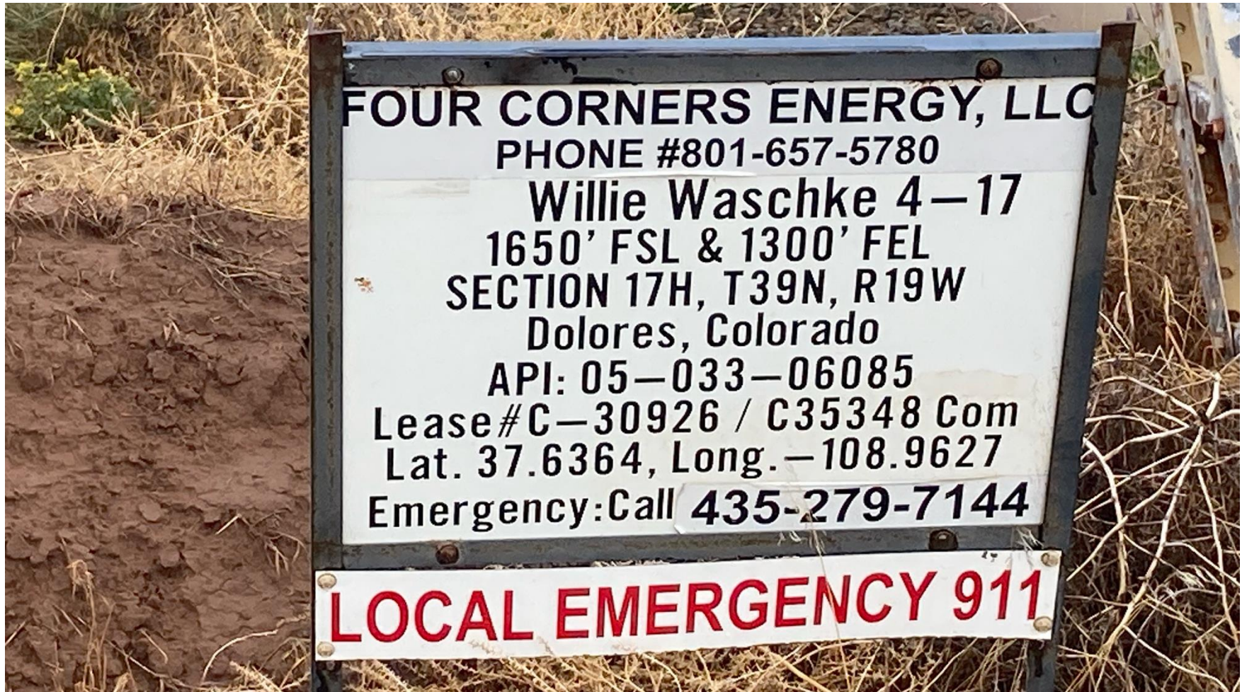
PHOTO 1: WELL SIGN/ COMPANY NAME POST ON LOCATION IS INACCURATE AND EMERGENCY CONTACT NUMBERS ARE INVALID. UPDATE EMERGENCY CONTACT PHONE NUMBER AS SOON AS POSSIBLE AND POST CURRENT OPERATOR NAME PER RULE 605.

WELL NAME: WILLIE WASCHKE 4-17, API #: 071-06085, INSP. # 695110170