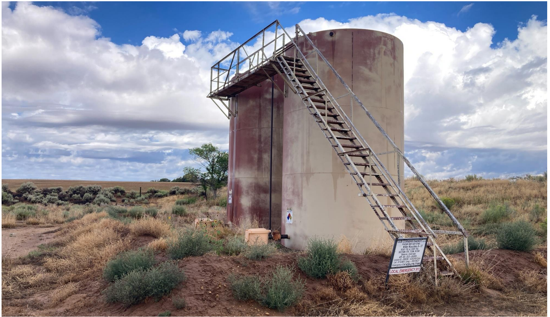
PHOTO 4: WELLHEAD AND EQUIPMENT/ WEEDS INSIDE BURM SEE PHOTO 2 FOR CORRECTIVE ACTIONS.