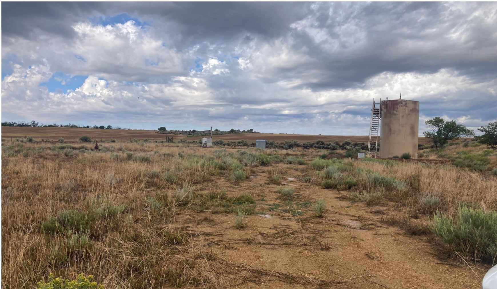
PHOTO 2: LOCATION/ WEED MAINTANANCE NEEDED THROUGHOUT THE LOCATION INSITER BURMS FOR TANK BATTERY AND HEATED SEPARATOR. MAINTAIN WEEDS THROUGHOUT LOCATION AND REMOVE ALL WEEDS INSIDE TANK BATTERY BURMS, Comply with Rule 603.f