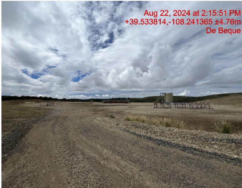
Entrance to location - Photo #04997