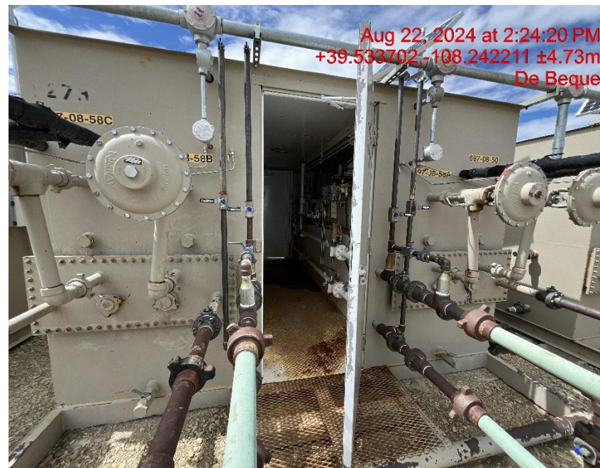
Separators - Photo #05005

Aug 22, 2024 at 2:24:20 PM +39.533702,-108.242211 ±4.73m De Beque