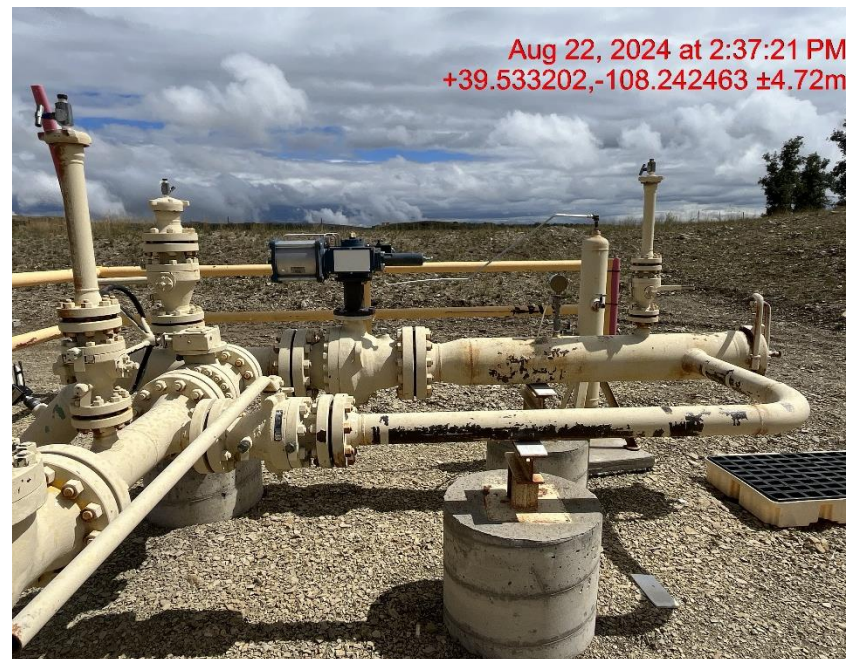
Pig station - Photo #05023