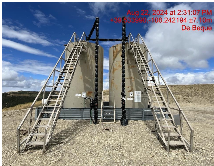
Tank battery - Photo #05015