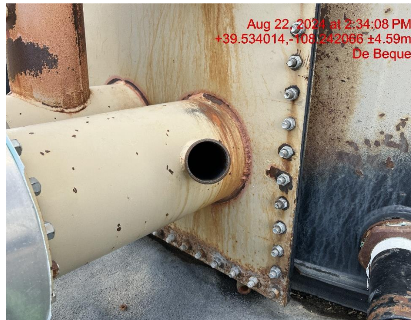
Open to wildlife - Photo #05020