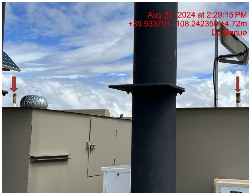
PRV's not capped - Photo #05013