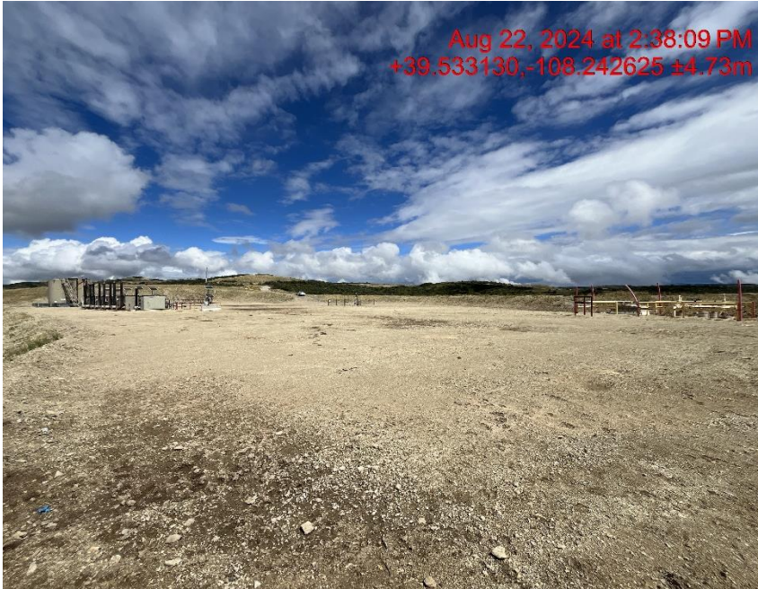
SW corner of location - Photo #05024