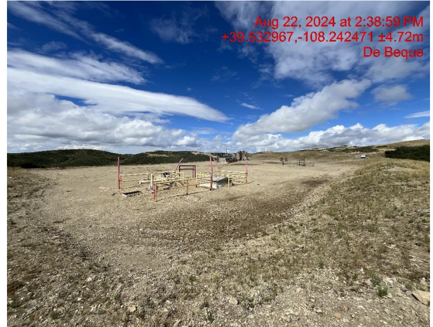
SE corner of location - Photo #05025