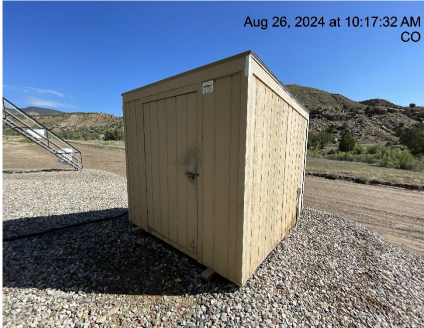
Photo # 6371 Chemical tanks located in shed, shed is not labeled to indicate potential hazards inside.