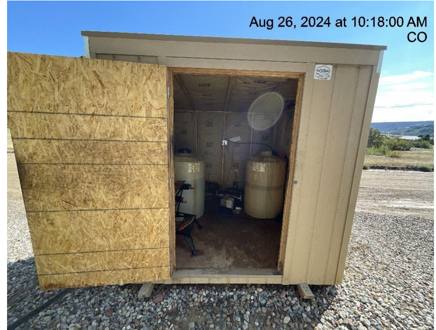
Photo # 6372 Chemical tanks located in shed, shed is not labeled to indicate potential hazards inside.