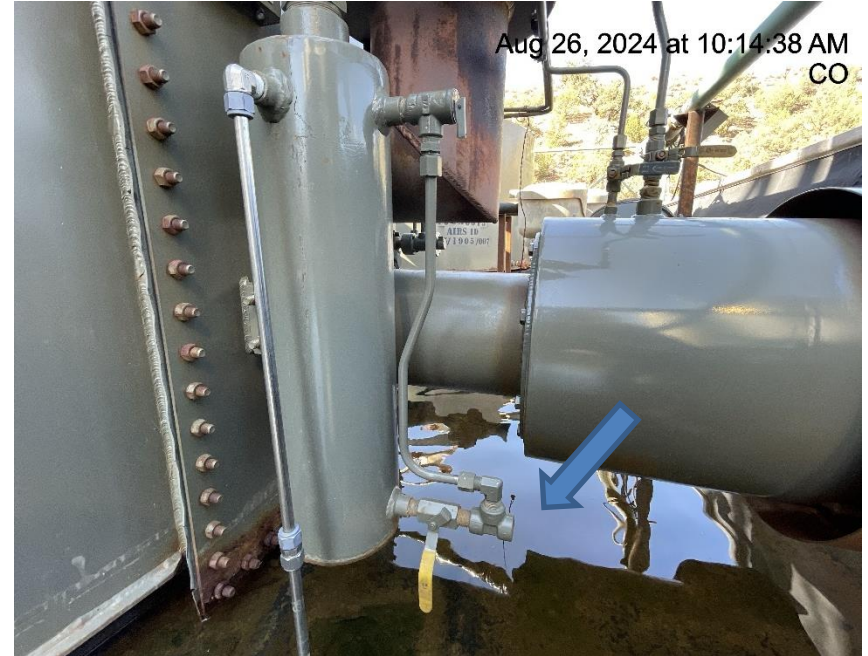
Photo # 6370 PRV vent line on tank burner does not comply with CECMC pressure safety device rules