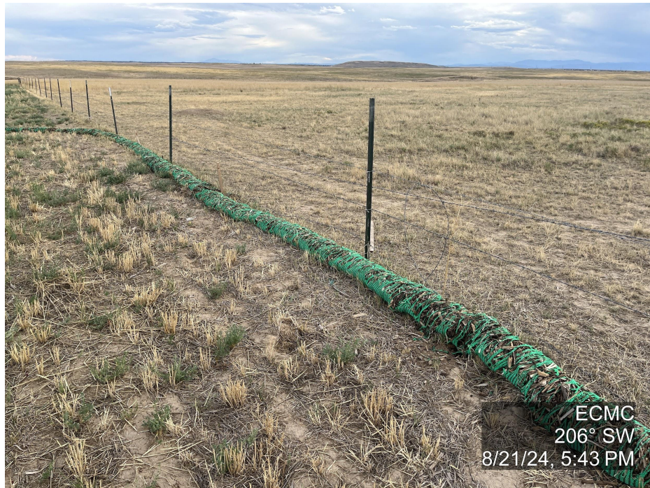
Photo 5. The photo was taken at the well location facing Southwest. The photo illustrates a representative photo of filterxx wattle across the location and demonstrates that the majority is filled with holes on the top side.

Note - The fence top wire was damage and in need of repair.