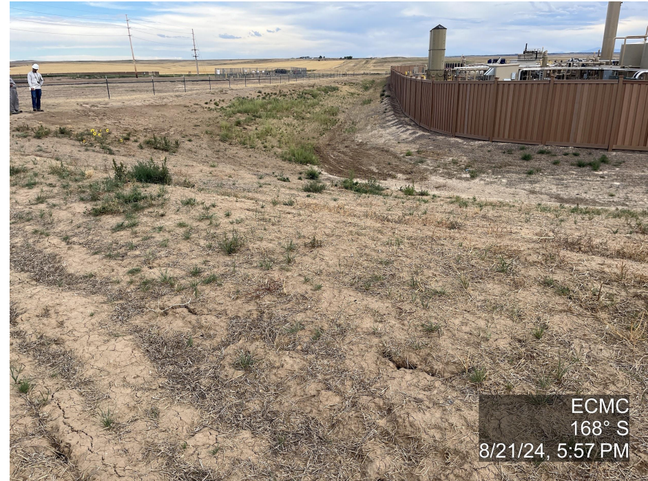
Photo 7. The photo was taken at the well location facing Southeast. The photo illustrates interim areas North of the location are vegetated with some bare spots.

Photo 8. The photo was taken at the well location facing South. Refer to the comment for photo 7.