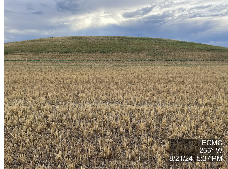
Photo 3. The photo was taken at the well location facing South. The photo illustrates interim areas outside the permanent location fence are dominated by triticale and have been mowed.

Photo 4. The photo was taken at the well location facing West. The photo illustrates the topsoil stockpile is being managed by evidence of mowing however it's dominated by kochia and triticale.