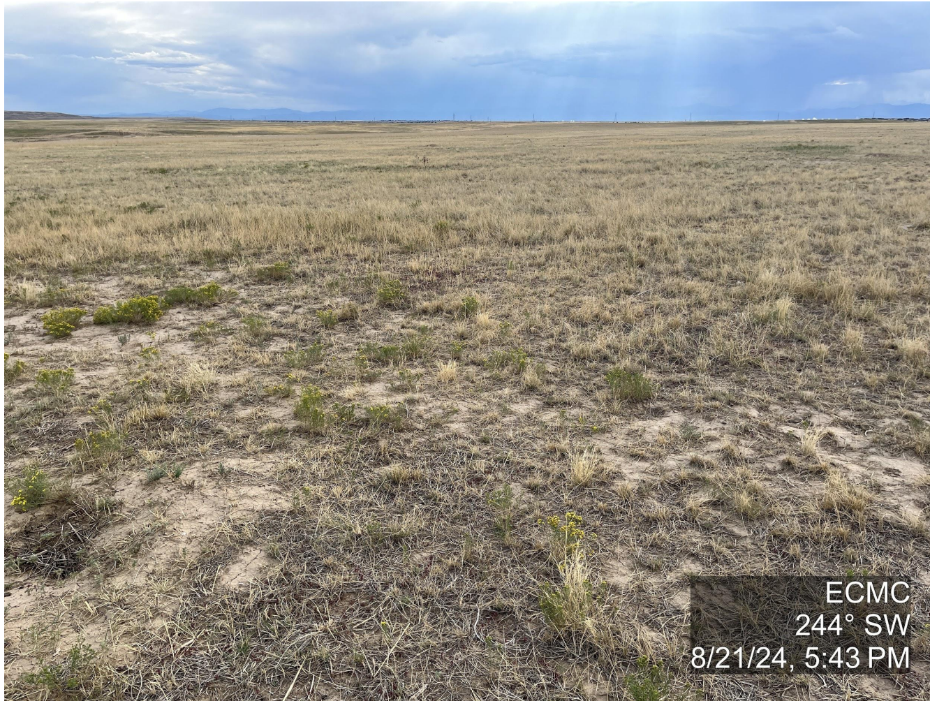
Photo 11. The reference photo was taken southwest of the well location facing Southwest.