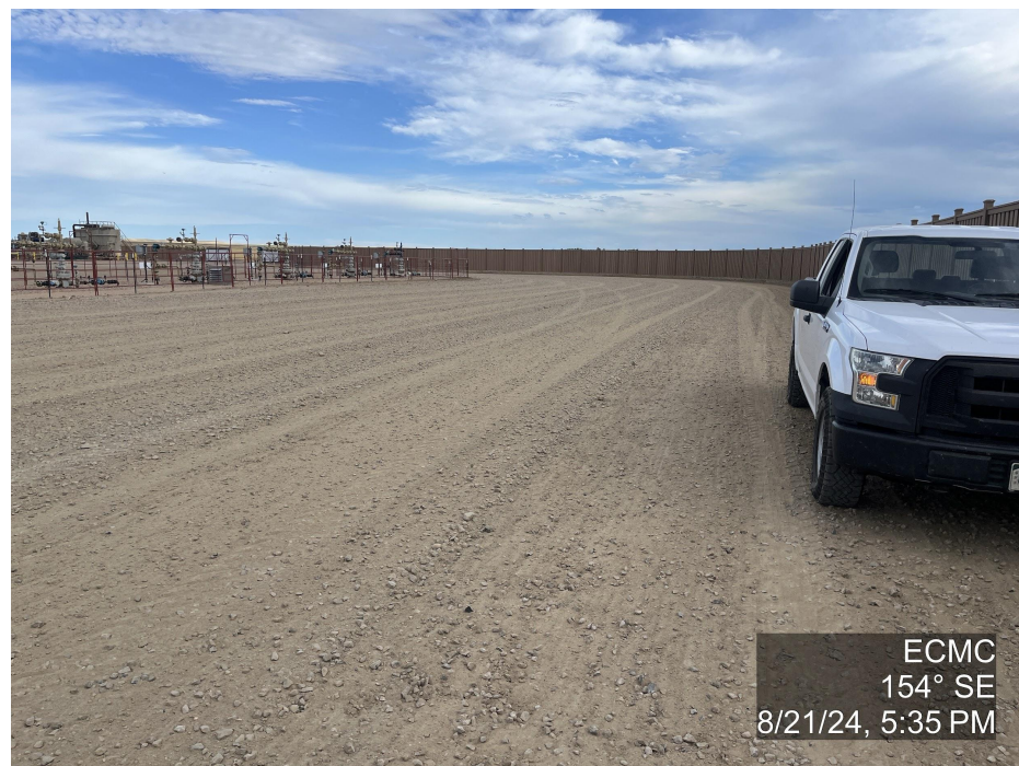
Photo 1. The photo was taken at the well location facing East. The photo illustrates location signage at the tank batteries.