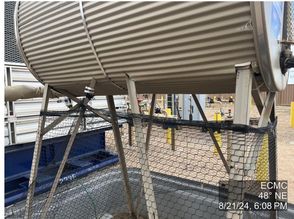
Photo 10. The photo was taken at the well location facing Northeast. Refer to the comment for photo 9 .