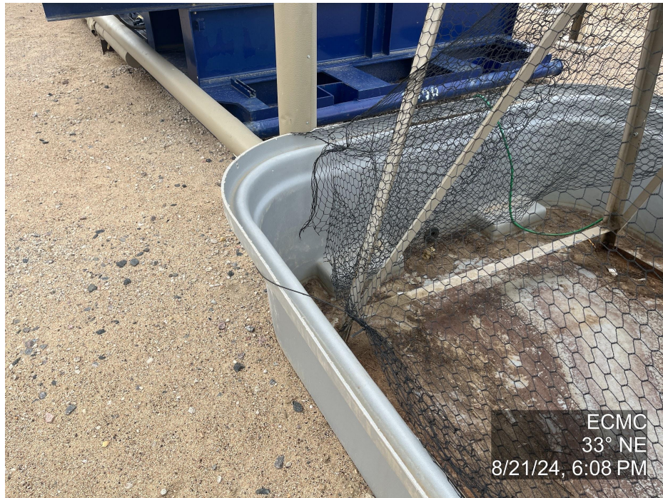
Photo 9. The photo was taken at the well location facing Northeast. The photo illustrates wildlife netting on secondary containment has not been secured correctly creating gaps where wildlife can enter.