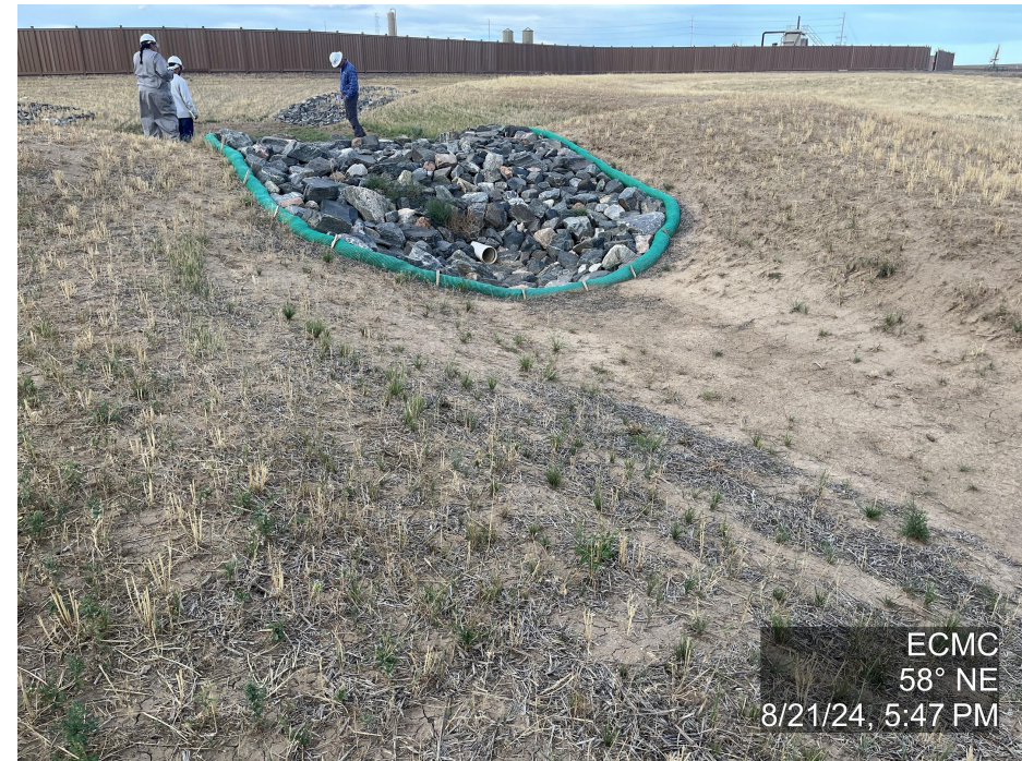
Photo 6. The photo was taken at the well location facing Northeast. The photo illustrates the sediment trap in the Southwest corner of the location.

Note - The fence top wire was damage and in need of repair.