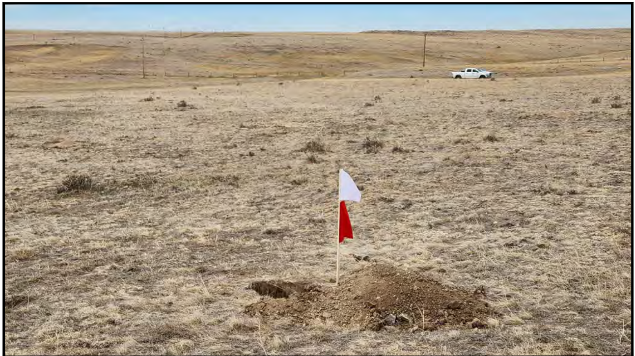
PHOTO: VIEW OF AS-DRILLED LOCATION