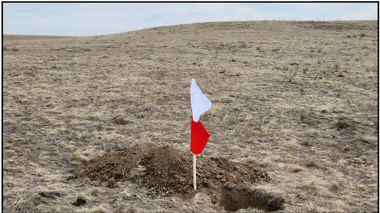
PHOTO: VIEW OF AS-DRILLED LOCATION