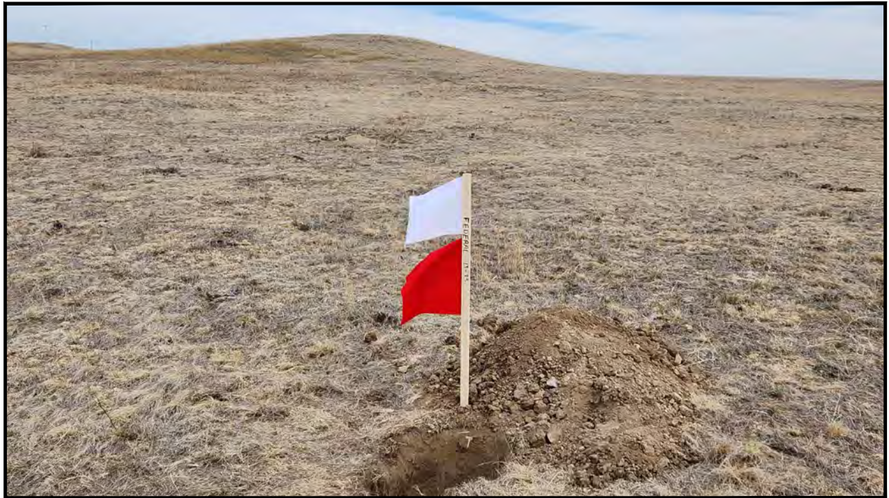
PHOTO: VIEW OF AS-DRILLED LOCATION