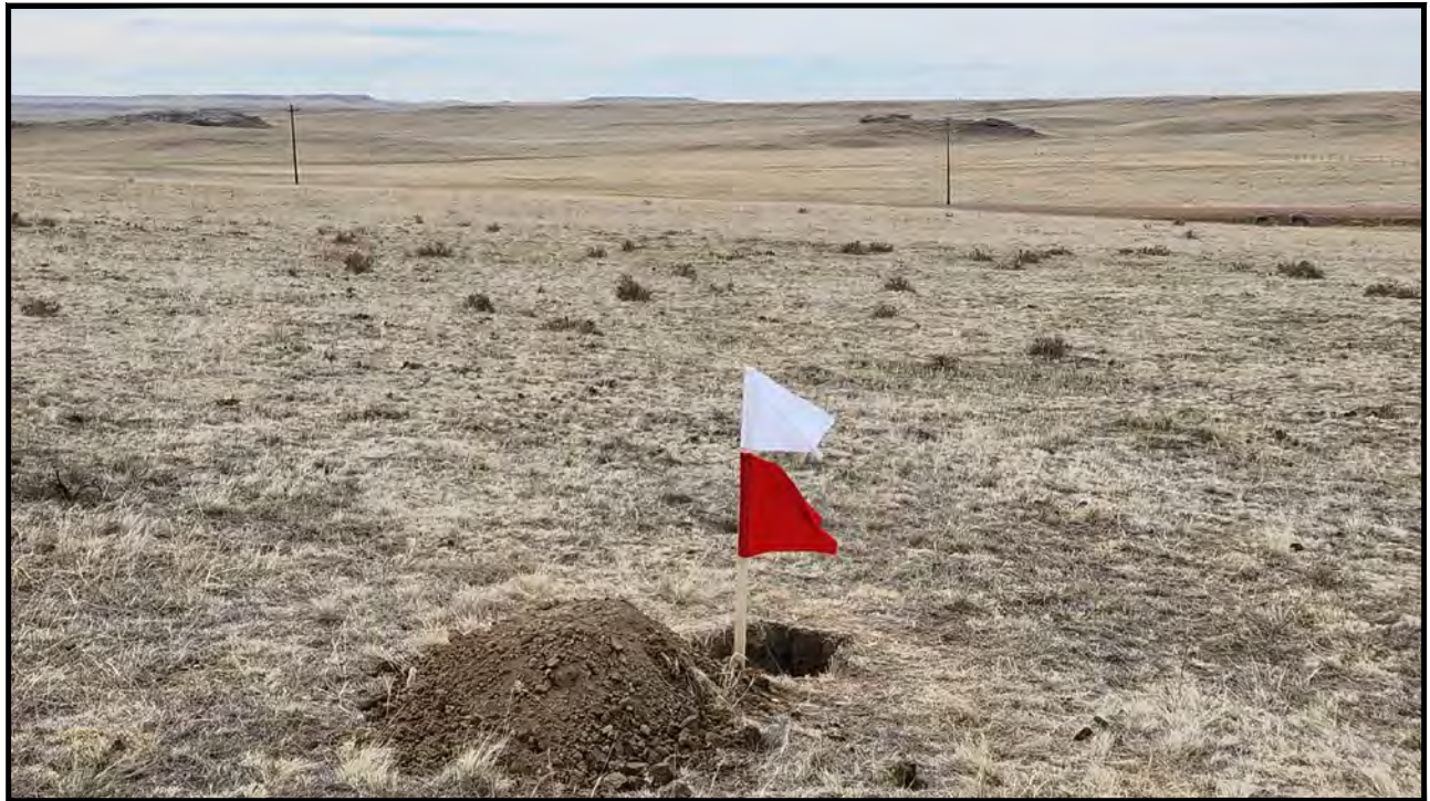
PHOTO: VIEW OF AS-DRILLED LOCATION