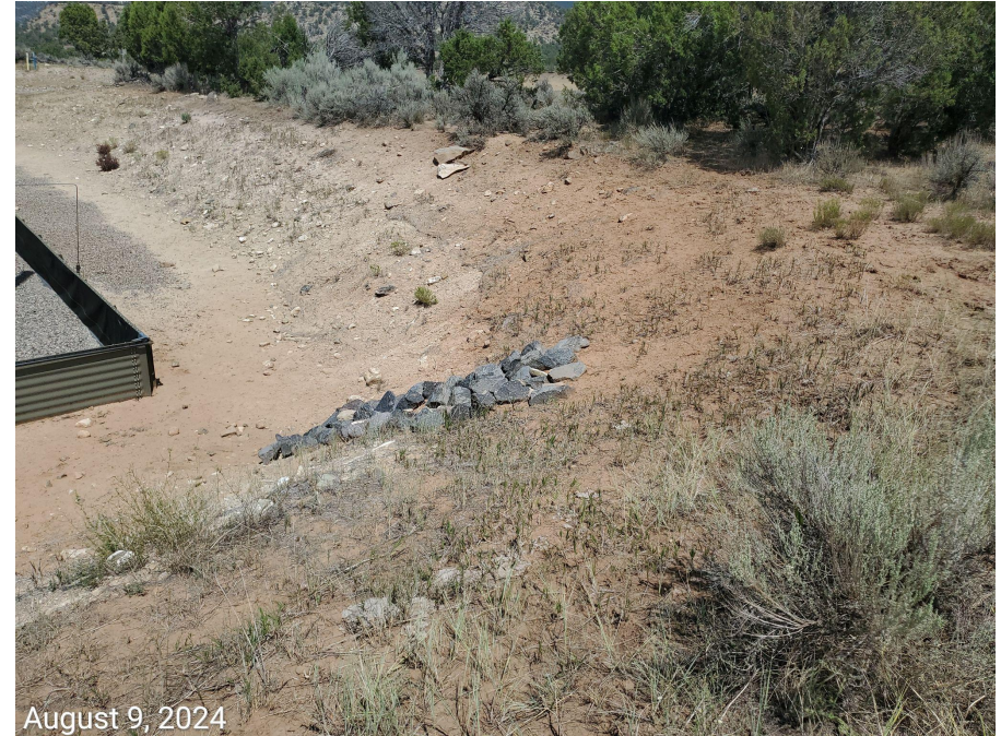
Photo 5: Photos taken from interim areas and slopes the the Battery Facility Location. Areas are predominantly bare and exposed soils; slopes lacks stabilization.