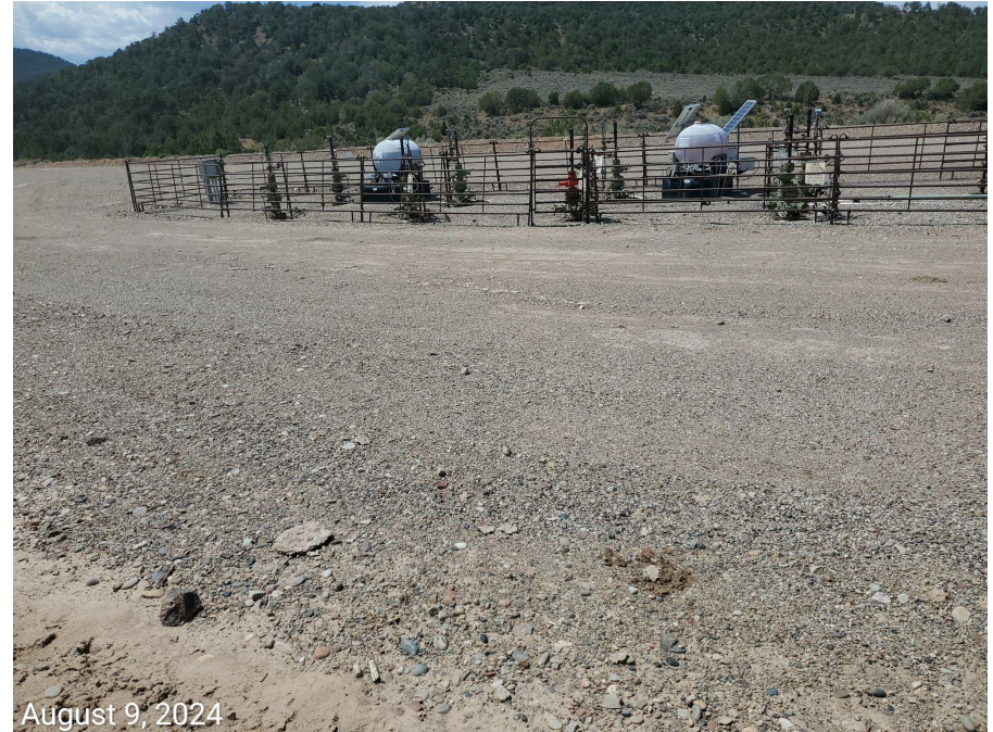
Photo 1: Photos taken from the east end of the well Location. Photos provide an overview of the working pad from south, southwest, northwest to north.