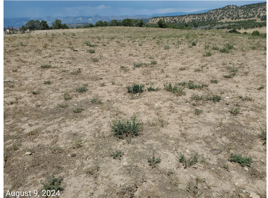
Photo 3: Photos taken from the interim areas of the Location. Location is not progressing towards 1003 reclamation standards; perennial establishment is not uniform and location is predominantly bare. Green vegetation observed is predominantly alfalfa and not reflective of the species within the adjacent reference areas