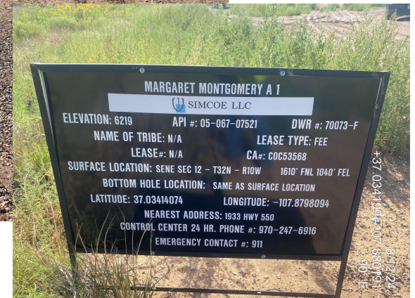
Photo 1. View of the location taken from the access point facing center.