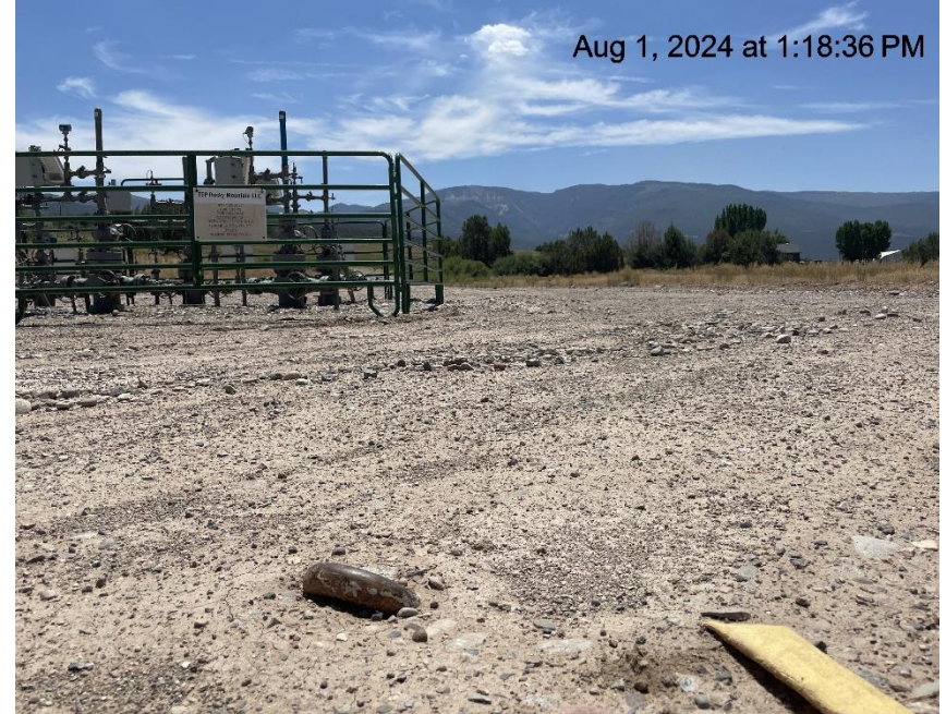
Photo # 4440 Same improperly marked deadman from a different angle