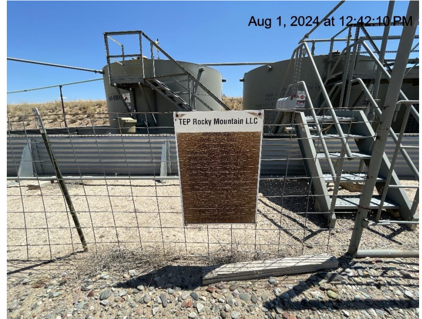
Photo # 4434 Battery sign weathered & cracking/becoming illegible/does not comply with CECMC rules