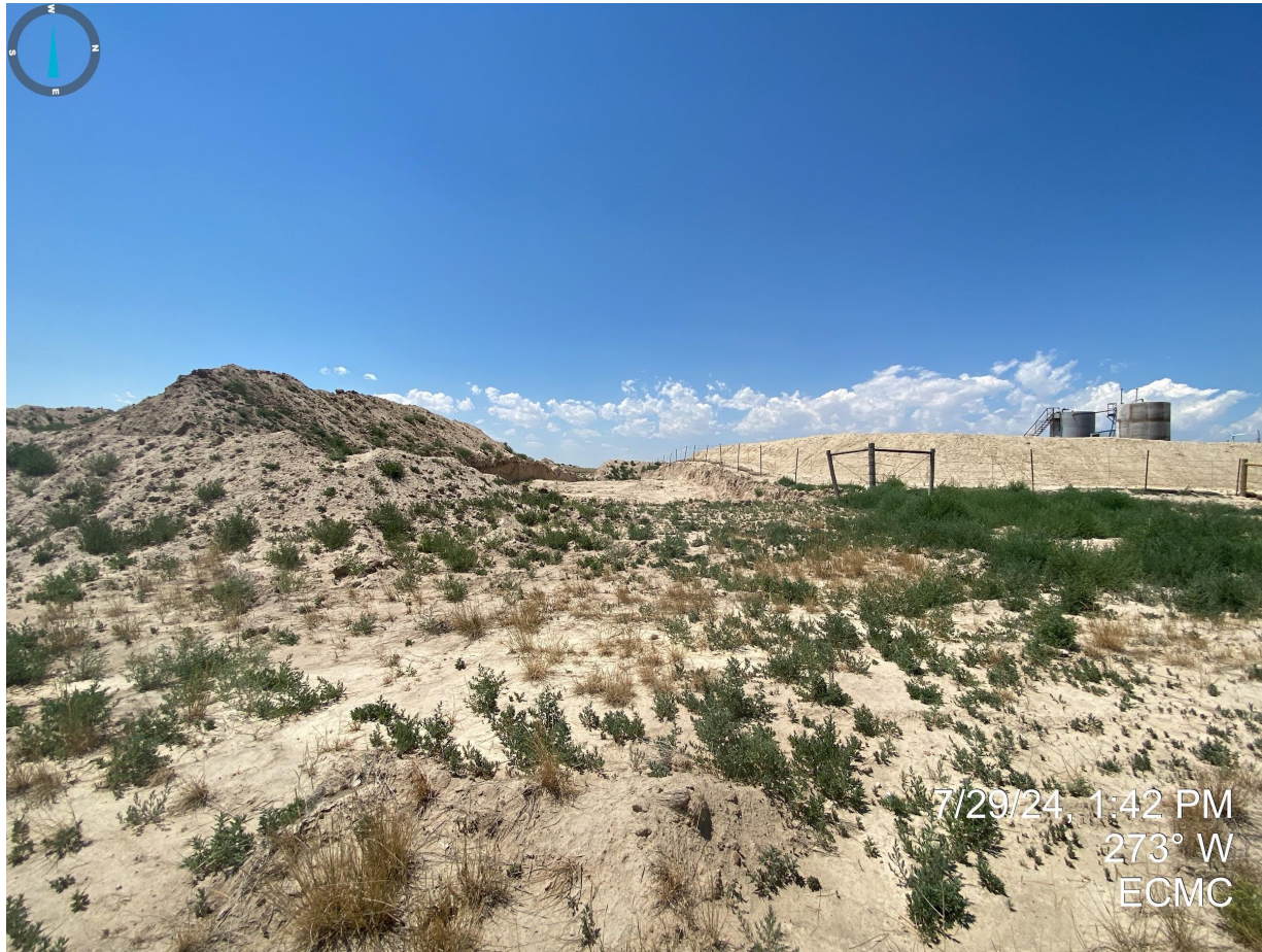
Photo 16. Undesirable vegetation (kochia and russian thistle) observed throughout the location and excavation areas.