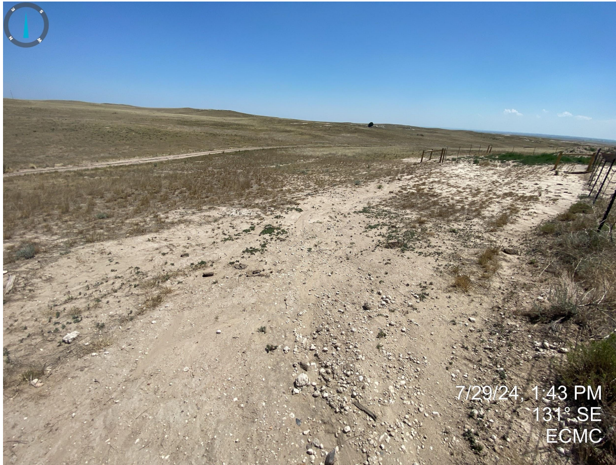
Photo 19. Continued from Photo 18, facing southeast.