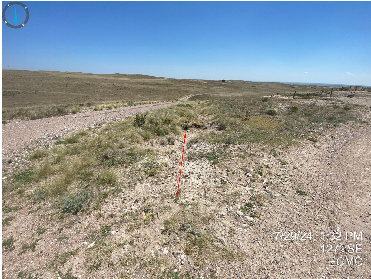
Photo 3. Taken north of pit. Evidence of erosion degradation, previously documented, does not appear to have been repaired/stabilized with no evidence of control measures/BMPs observed that would prevent further erosion of the production areas and access roads.