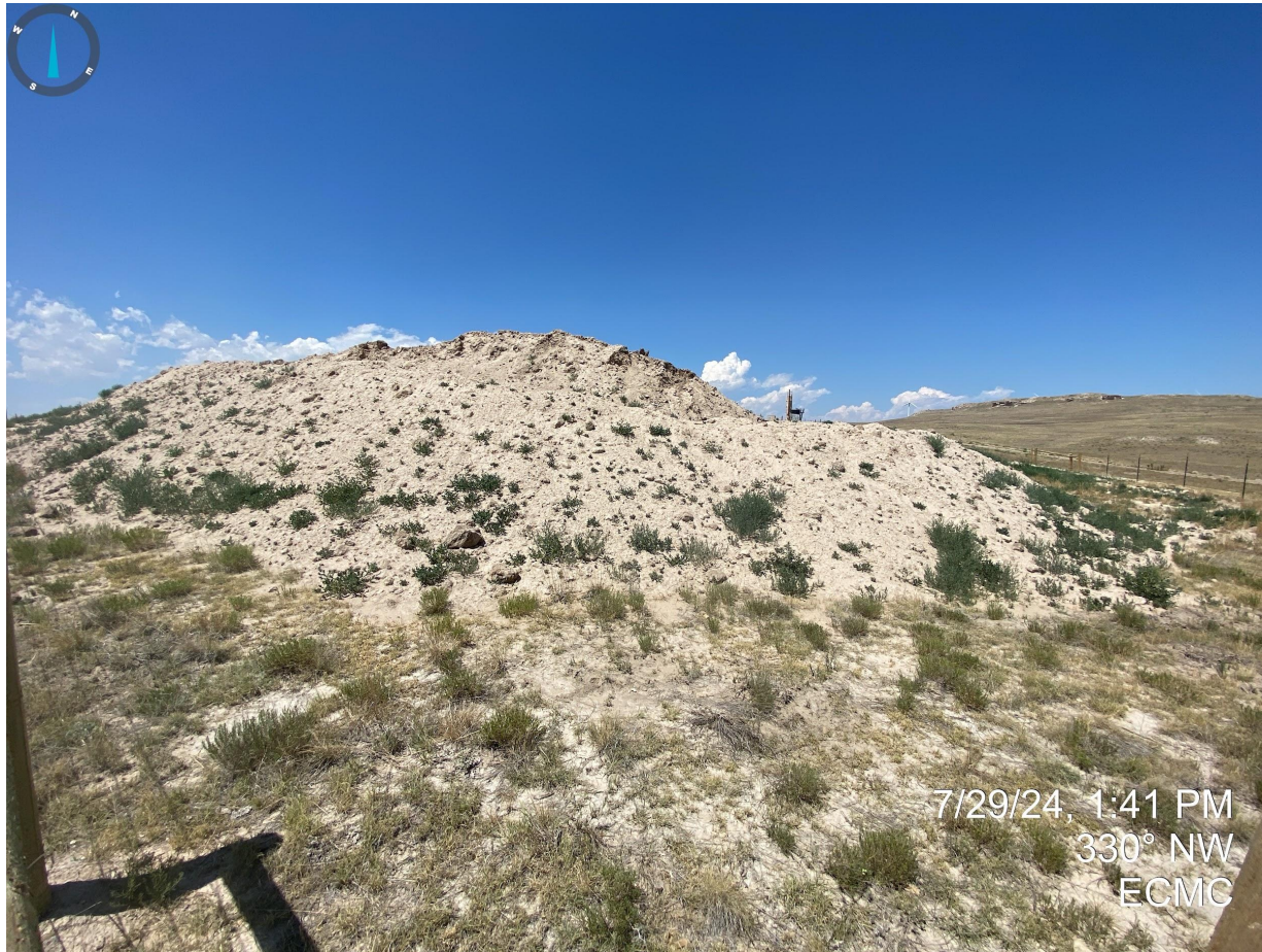
Photo 14. Taken from the southeast corner of the stockpiled material; see comments in Photo 11.