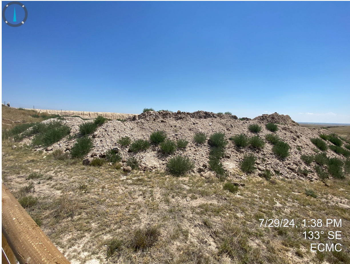
Photo 11. Taken from the north side of the stockpiled soils. No perimeter stormwater control measures/BMPs, or impermeable liners underneath the stockpile were observed during this inspection. Impacted soils appear to have been placed directly on top of undisturbed lands. Additionally, it does not appear that topsoil has been salvaged Per Rule 1002.b prior to stockpiling the soil on undisturbed portions of land.