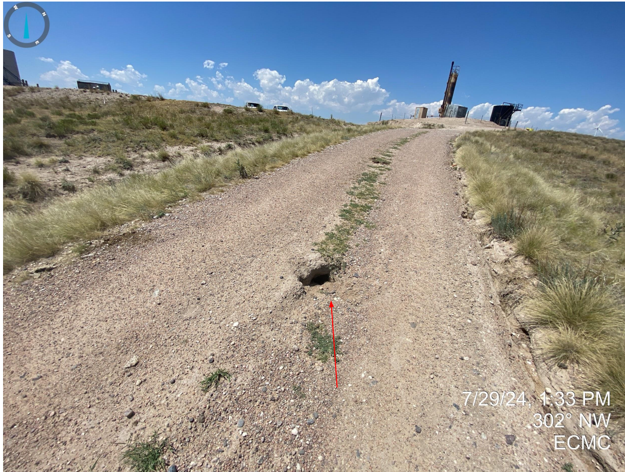
Photo 6. Pothole/subsidence observed along the access road.