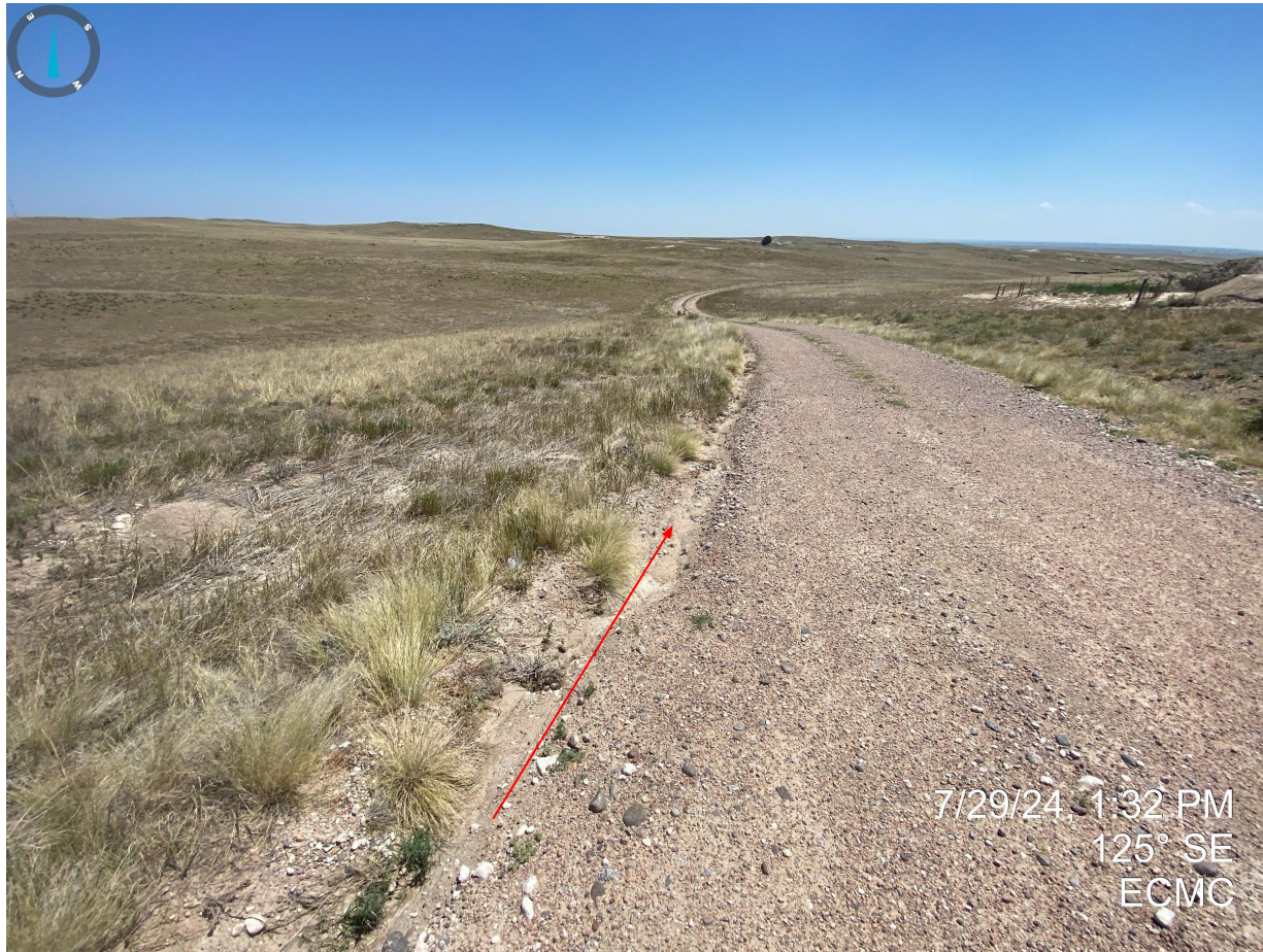
Photo 5. Taken from the access road northeast of the pit. See comments in Photo 3.