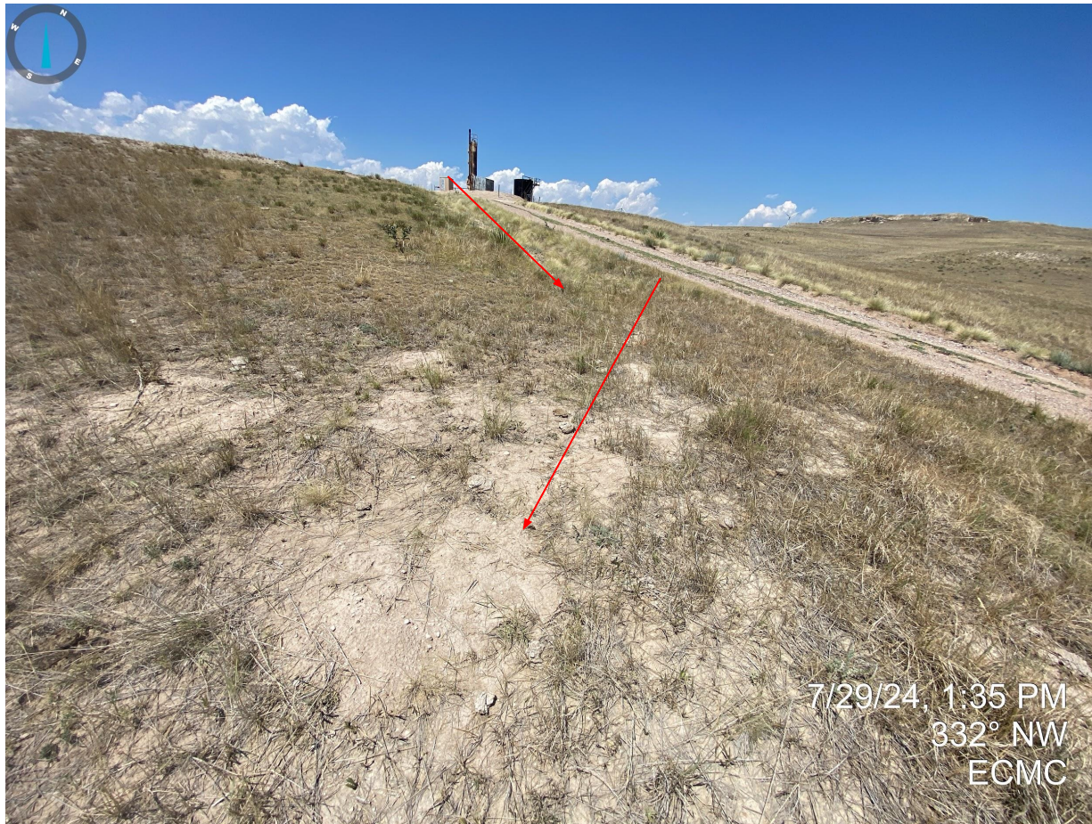
Photo 10. Sediment deposition and erosion degradation south of the access road, near the pit.