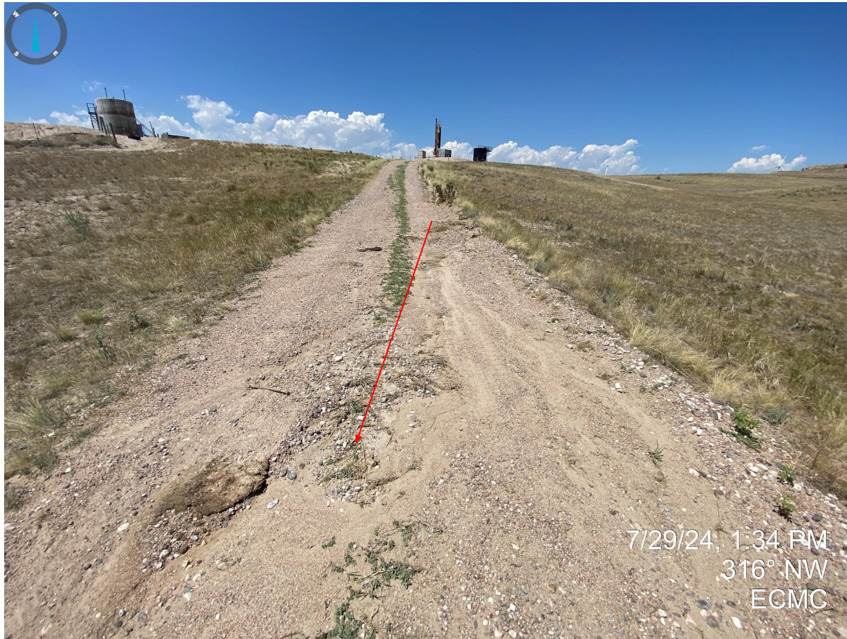
Photo 9. Facing northwest along the access road; see comments in Photo 3.