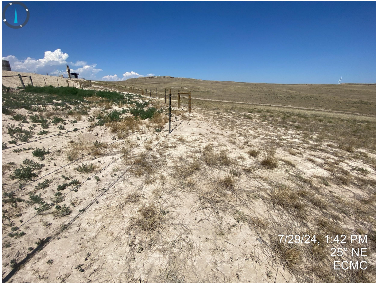
Photo 15. Taken southeast of the excavated area and stockpiled material; see comments in Photo 11.