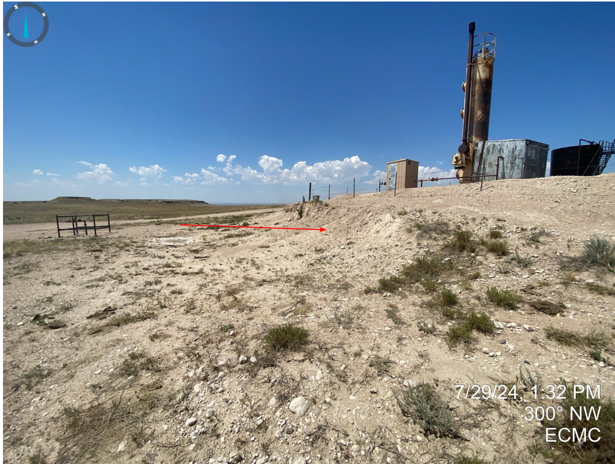
Photo 1. Areas experiencing erosion degradation throughout the production areas do not appear to have been repaired/stabilized and there is no evidence of stormwater controls measures/BMPs having been implemented.