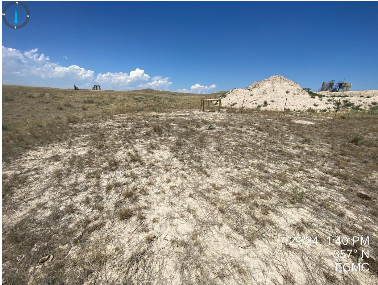
Photo 12. Sediment deposition resulting from unstabilized stockpiles, southwest corner of the pit.