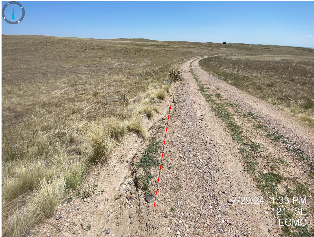
Photo 7. Facing southeast along the access road; see comments in Photo 3.