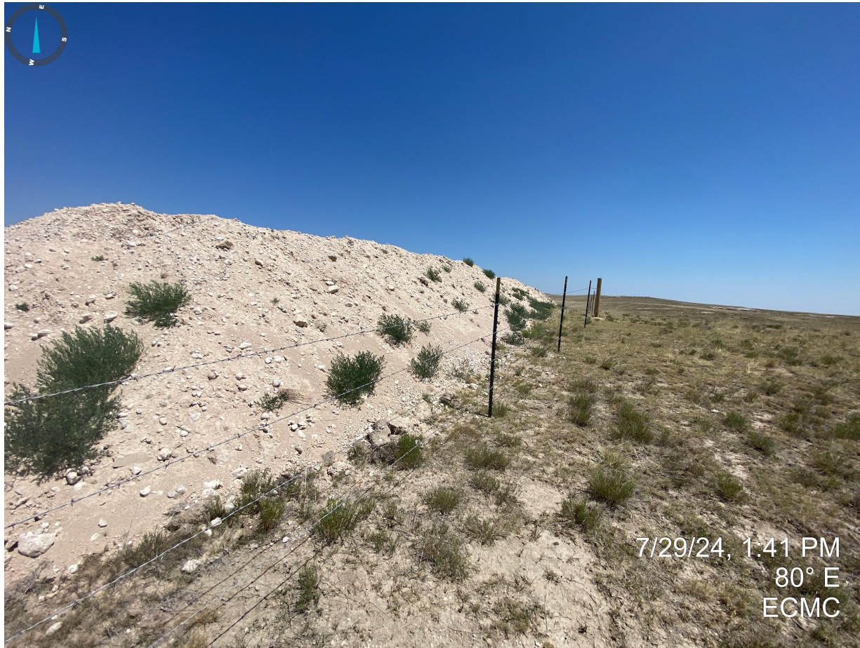
Photo 13. Taken from the southern portion of the stockpiled material; see comments in Photo 11.