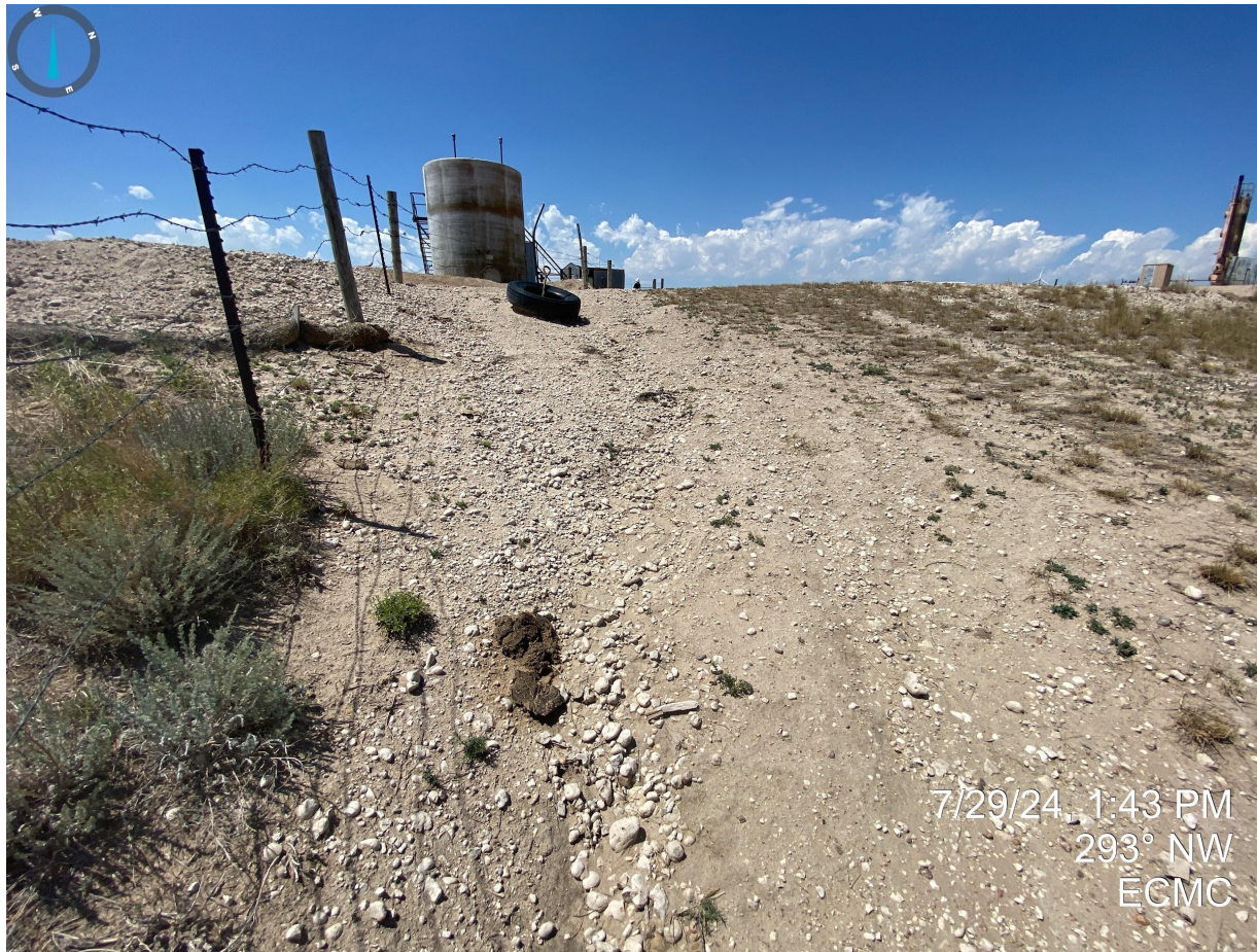
Photo 18. Erosion degradation occurring on the northern/eastern portion of the production areas, near the pit; stormwater control measures remain inadequate.