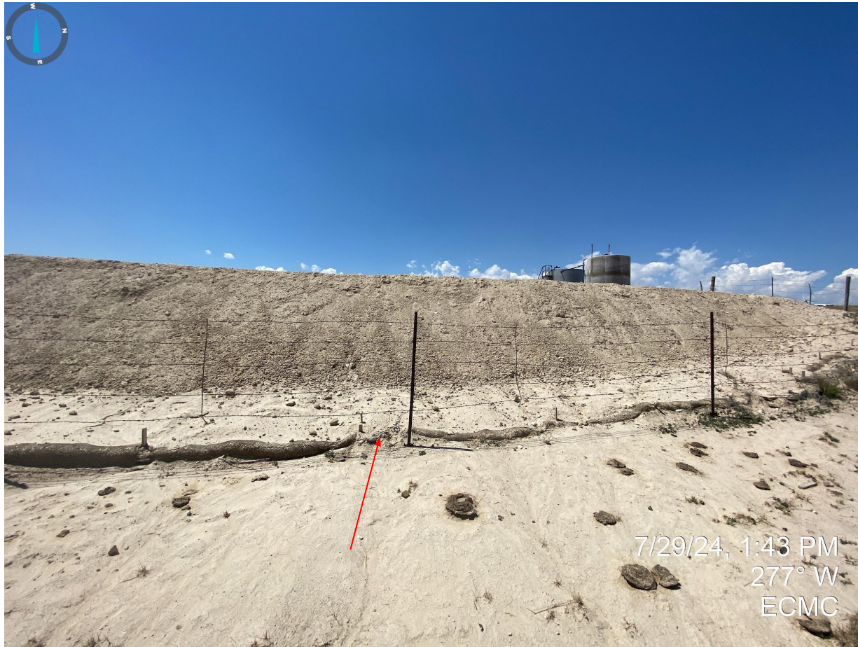
Photo 17. Erosion degradation appears to have been repaired on the eastern pit walls. Stormwater control measures remain inadequate.