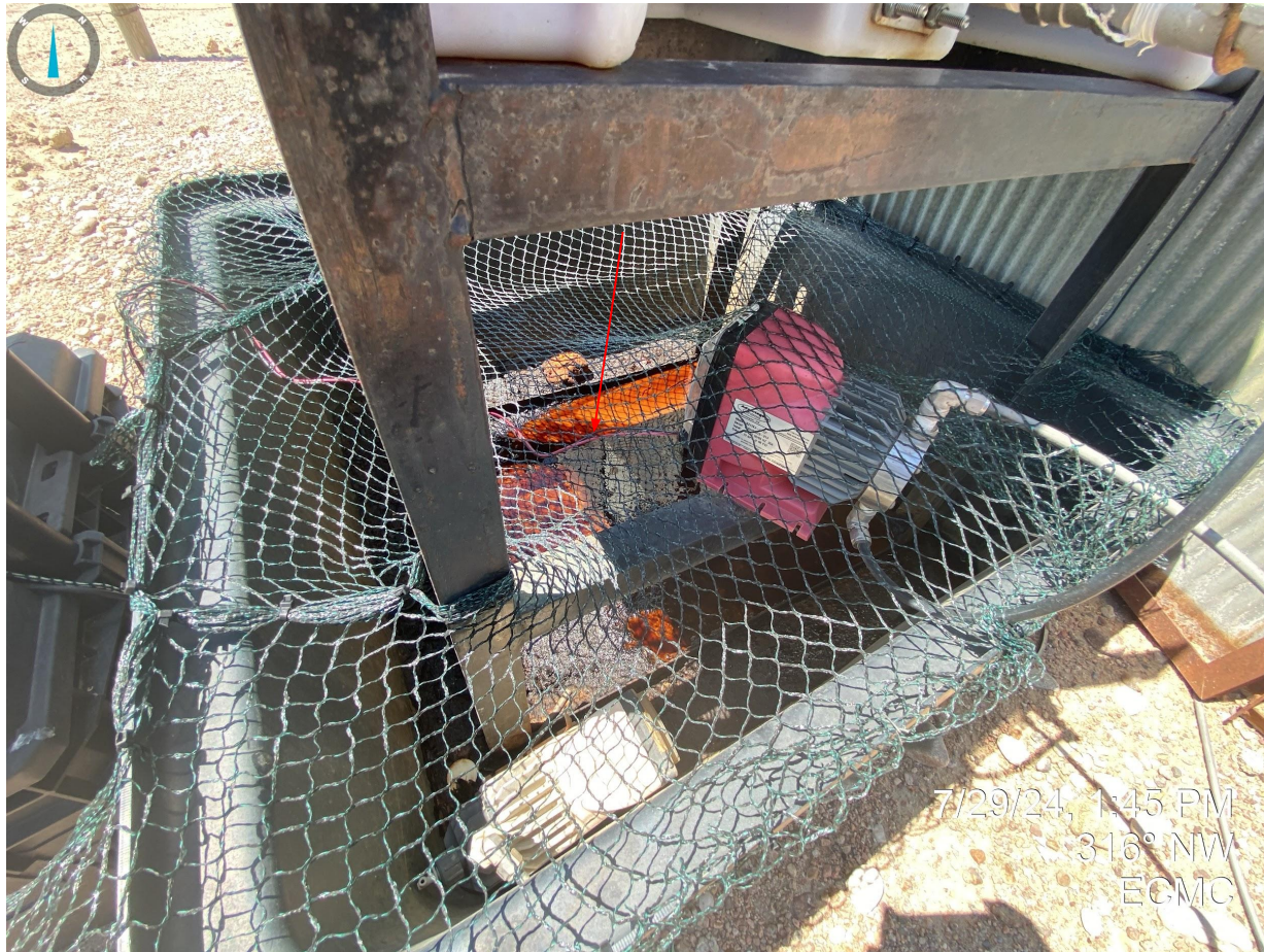
Photo 20. Free fluids observed within secondary containment have not been properly disposed of.