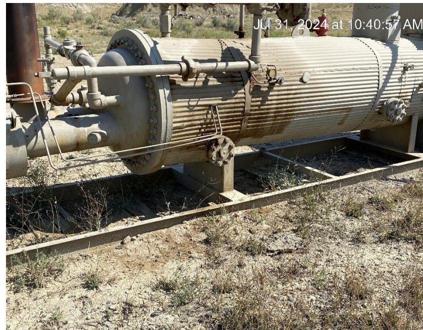
Oily waste and stained soil