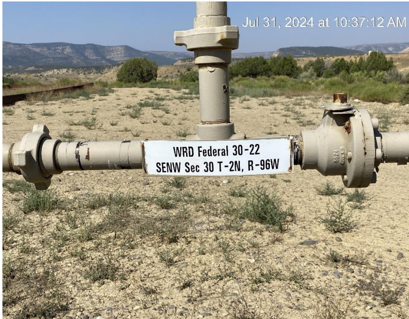
When replaced additional information is required