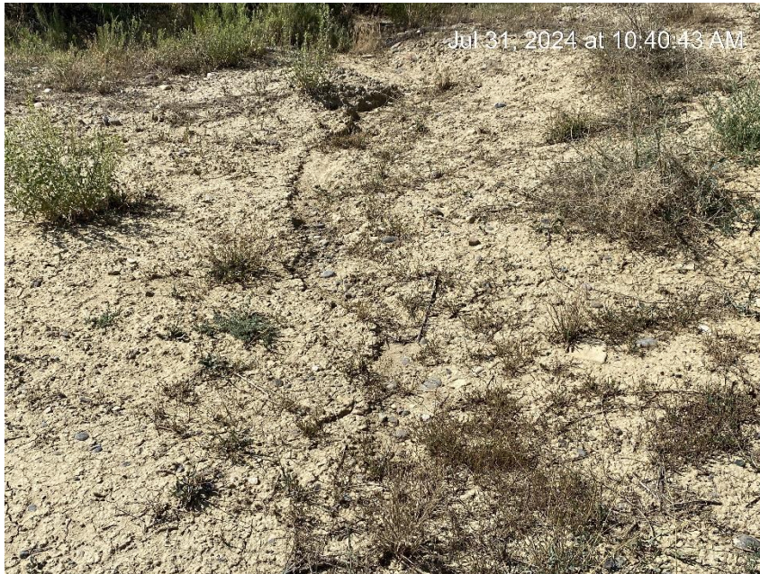
Erosion and sediment migration