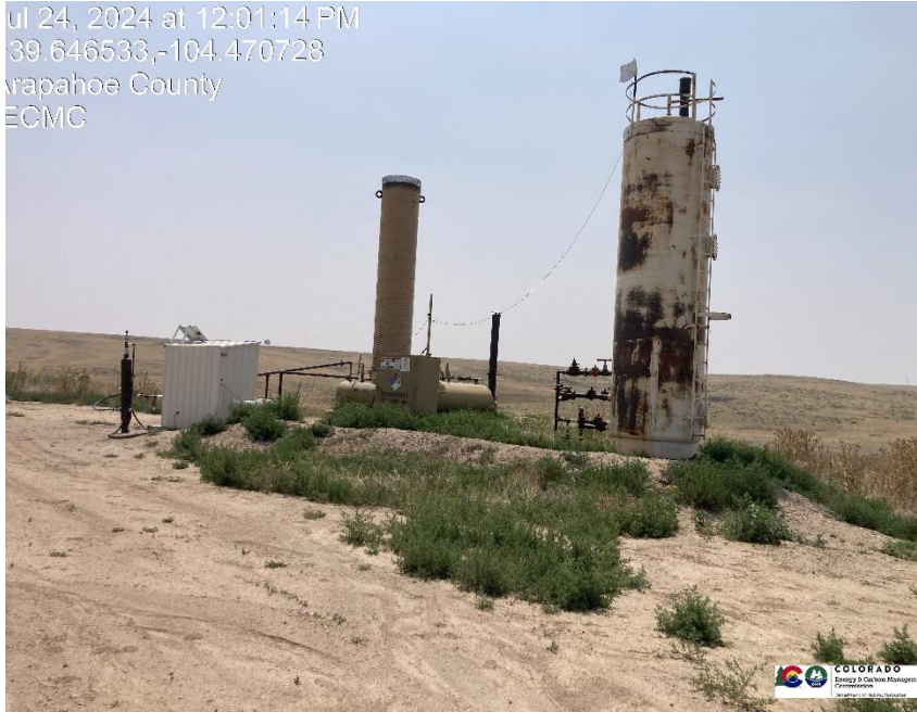
Pic 1 separators, GMR, weeds unmanaged

Jul 24, 2024 at 12:01:14 PM 39.646533,-104.470728 Wapahoe County ECMC