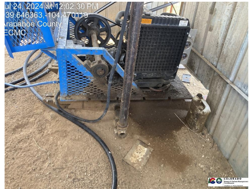
Pic 4 motor house / stained soil