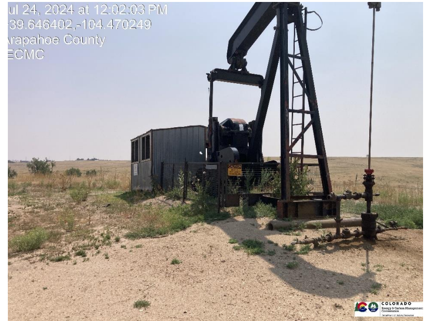
Pic 2 Wellhead / pump jack / stained soil by wellhead

Jul 24, 2024 at 12:02:03 PM 39.646402,-104.470249 Wapahoe County ECMC