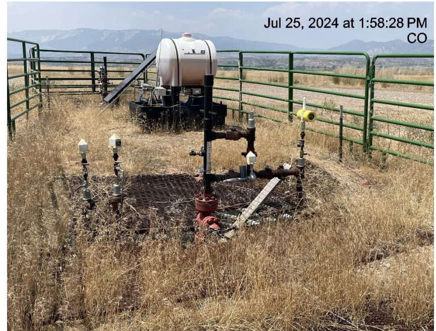
Photo # 3418 Dead weeds/debris near wellheads & chemical tank that is causing a fire hazard