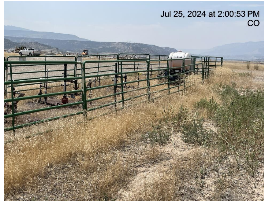
Photo # 3416 Dead weeds/debris near wellheads & chemical tank that is causing a fire hazard