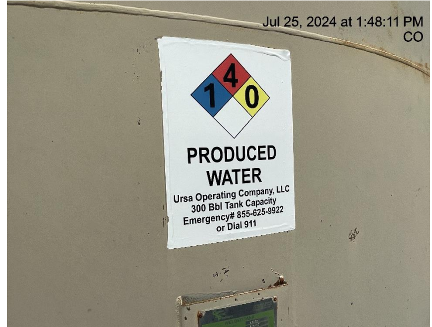
Photo # 3422 Tank label contains inaccurate info/does not comply with CECMC rules