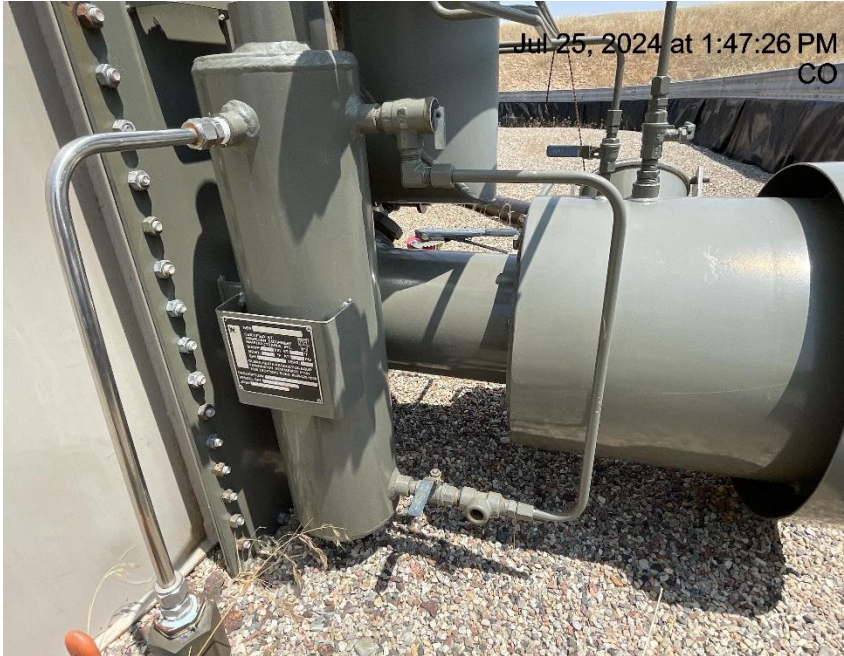
Photo # 3421 PRV vent line does not comply with CECMC pressure safety device rules