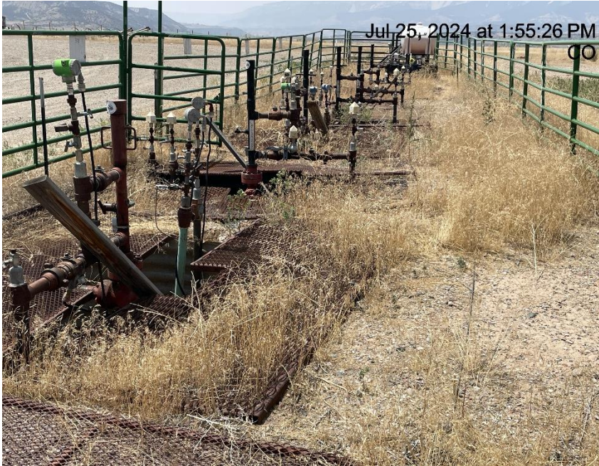
Photo # 3419 Dead weeds/debris near wellheads & chemical tank that is causing a fire hazard