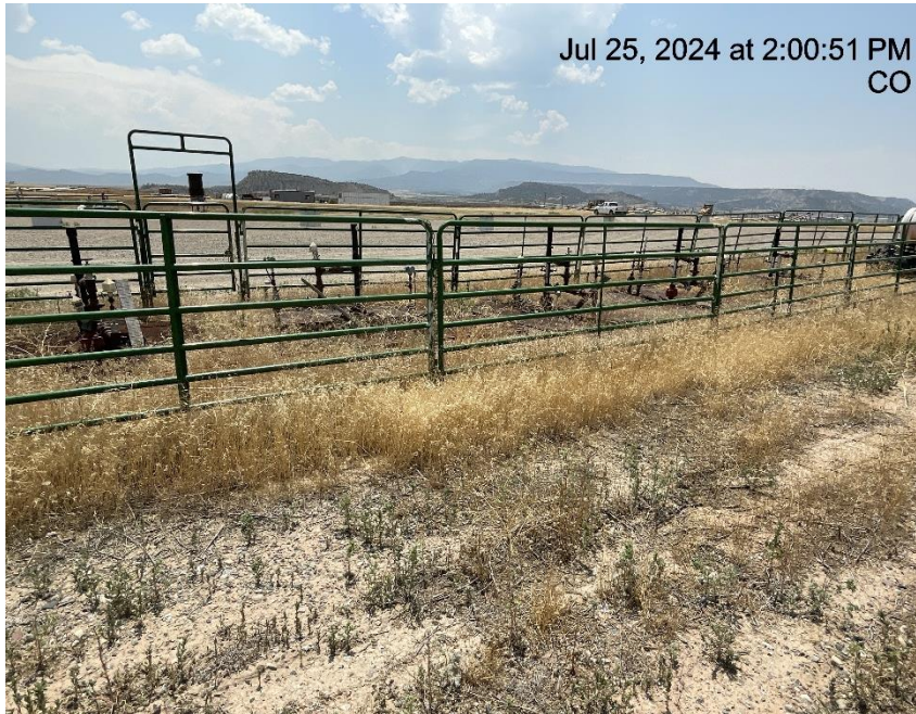
Photo # 3417 Dead weeds/debris near wellheads & chemical tank that is causing a fire hazard